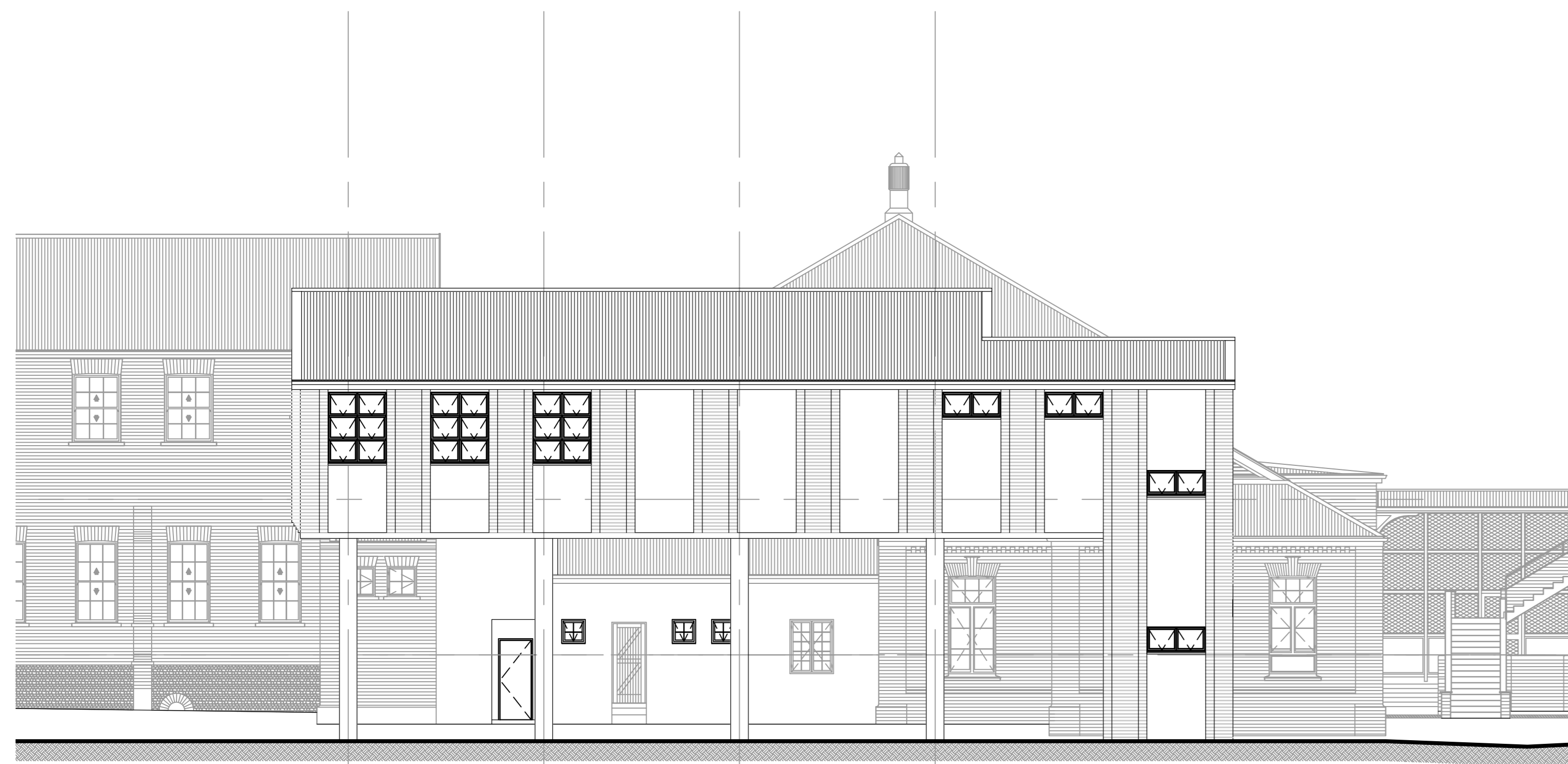
NEW BUILDING SOUTH EAST ELEVATION (Scale 1 : 100)