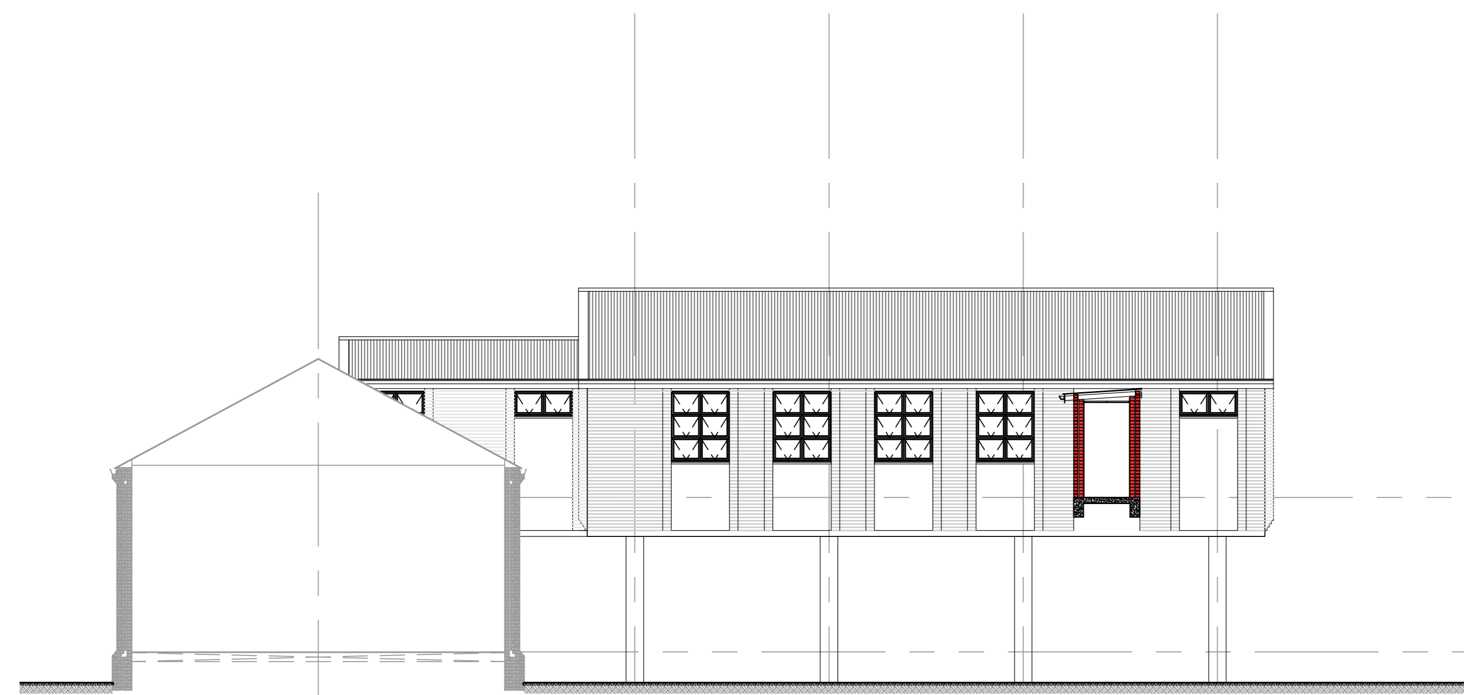
NEW BUILDING NORTH WEST ELEVATION (Scale 1 : 100)