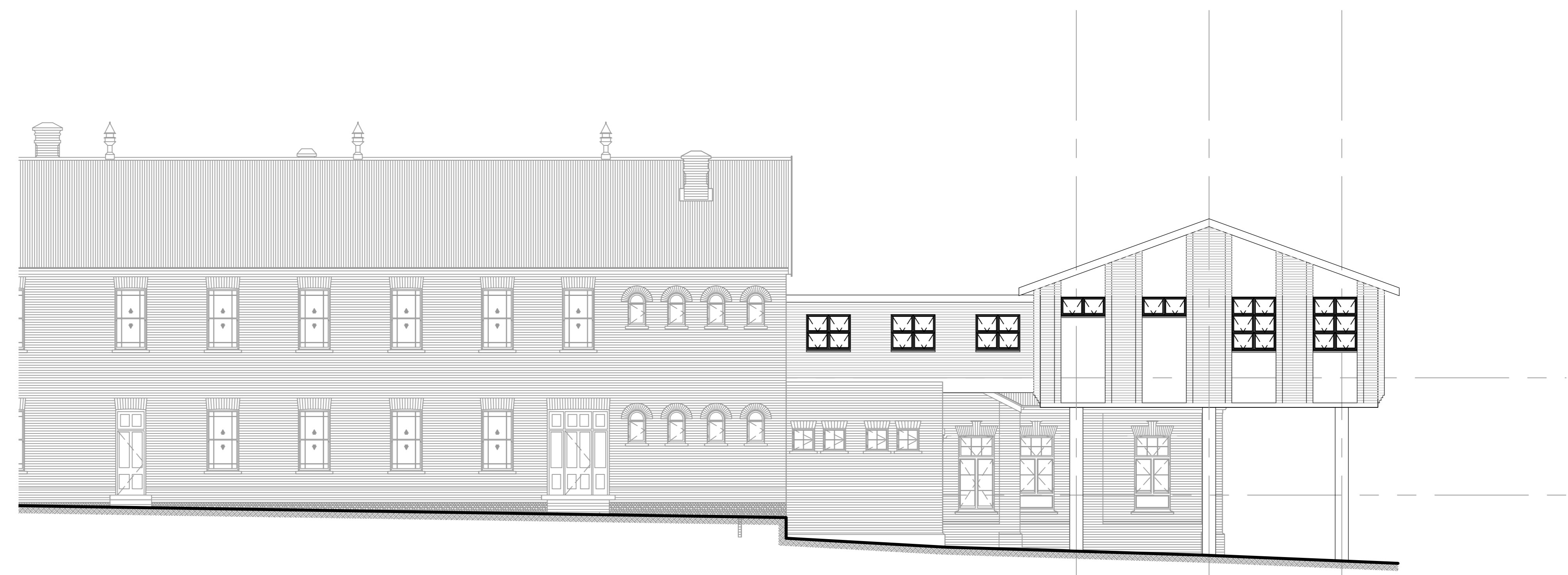
NEW BUILDING NORTH EAST ELEVATION (Scale 1 : 100)