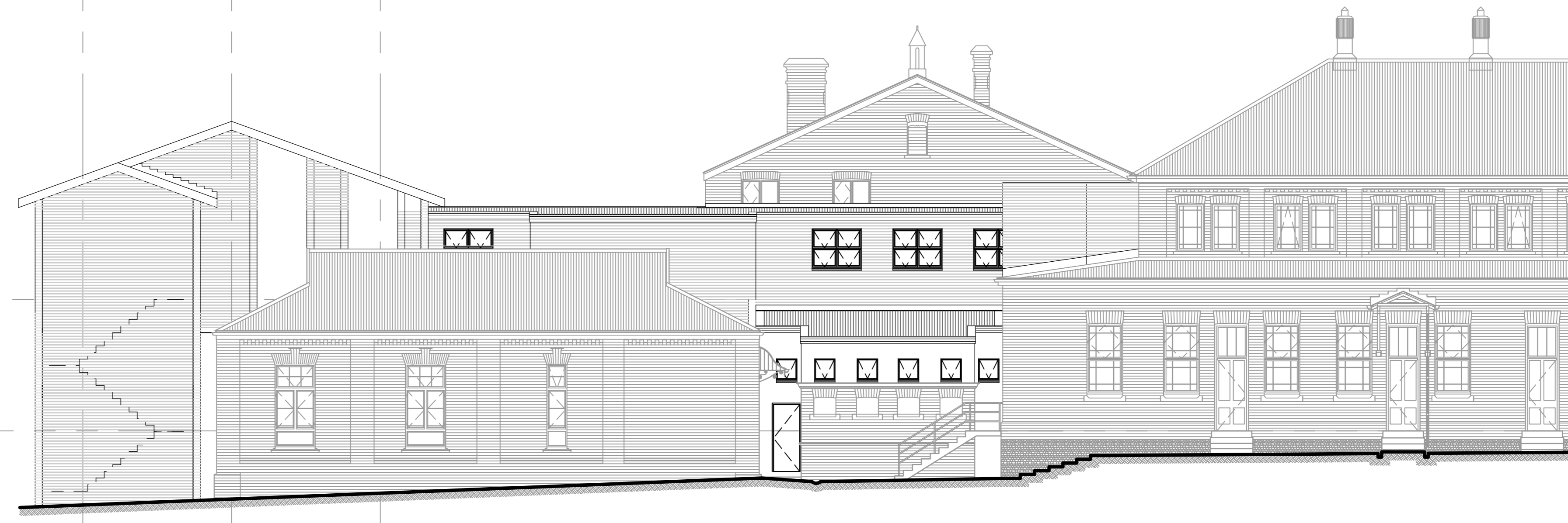
NEW BUILDING SOUTH WEST ELEVATION (Scale 1 : 100)