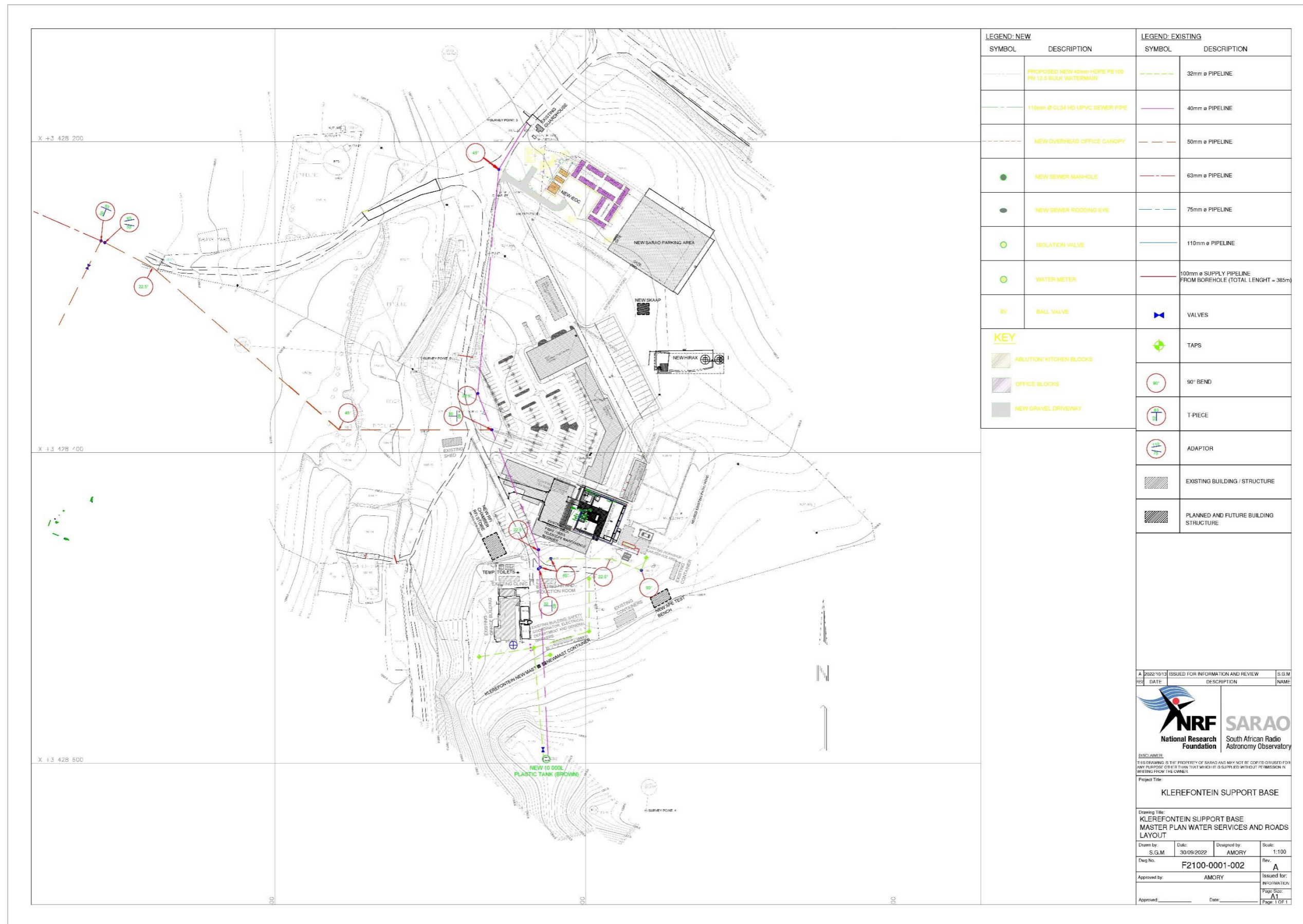
Figure 8-2: Klerefontein Support Base Masterplan Water Services and Roads Layout