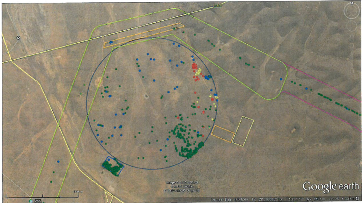
Fig. 1: Satellite image showing the location of protected trees on site. Red refers to Acacia (Vachellia) erioloba and yellow is Acacia (Vachellia) haematoxylon . The other colors refer to provincially protected plant species. The centre co-ordinates of the site: Latitude: 28° 17' 31.95"S; Longitude: 23° 22' 21.17"E.

DEPT. VAN LANDBOU, BOSBOU & VISSERY NORTHERN CAPE REGION 2017 -11- 06 PO BOX 2782, UPINGTON 8800 TEL: 054 332 5908/09/10 FAX: 054 334 0030 DEPT. OF AGRICULTURE, FORESTRY & FISHERIES