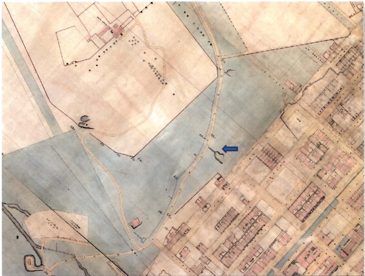
Figure 4 The 1897 Thom survey shows a road run-off gulley and what appears to be a retention pond on the area at the time. There is a similar feature further up the road to the north and a further run-off gully beyond that (off map).