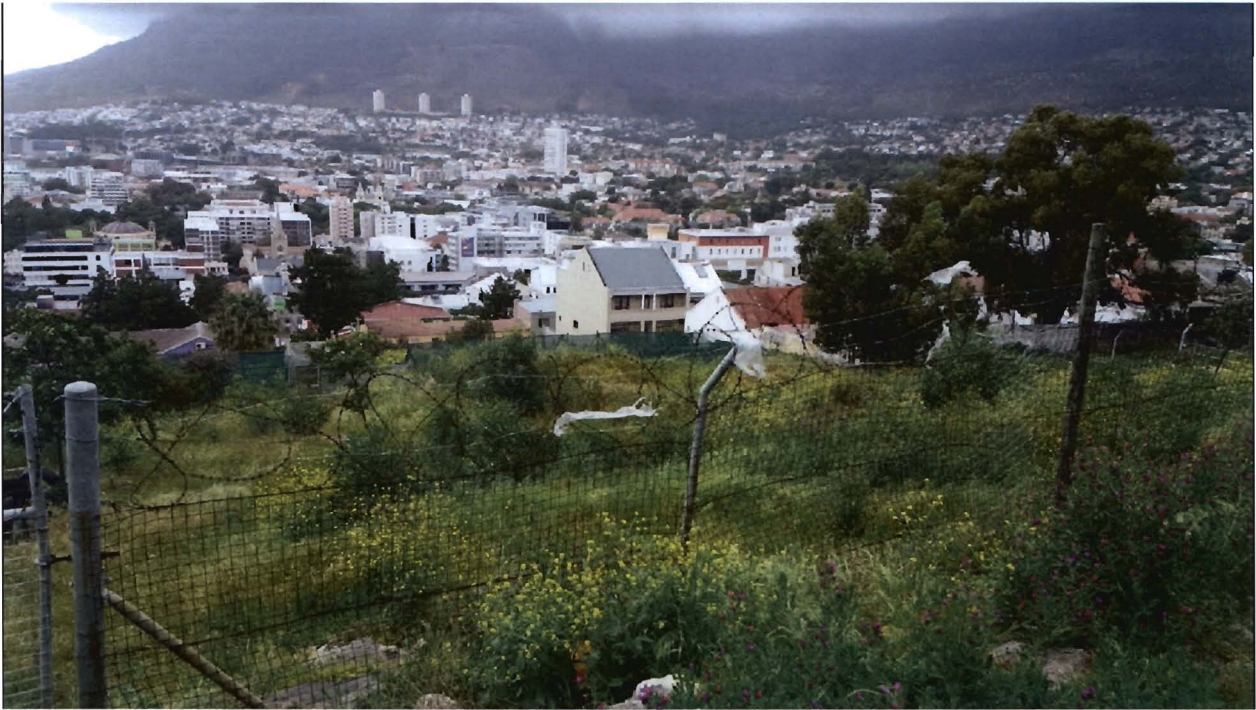
Figure 2 Project area.