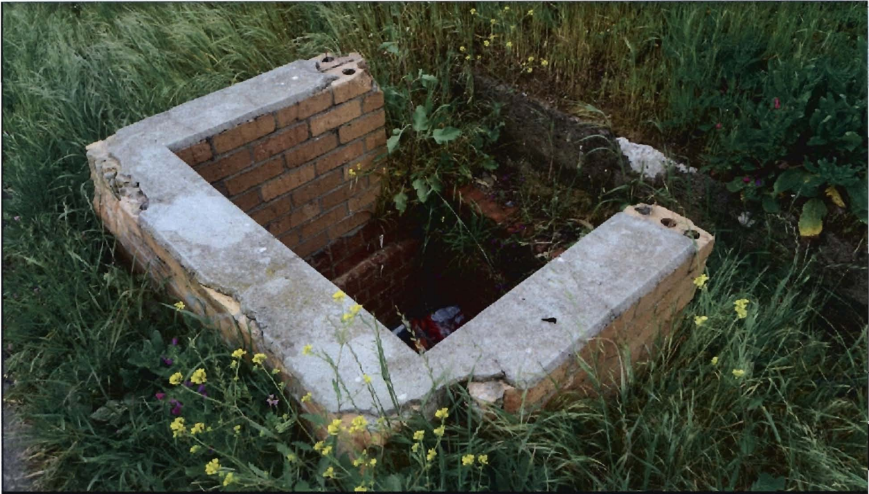
Figure 1 Existing culvert under Military Road