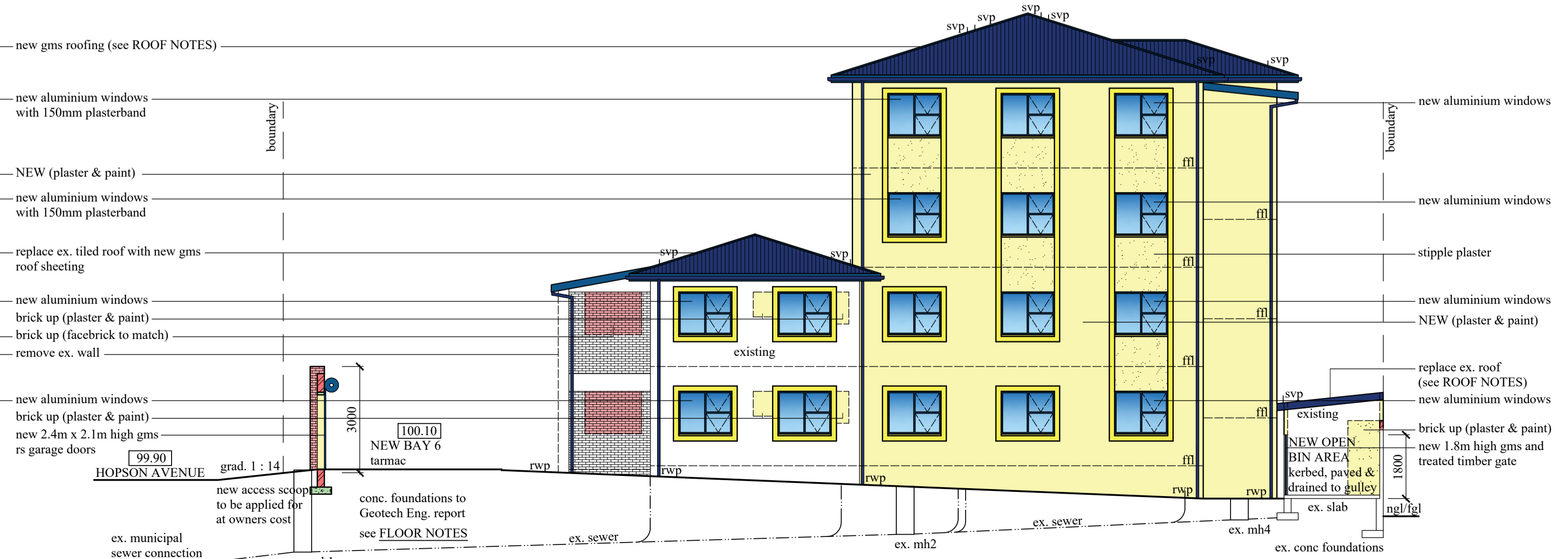
SOUTH WEST ELEVATION / SECTION D - D connect all new plumbing to ex. sewer