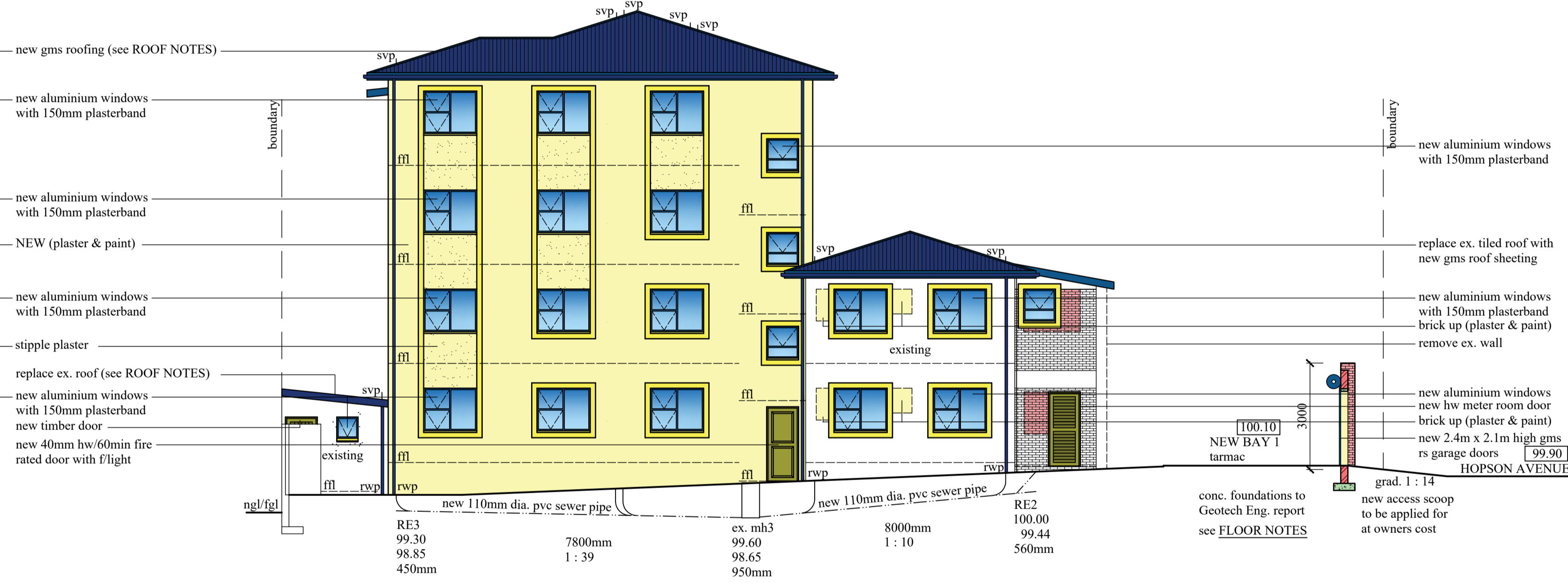
NORTH EAST ELEVATION / SECTION C - C connect all new plumbing to ex. sewer