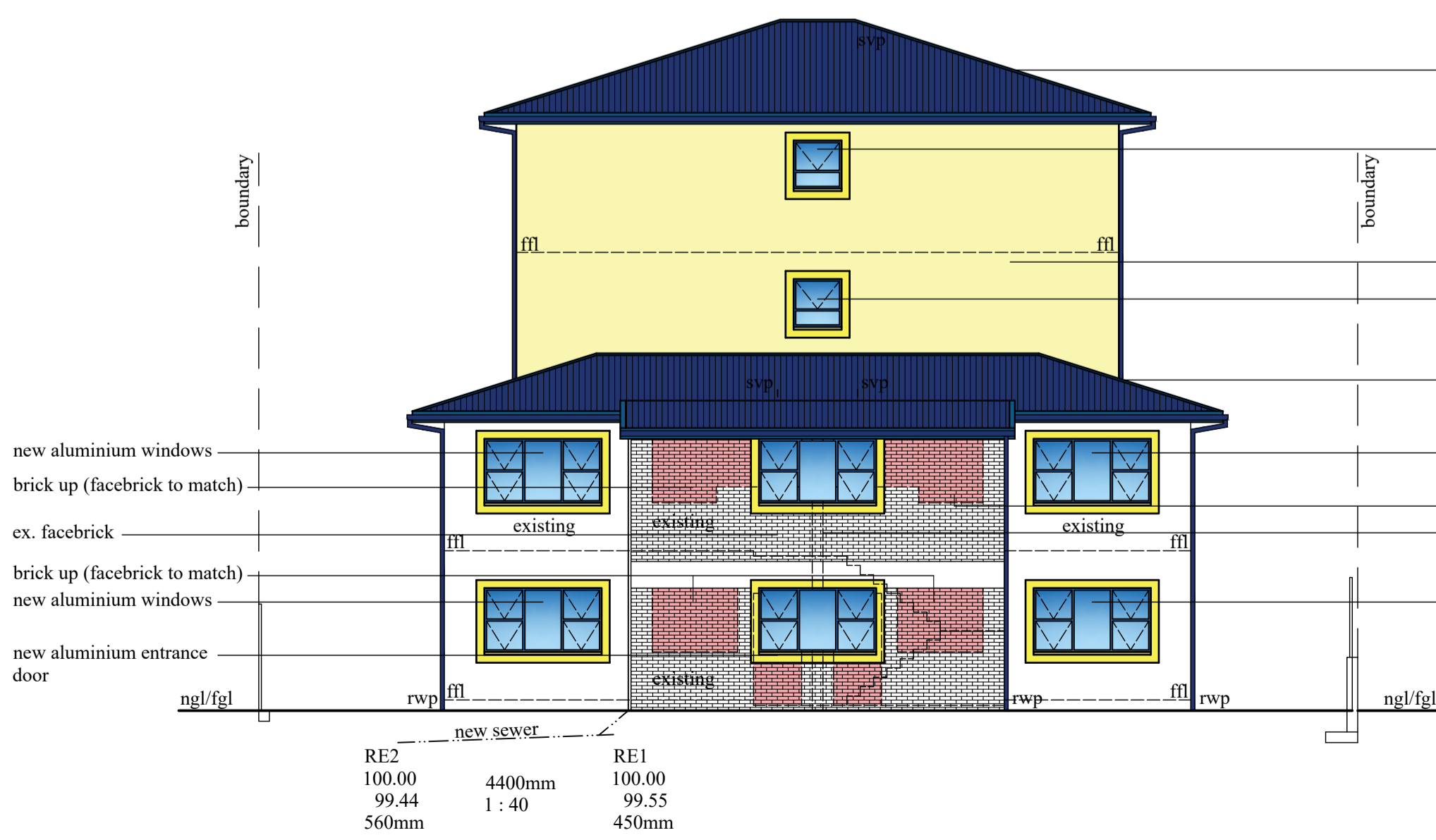
NORTH WEST ELEVATION connect all new plumbing to ex. sewer