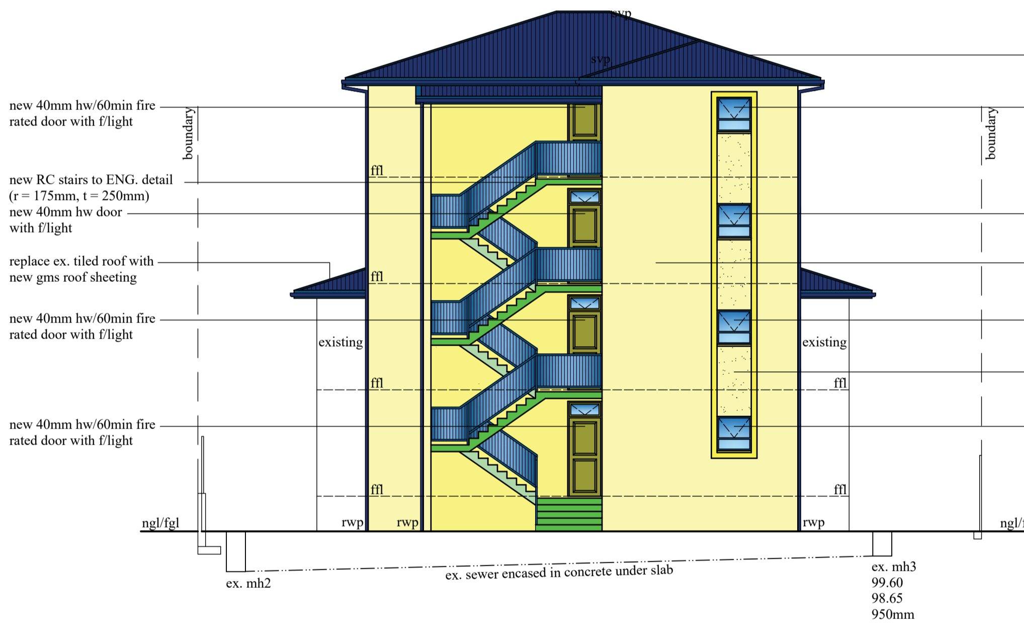
SOUTH EAST ELEVATION connect all new plumbing to ex. sewer