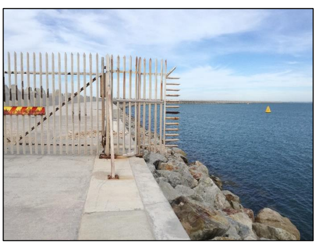
Photograph 2: View along the service corridor where the tressle supporting gas pipelines will be located