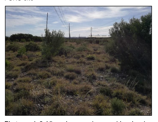
Photograph 3: View along services corridor showing 400 kV powerline