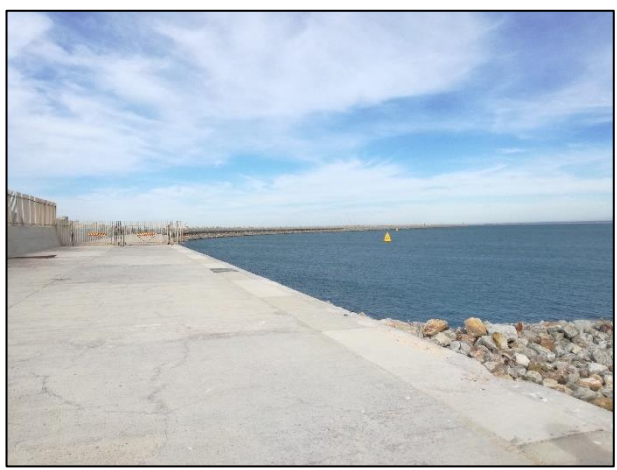
Photograph 1: View along the breakwater to the FSRU site