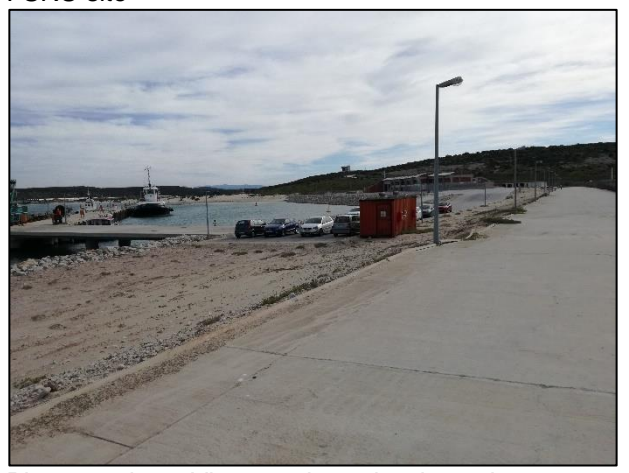
Photograph 6: View northwards along the eastern breakwater showing pipeline alignment