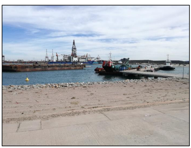
Photograph 7: View of servitude along inside of eastern breakwater where gas pipelines will be located