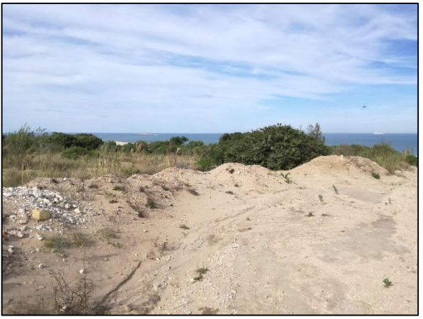
Photograph 9: Southwards view of proposed location for LNG & Gas hub