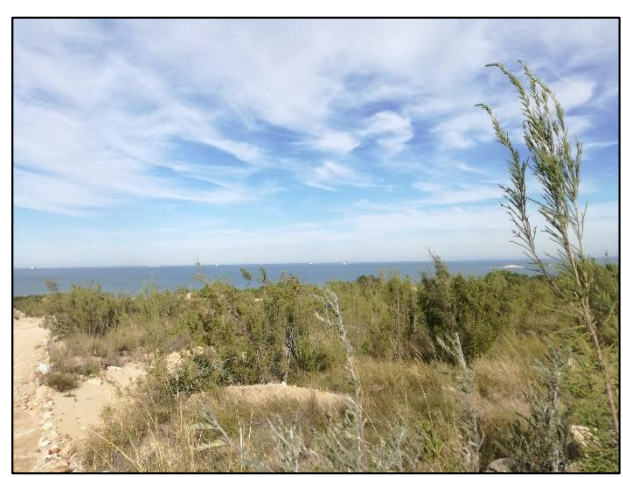
Photograph 8: Westwards view of proposed location for LNG & Gas hub