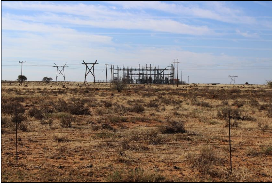
Figure 4. Jacobsdal rural substation outside Jacobsdal. Corridor 1 – Kalkaar CSP to Jacobsdal Substation (corridor approximately 19km in length)

The windblown nature of the aeolian deposits will, however, make it difficult to identify fossils and it is likely that most of the fossils will only be exposed during the construction phase. Due to the fact that local finds of fossils can be rich, a Moderate Palaeontological Sensitivity has been allocated to the study area.