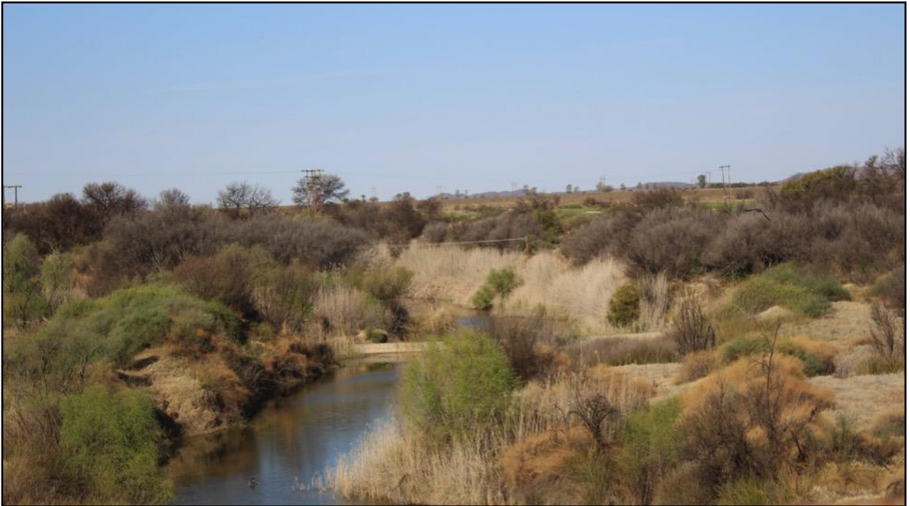
Figure 10. Vegetation and examples of thick Quaternary sediments along the Modderrivier.