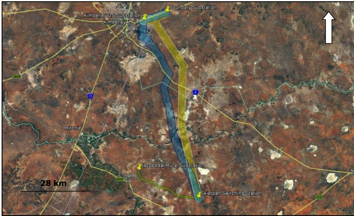
Figure 1. Google Earth image (2016) of the proposed location of the proposed 132 KV power line and associated infrastructure near Kimberly and Jacobsdal. Corridor 1 Kalkaar Solar Thermal Power Project to Jacobsdal Link (outlined in green). Corridor 2 Alternative 1 Kalkaar CSP via Kimberley DS to Boundary Substation (outlined in blue). Corridor 2 Alternative 2 Kalkaar CSP via Kimberley DS to Boundary Substation (outlined in yellow).