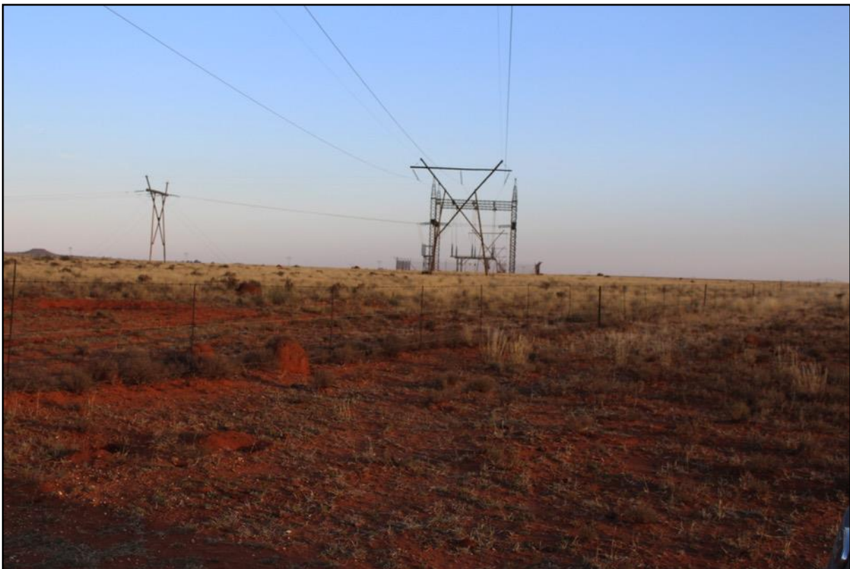
Figure 7. Skietpan switching station at the end of Corridor 1 and the beginning of Corridor 2 Alternatives 1 and 2.