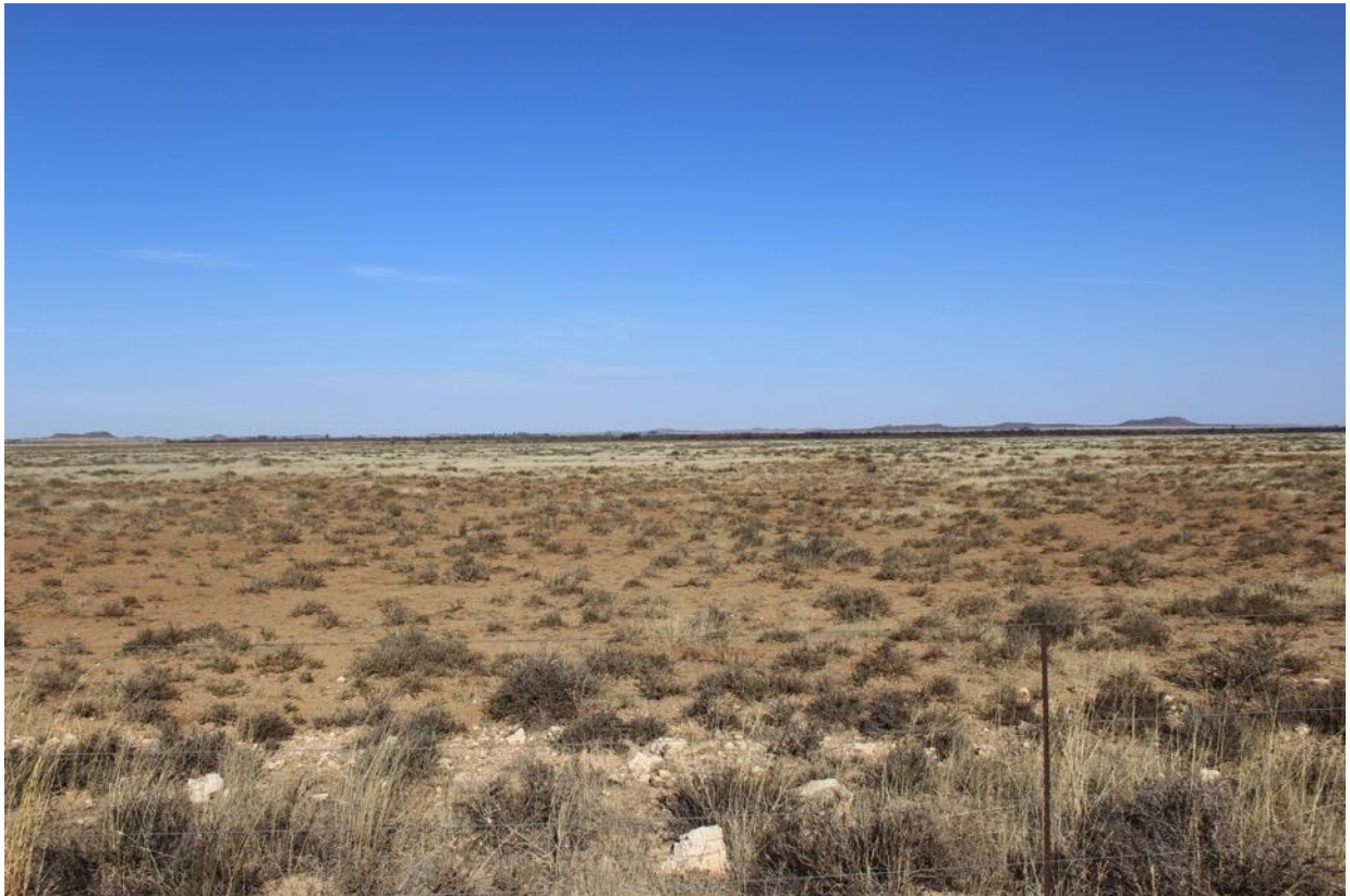
Figure 8. Flat terrain on Corridor 2 Alternative 1.