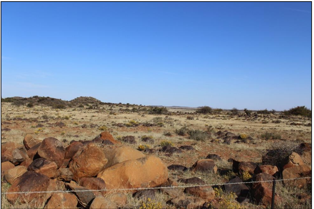
Figure 9. Outcrops with vegetation on Corridor 2 Alternative 2.