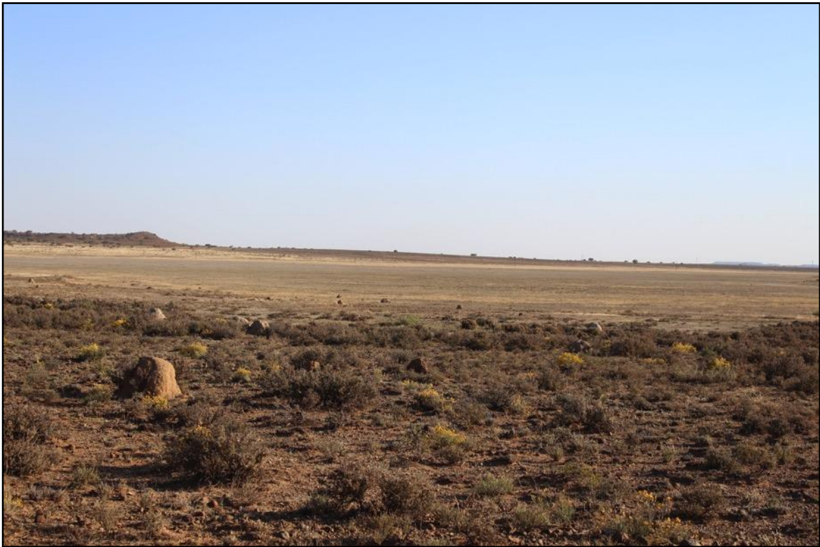
Figure 6. Typical pan in Corridor 1.