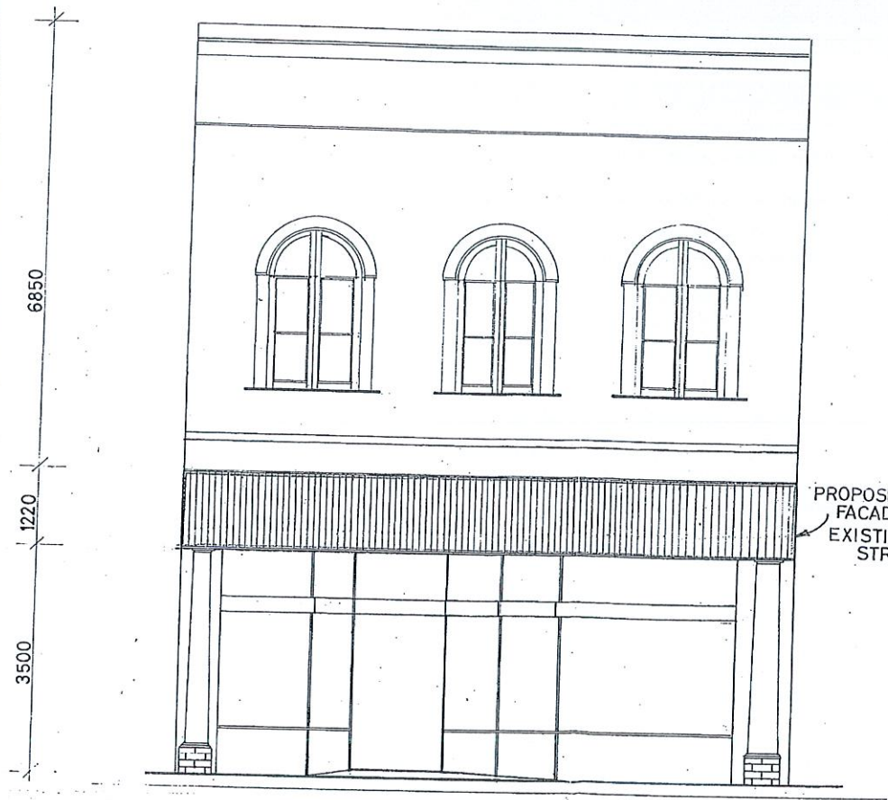
9400 A ELEVATION SCALE 1:50

[Signature] CITY ENGINEER PORT ELIZABETH