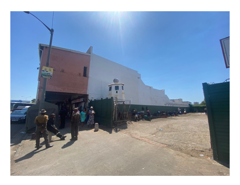
Side View along adjacent site

Please find below photos of the existing structures on site.