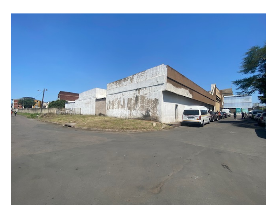
Part Side & Rear View