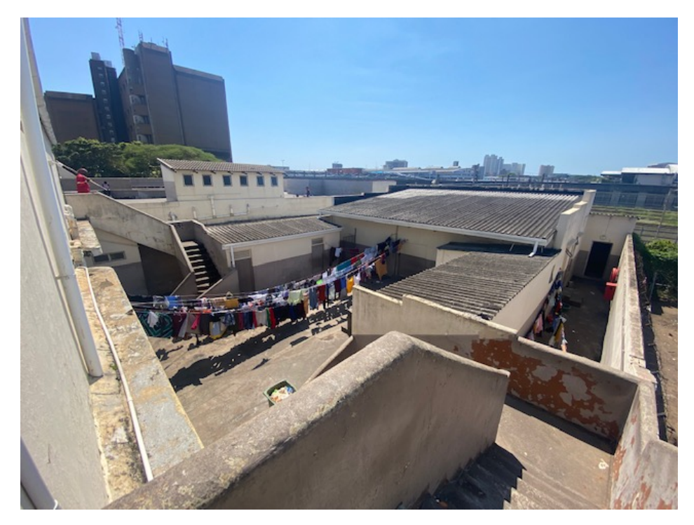
Part First Storey View