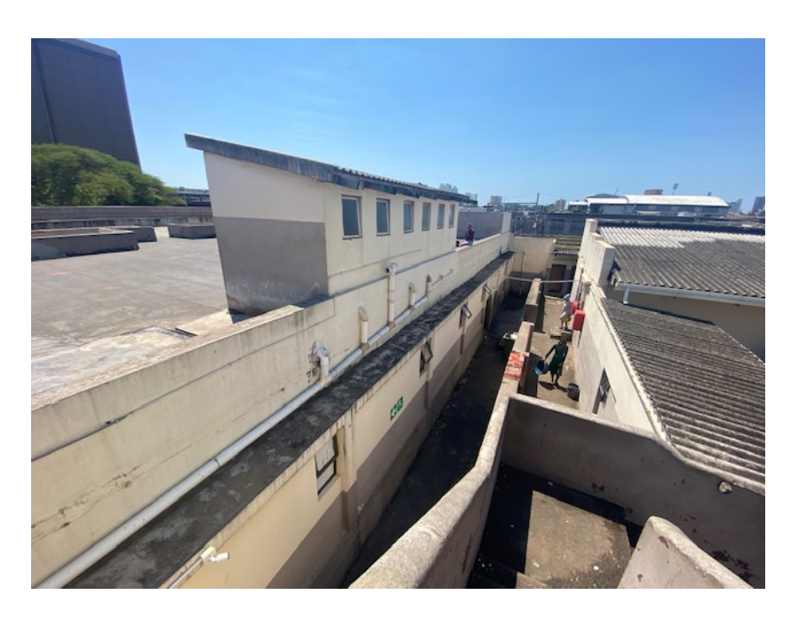
Part First Storey View