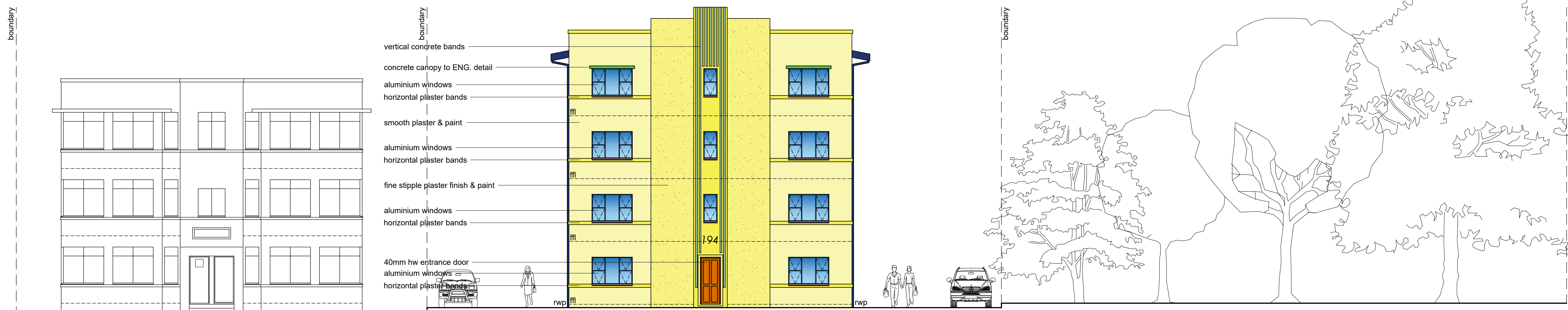
NORTH EAST ELEVATION/ STREETScape (1 : 100)