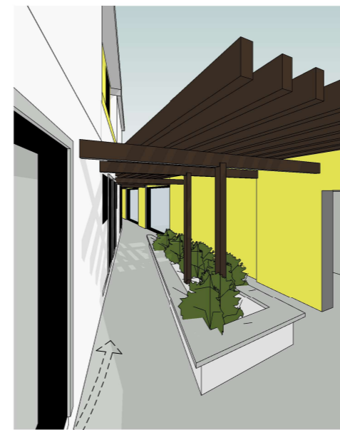
3 3D View Rear Retail Courtyard