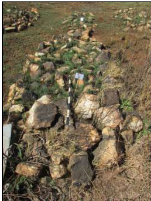
Fig.9: The grave of Amos Nxumalo.