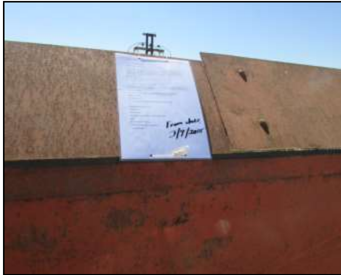
Fig.14: Close-up of Site Notice.

In conclusion it can be stated that the process regarding the investigation, exhumation and relocation of graves from the Strawberry Farm site has commenced, Site notices have been erected, the graves have been recorded and numbered and Newspaper Advertisements placed. Consultation with the previous landowners is also being undertaken. Once the required time-frames related to the Social Consultation has been run and the process completed, the various permit applications will be submitted. As soon as these permits have been issued the physical exhumations and relocations will be scheduled and undertaken.