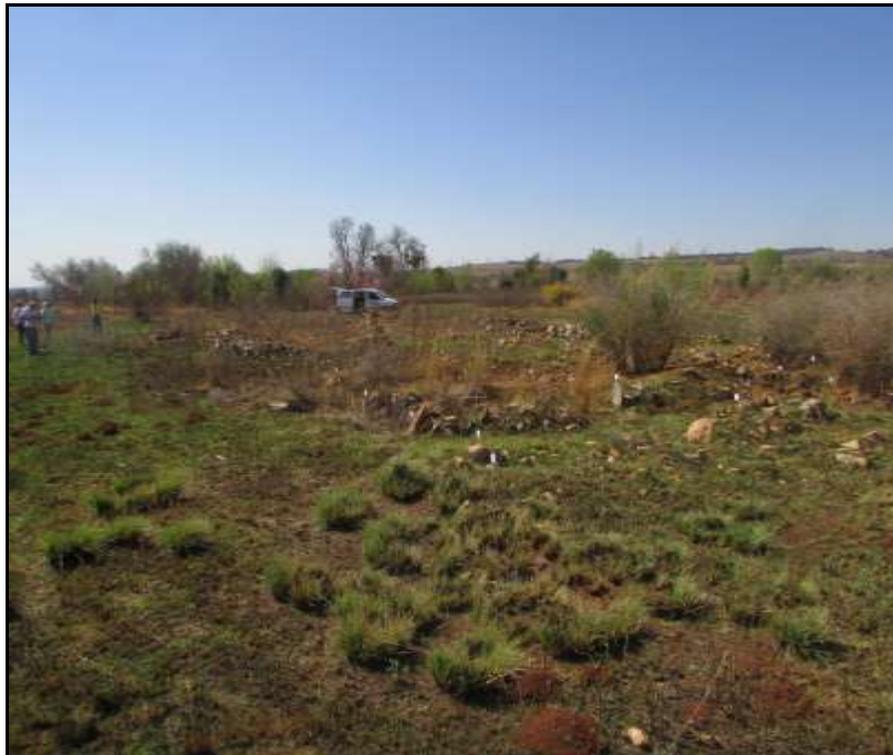
Fig.1: A view of the grave site with the graves numbered.

GPS Location - S25 55 41.67 E28 14 05.89