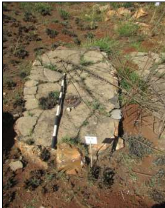
Fig.3: A grave packed with stones and cement.