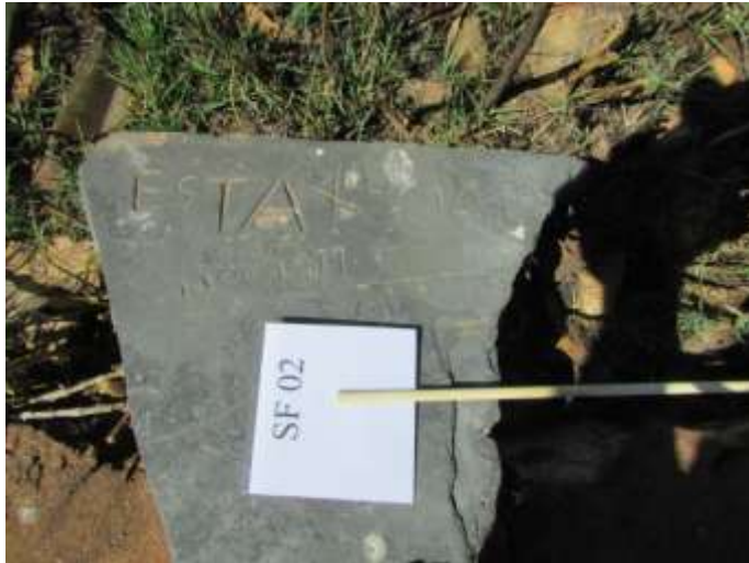
Fig.6: Close-up of Esta Xumalo's headstone.