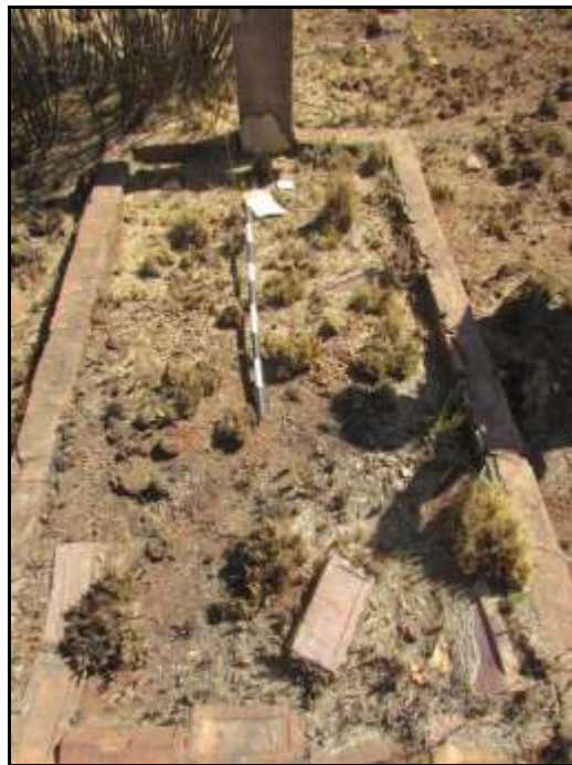
Fig.7: A cement grave with cement headstone.