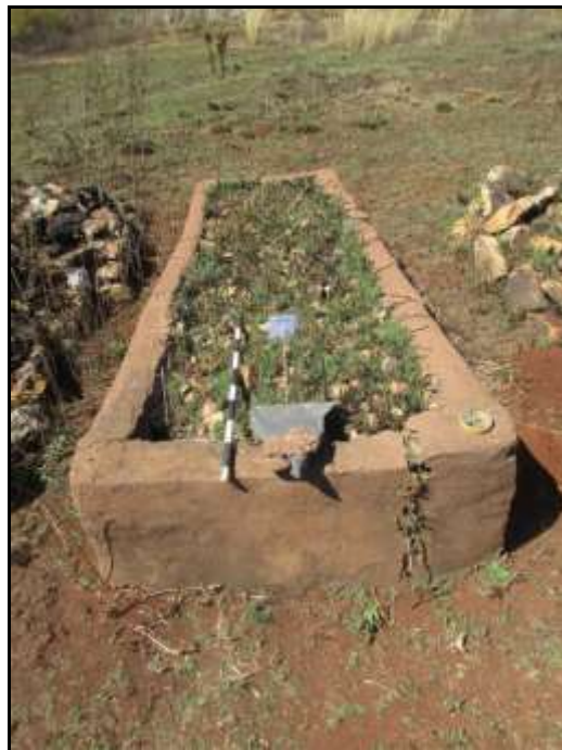
Fig.5: A cement demarcated grave. This is the grave of Esta Xumalo.