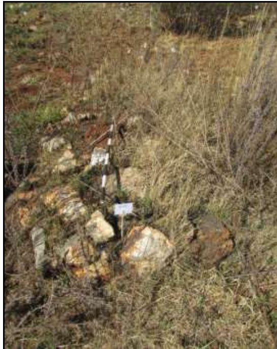
Fig.2: One of the stone-packed graves.