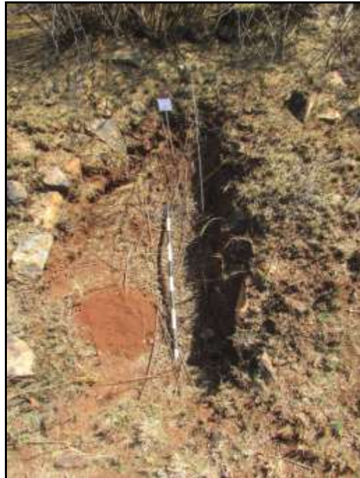
Fig.8: This grave seems to have been dug up.