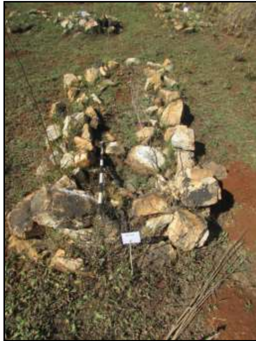
Fig.4: Another stone-packed grave.