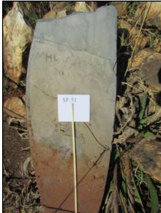
Fig.10: Close-up of Amos Nxumalo's headstone.