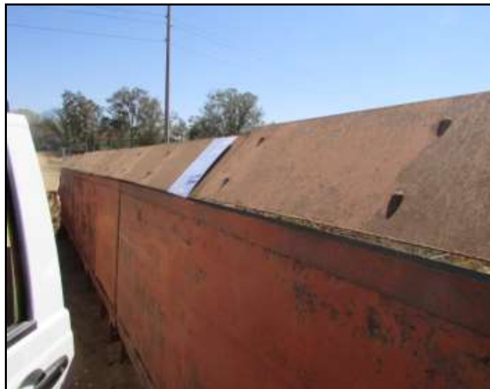
Fig.13: The Site Notice was placed on the footbridge Over the railway line that passes by and through the area.

The team is also in the process of consulting with the previous landowners regarding these grave sites in order to try and determine if they possibly have any information on the sites, the deceased buried here and/or possible family members and descendants.