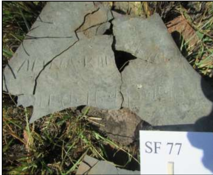
Fig.12: Close-up of broken headstone of Alina R. Jali. The date of death is indicated as 1936.