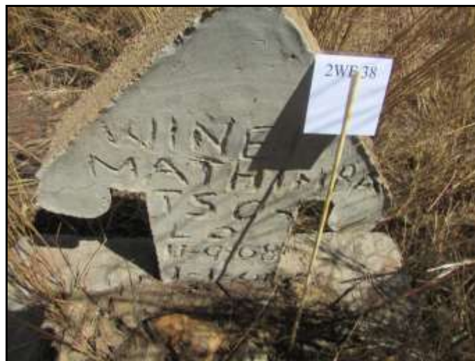
Fig.13: The headstone of Winei Mathibatsolo's grave.