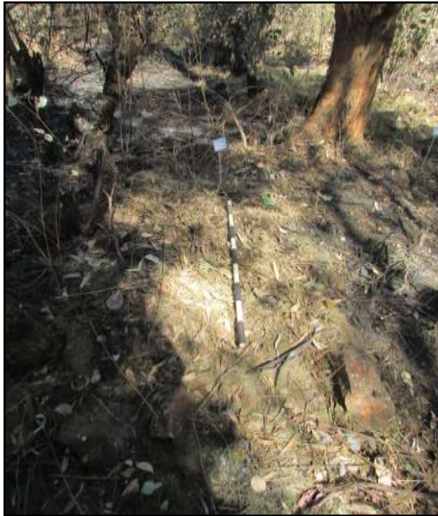
Fig.2: One of the stone-packed graves on Site 1.