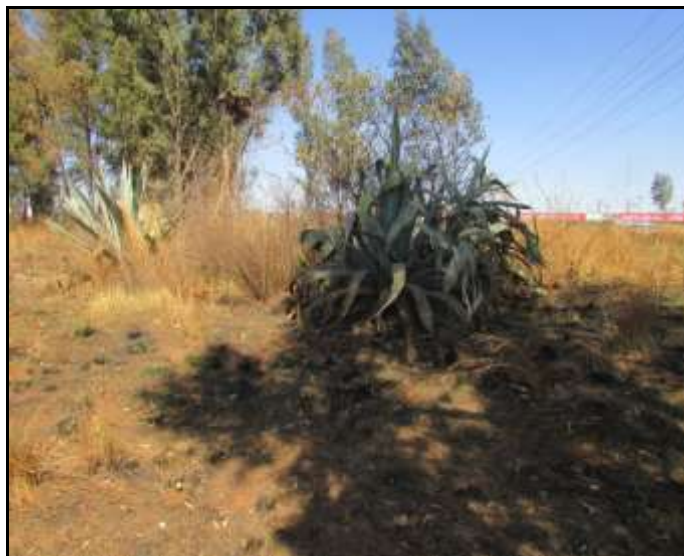
Fig.6: View of location of Site 2.