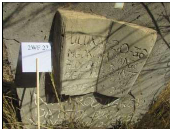
Fig.11: The headstone on Nimrod Ngwenya's grave.