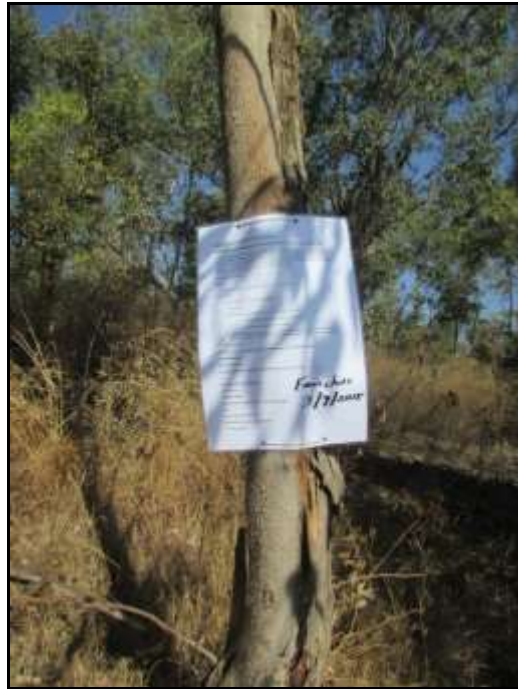
Fig.17: View of Notice at Site 1.