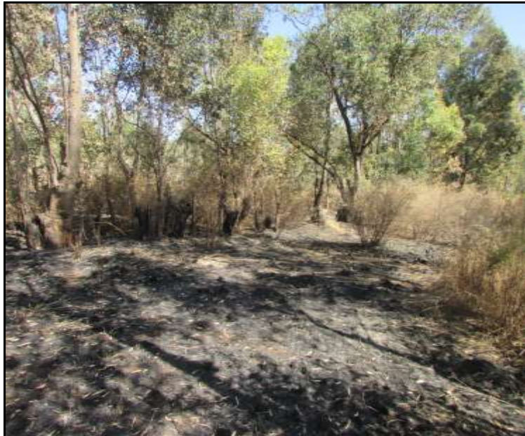
Fig.1: Partial view of Site 1.

GPS Location - S26 00 41.30 E28 15 40.60