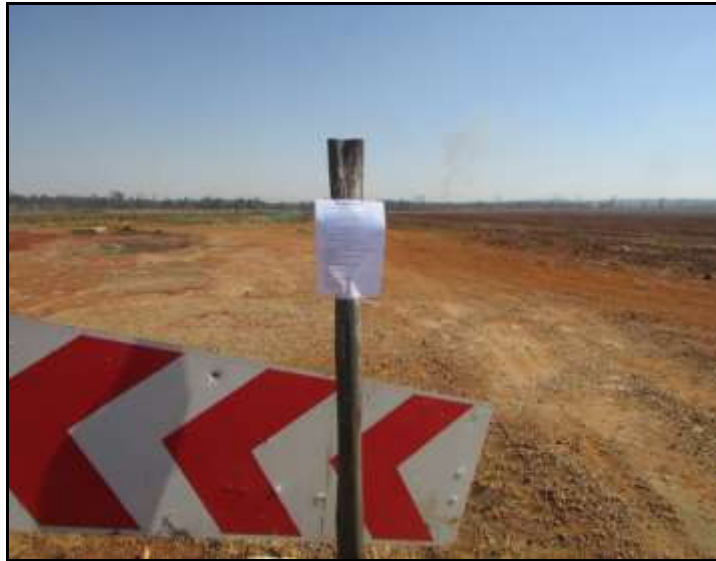
Fig.15: Site Notice at the Main entry point to the area.