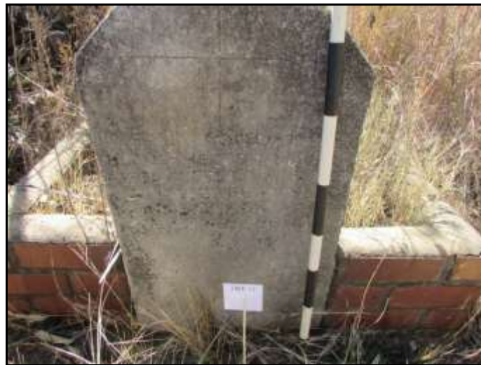
Fig.9: One of the graves with a formal headstone. The inscription cannot be read, but a date of 1952 was visible.