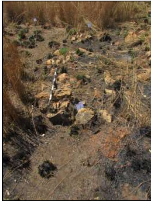
Fig.14: A view of some of the marked & numbered graves on Site 2.