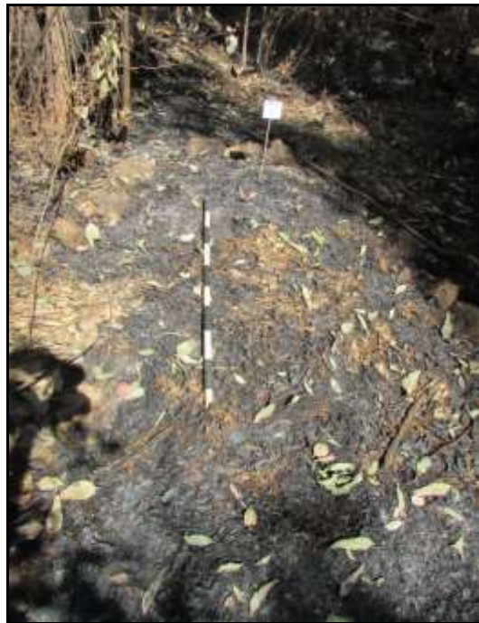
Fig.5: A grave with a stone-packed border.