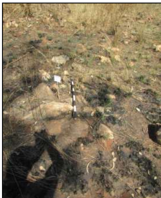
Fig.7: One of the stone-packed graves.