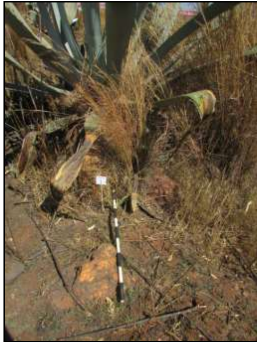
Fig.8: Another grave at Site 2. The plant grows on top of the stone-packed grave.