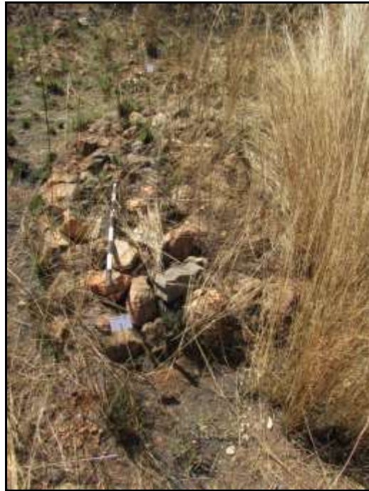
Fig.10: Another of the stone-packed graves.