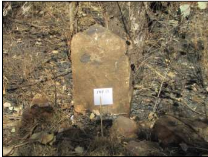
Fig.4: A grave with a single stone at the head as marker.