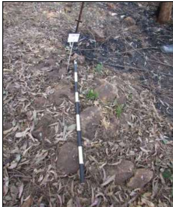
Fig.3: The grave with the metal cross marker.