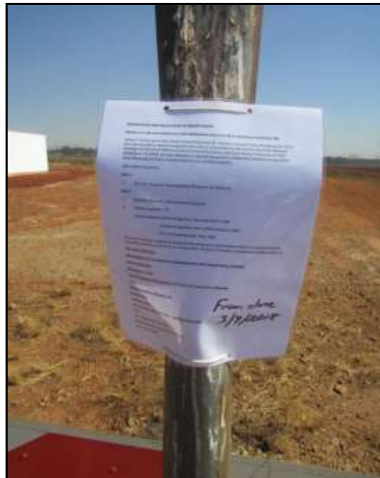
Fig.16: Close-up of Notice.