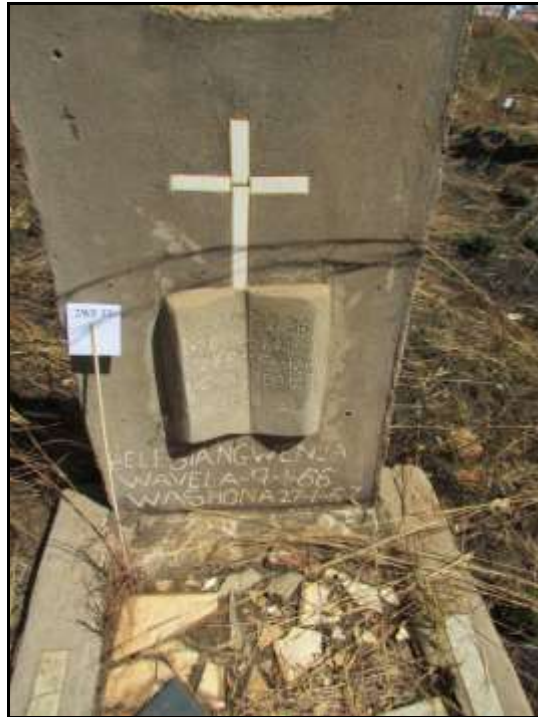
Fig.12: The headstone on Belesia Ngwenya's grave.