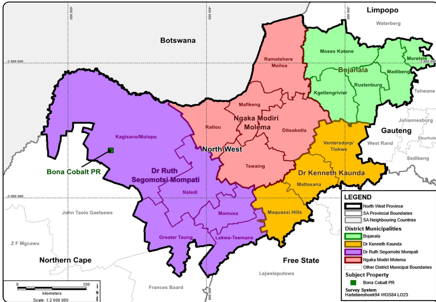
Figure 1: Locality Map