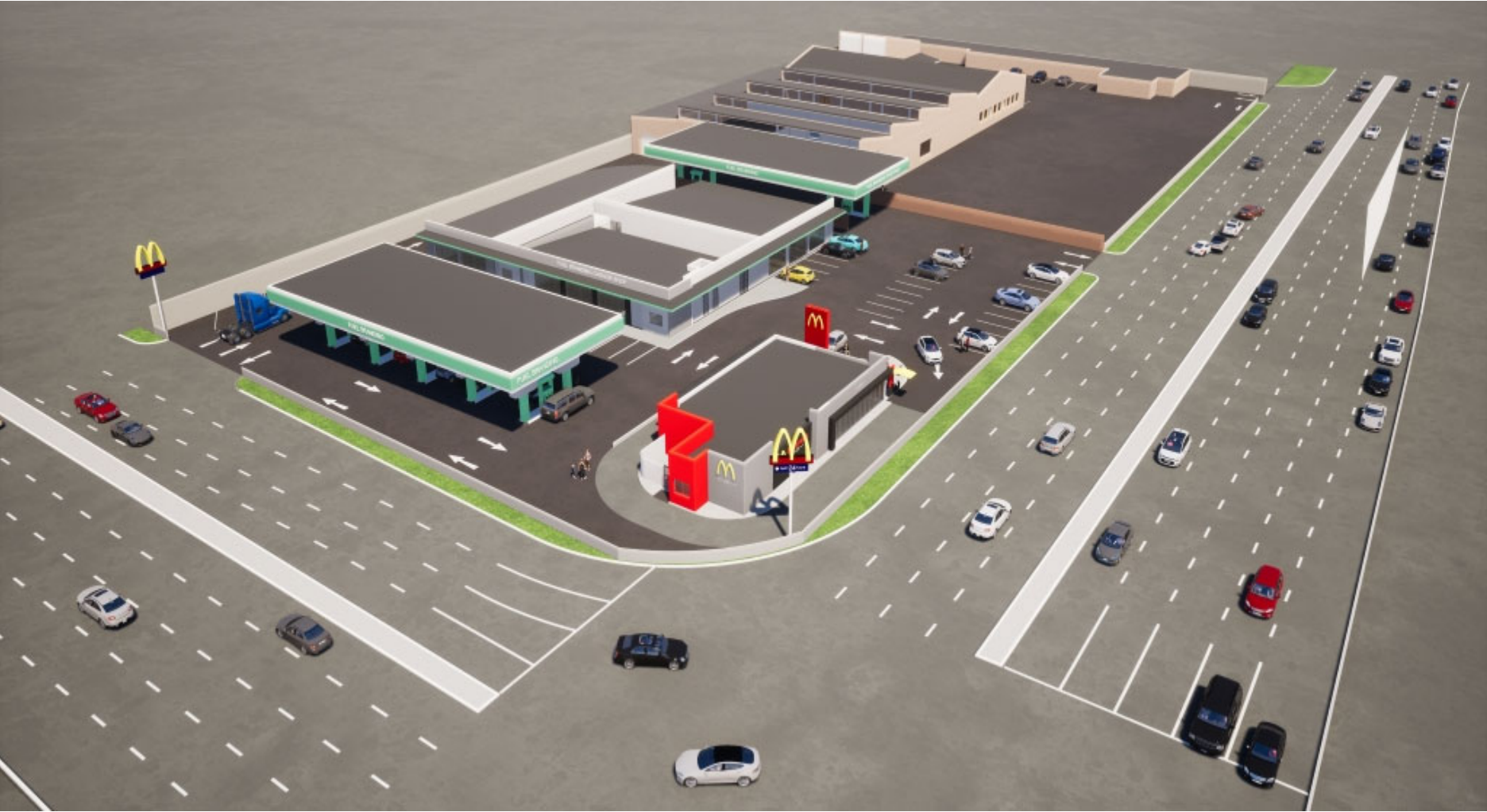
Figure 3: Proposed Design of Filling Station