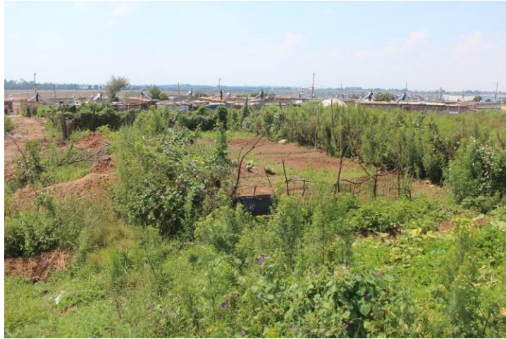
Figure 2: A north-easterly view of the study site. Note the township in the background.

The entire site has been transformed by a railway line, fences, invasive plants (Figure 2), indiscriminate dumping of rubbish, squatters, a soccer field (Figure 3), power lines, several foot paths and gravel roads.