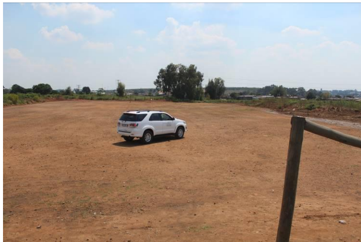
Figure 3: A northerly view of the study site. Note the soccer field.

There are no natural rupicolous habitats on the study site, but good manmade rupicolous habitat exists in the form of building rubble. These man-made habitats offer nooks and crannies as refuge for some common rupicolous mammals.