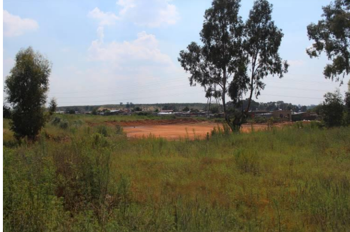
Figure 4: A few invasive Eucalyptus trees on the site.

No aquatic habitat or wetland-associated vegetation cover occur on the study site.