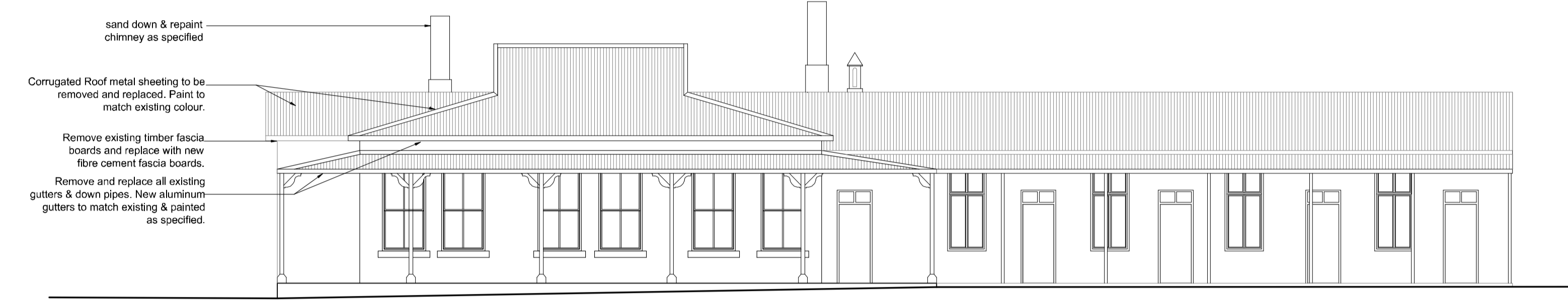
SOUTH WESTERN ELEVATION Scale 1:100