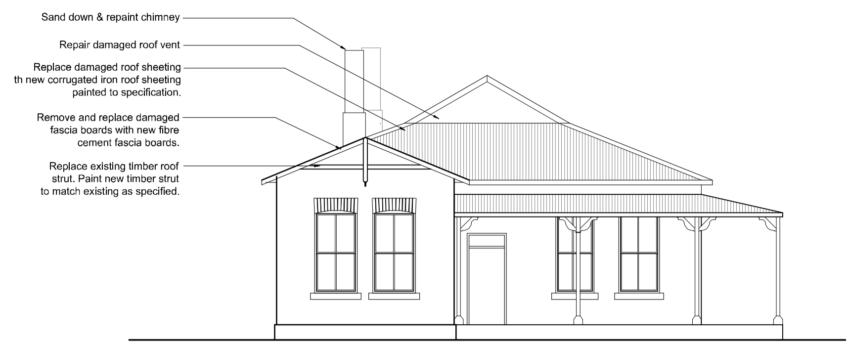
NORTH WESTERN ELEVATION Scale 1:100