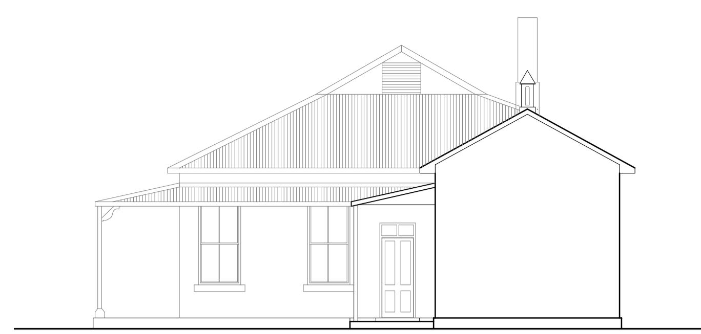
SOUTH EASTERN ELEVATION Scale 1:100