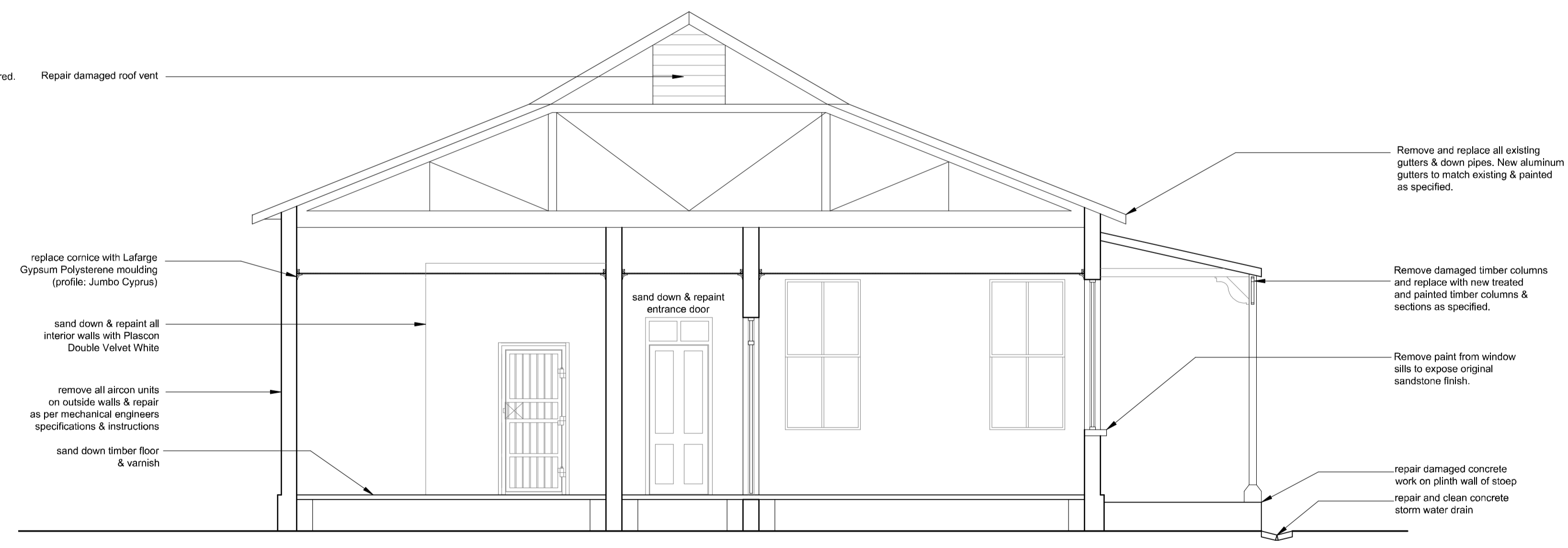
SECTION A-A Scale 1:50