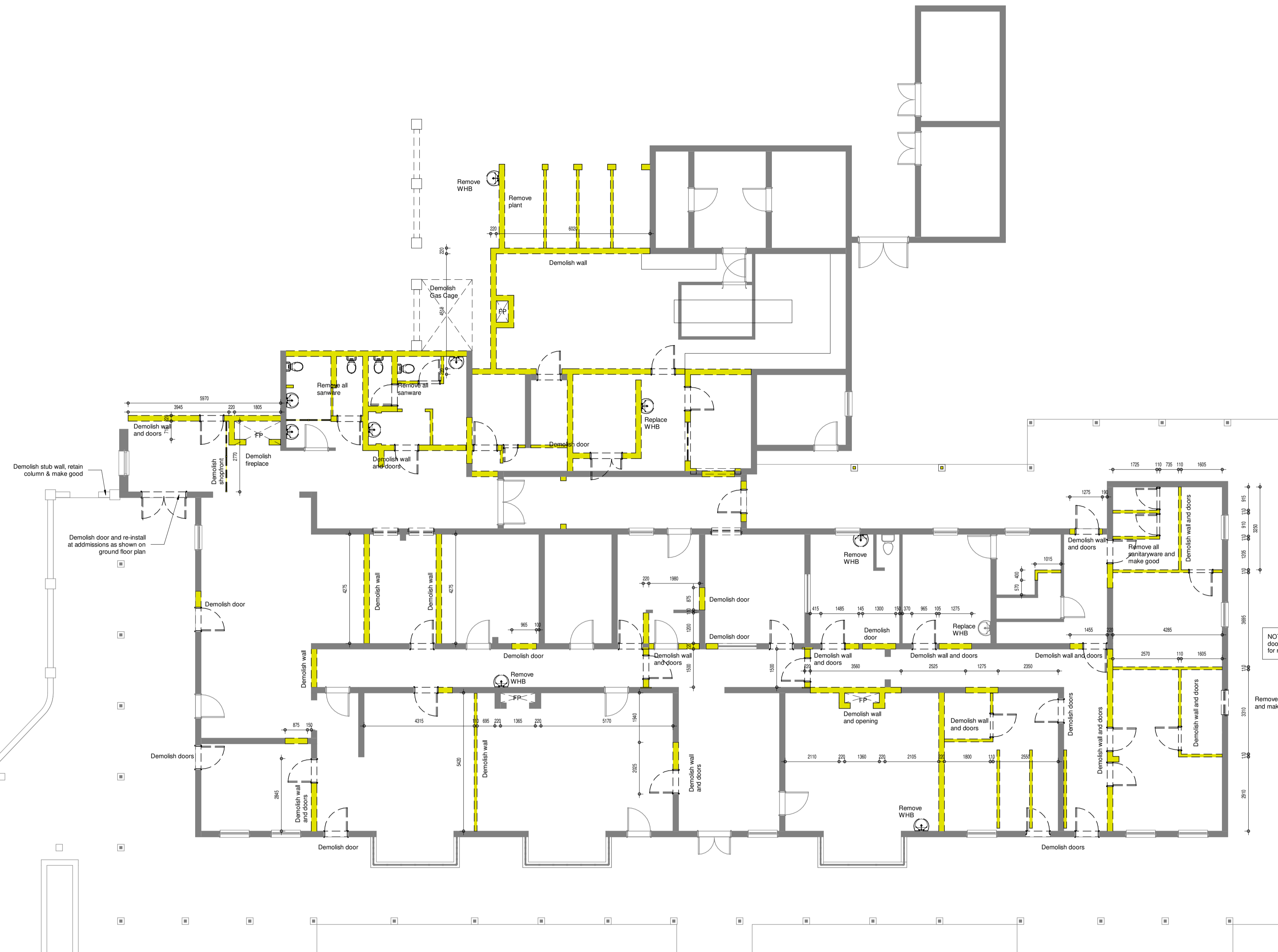
1 11-00 Ground Floor Demolition 1 : 100