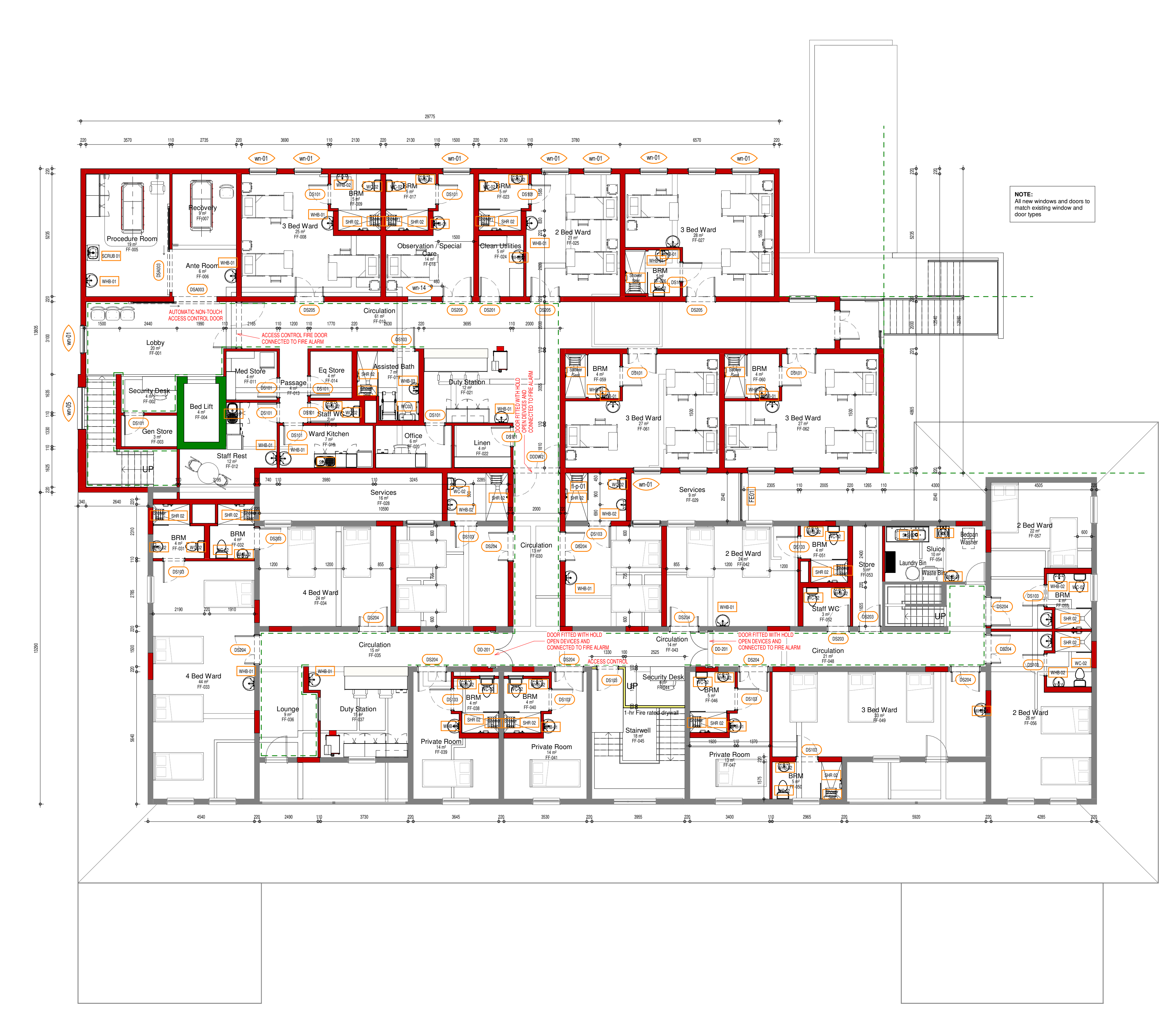
1 11-01 First Floor