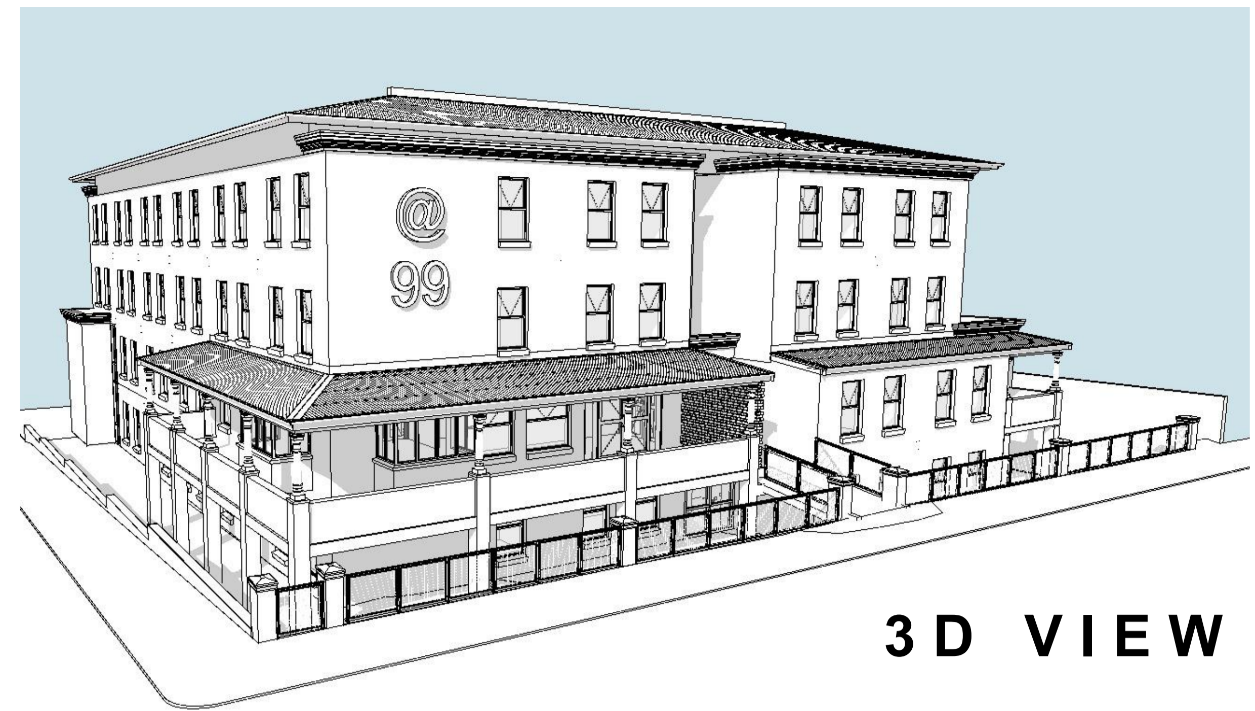
3 D VIEW