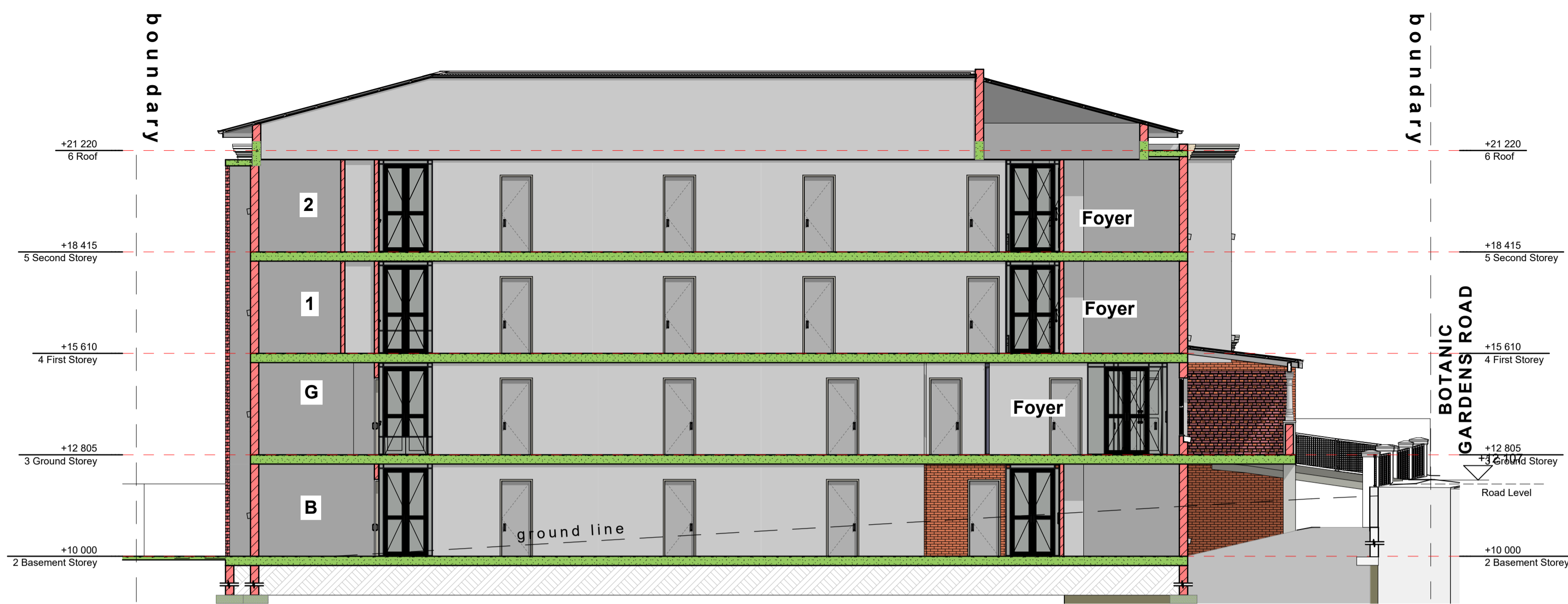
SECTION - A