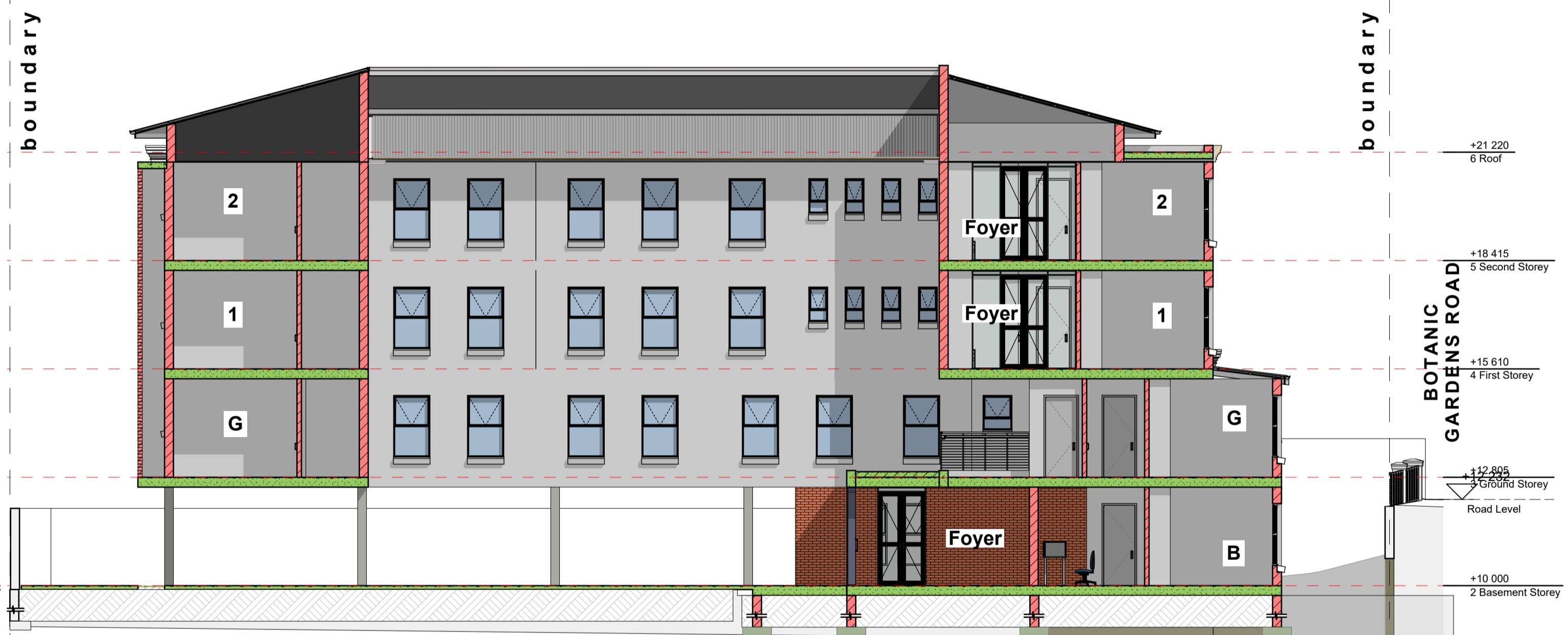
SECTION - C