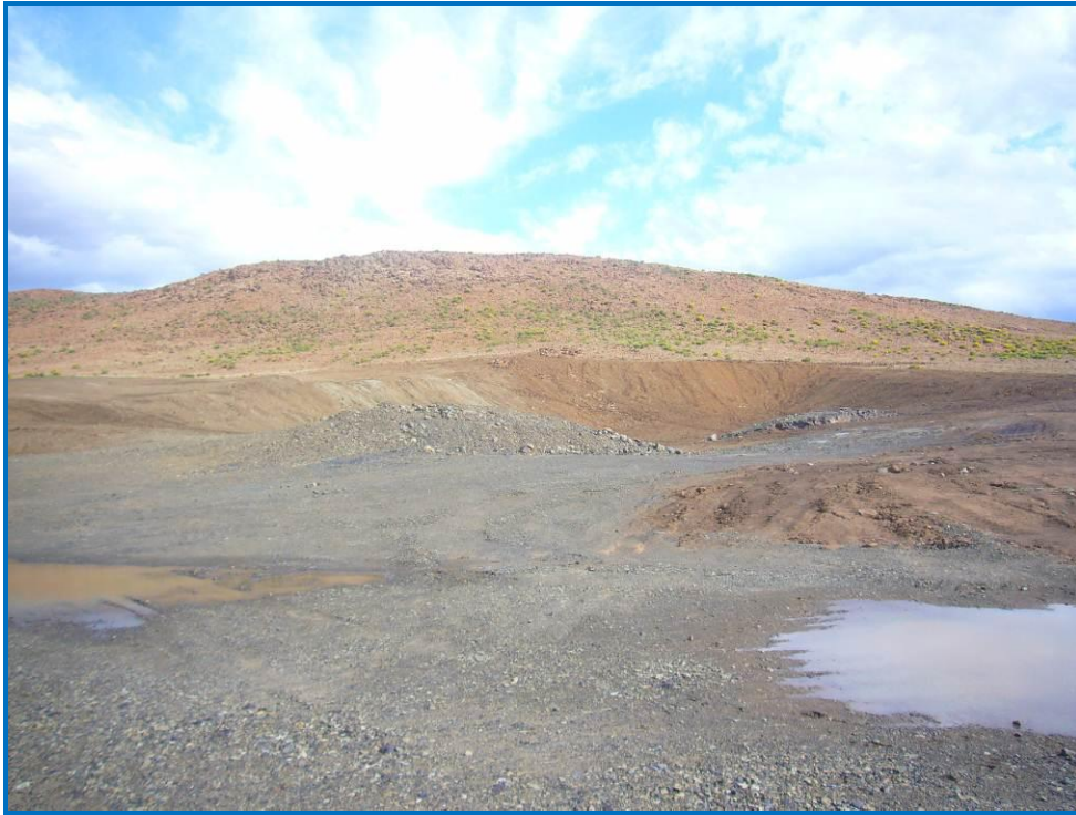
Figure 5: Borrow Pit # 08602-BP04.