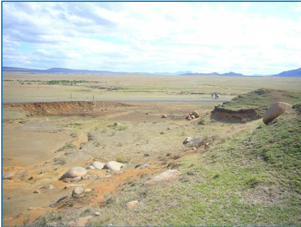
Figure 3: Borrow Pit # 08602-BP01.