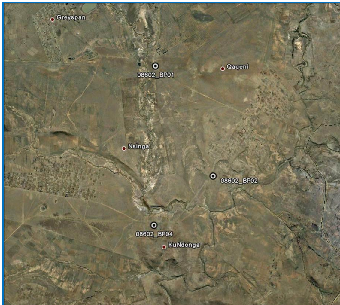
Figure 2: Aerial Image - Road DR08602 & associated BP's.