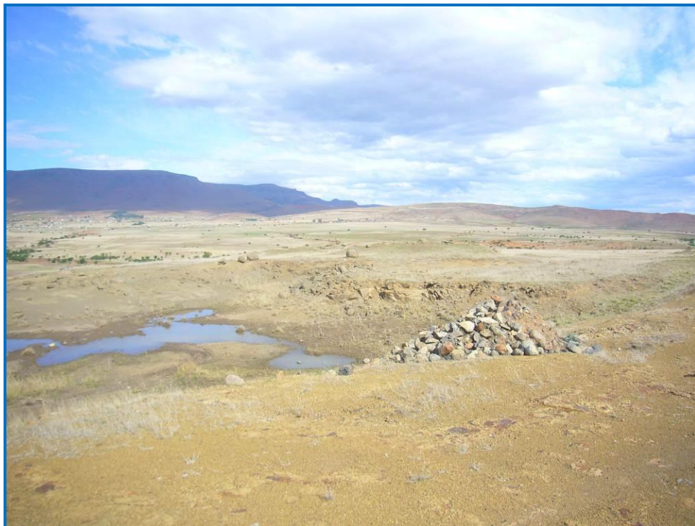
Figure 4: Borrow Pit # 08602-BP02.