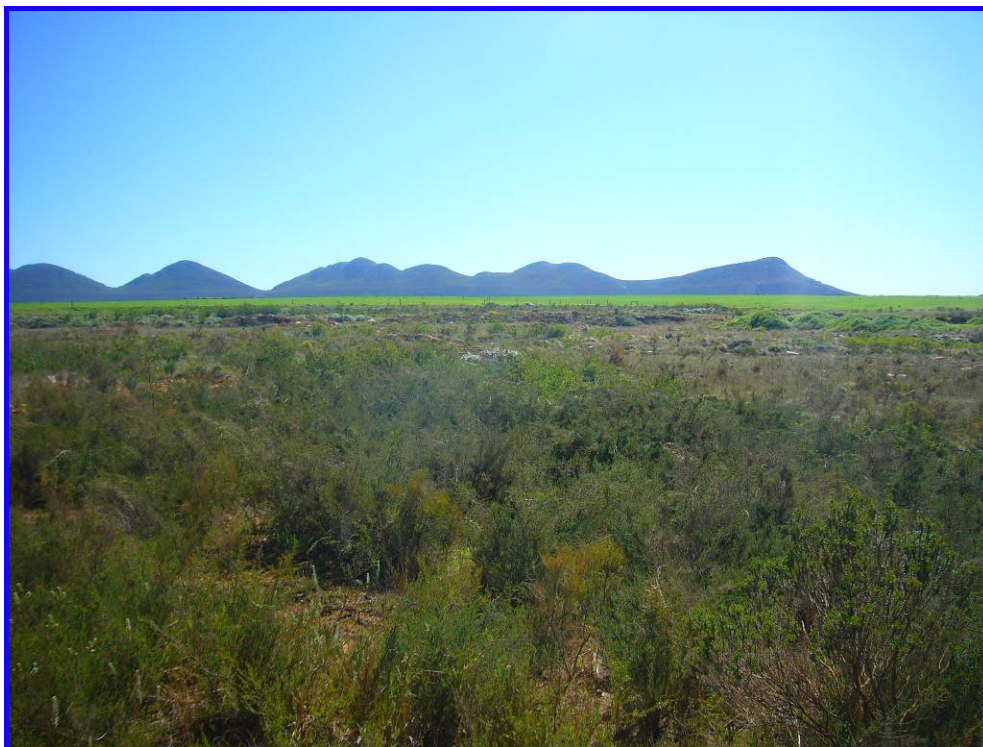
Figure 3: Borrow Pit # 1774-BP01.