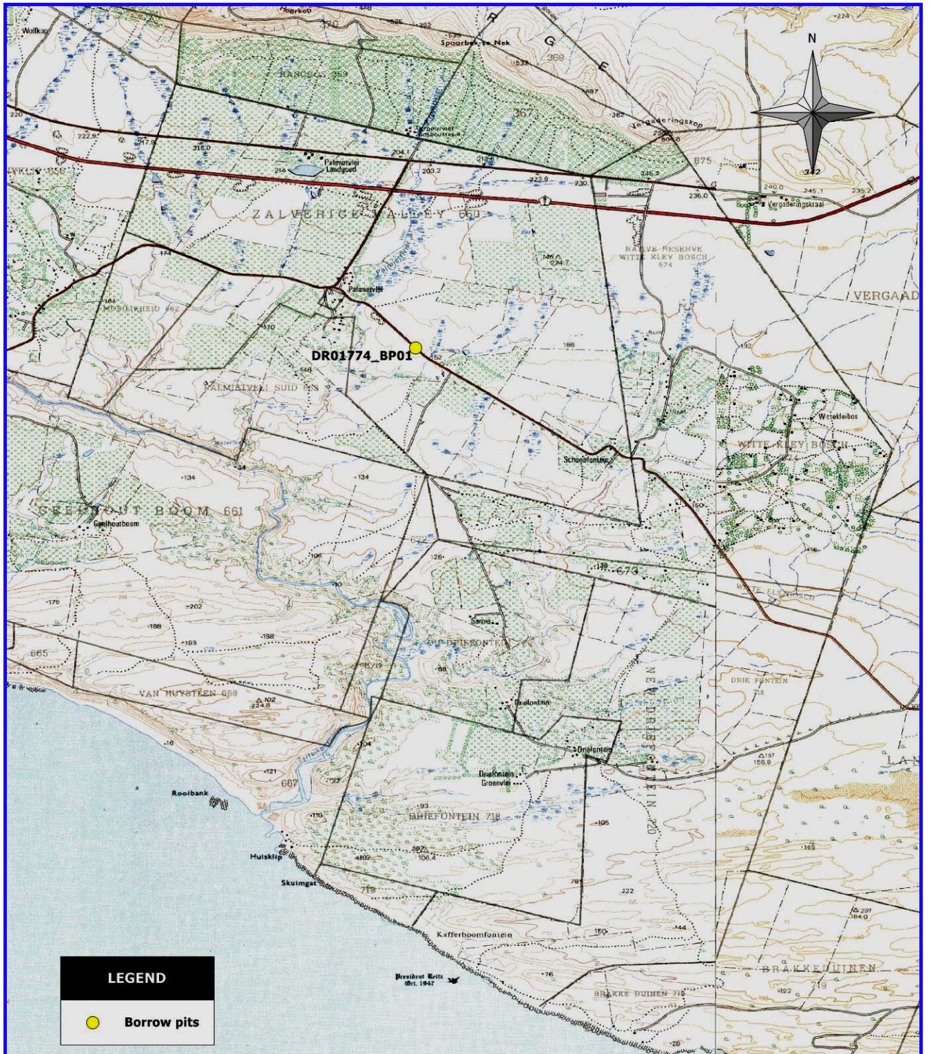
Figure 1: The location of the borrow pit