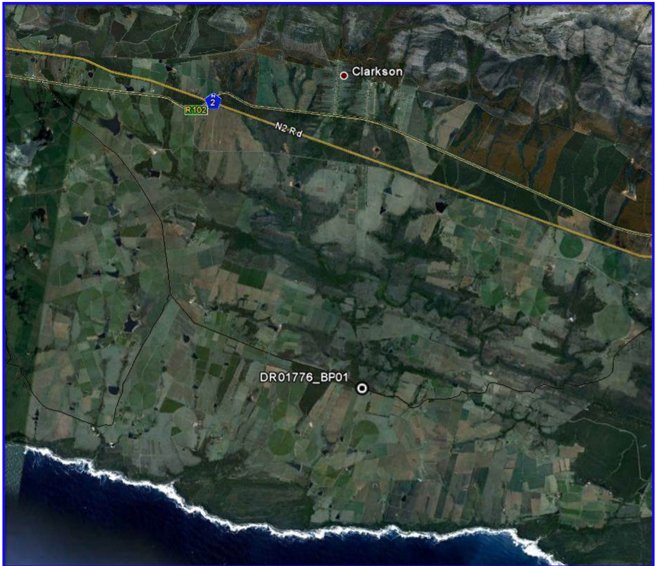
Figure 2: Aerial Image - Road DR01776 & associated BP.