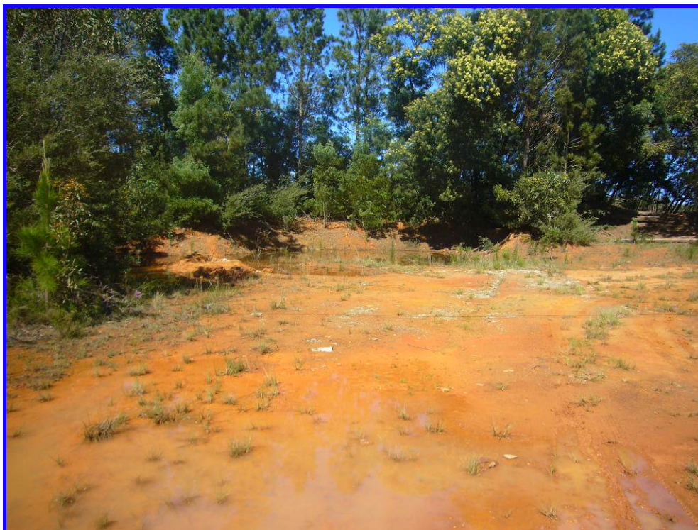
Figure 3: Borrow Pit # 1776-BP01.