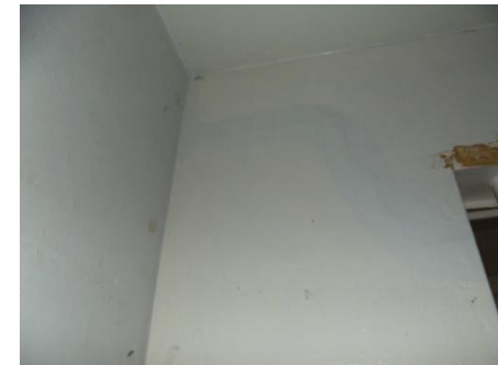
CELL 03 NO PHOTO