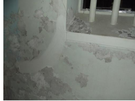
CELL 05 NO PHOTO