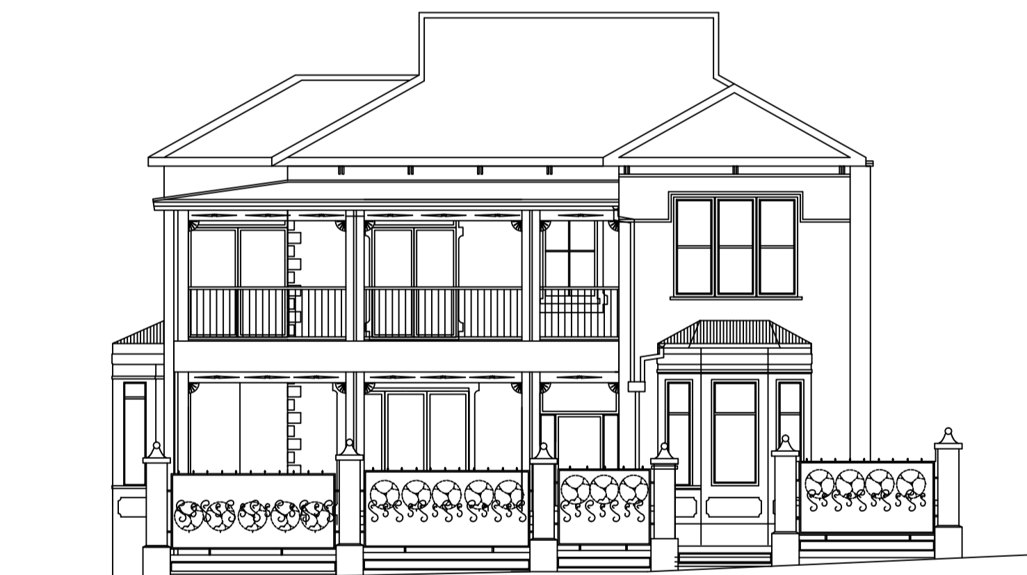
NORTH-EAST ELEVATION Scale 1:100