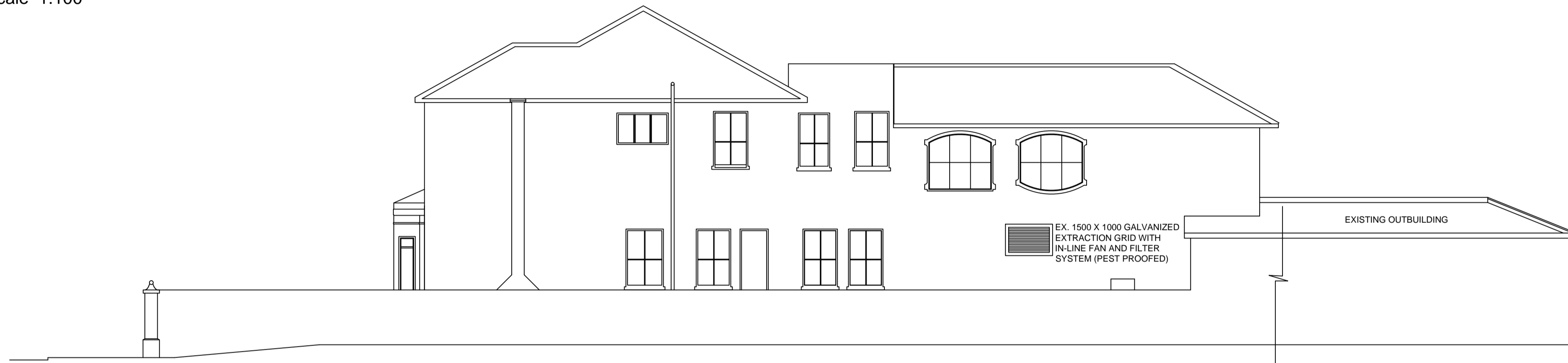
NORTH-WEST ELEVATION Scale 1:100