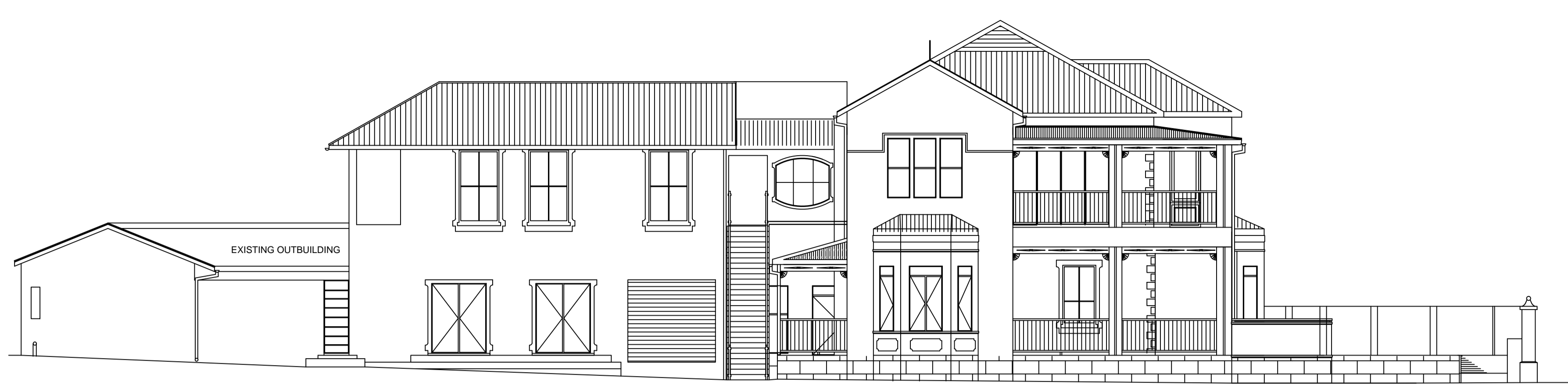
SOUTH-EAST ELEVATION Scale 1:100