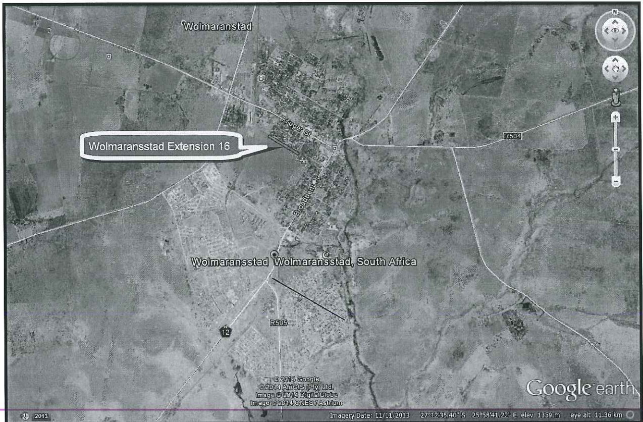
Plate 1: Google image depicting locality of proposed township area

The proposed township area detailed above is located within the area of jurisdiction of the Maquassi Hills Local Municipality which in turn falls within the area of jurisdiction of the Dr. Kenneth Kaunda District Municipality.