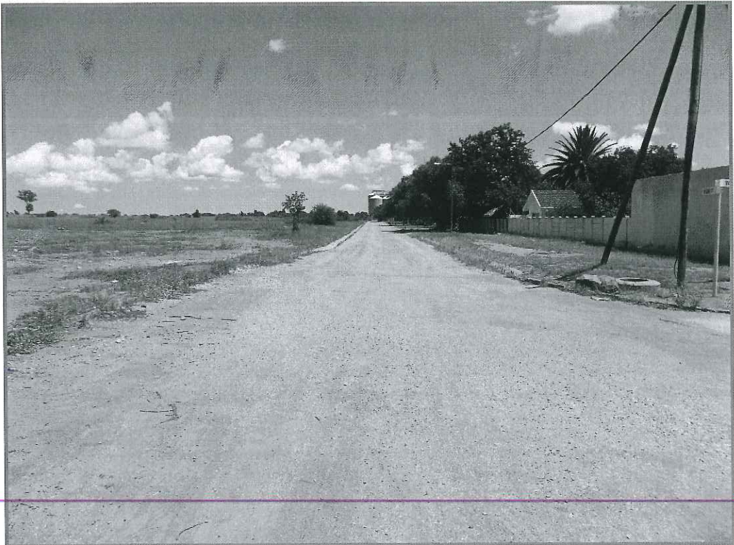
Plate 6: View of Kock Street - Direction west

and will have to be constructed to allow for Erven 5177 to 5182 in the proposed township area to be accessed from Kock Street.