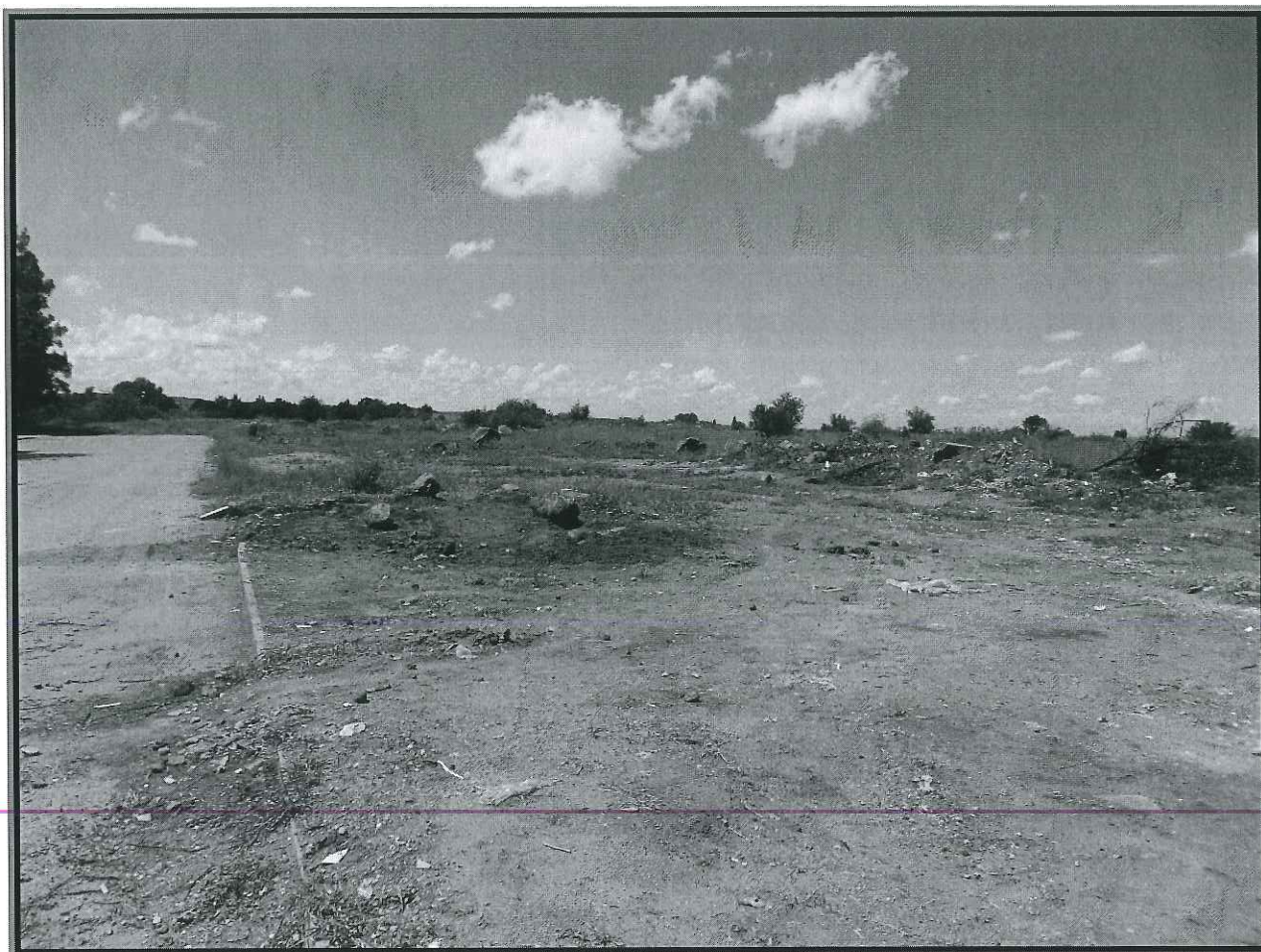
Plate 3: View of development area from Kock Street/Van Riebeeck Street intersection – Direction east

Some informal dumping of building rubble has taken place on the development area, as is evident from Plate 3.