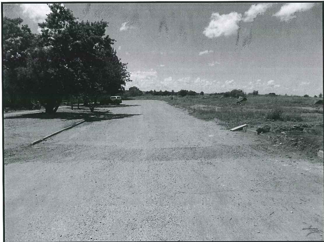
Plate 7: View of Kock Street - Direction east