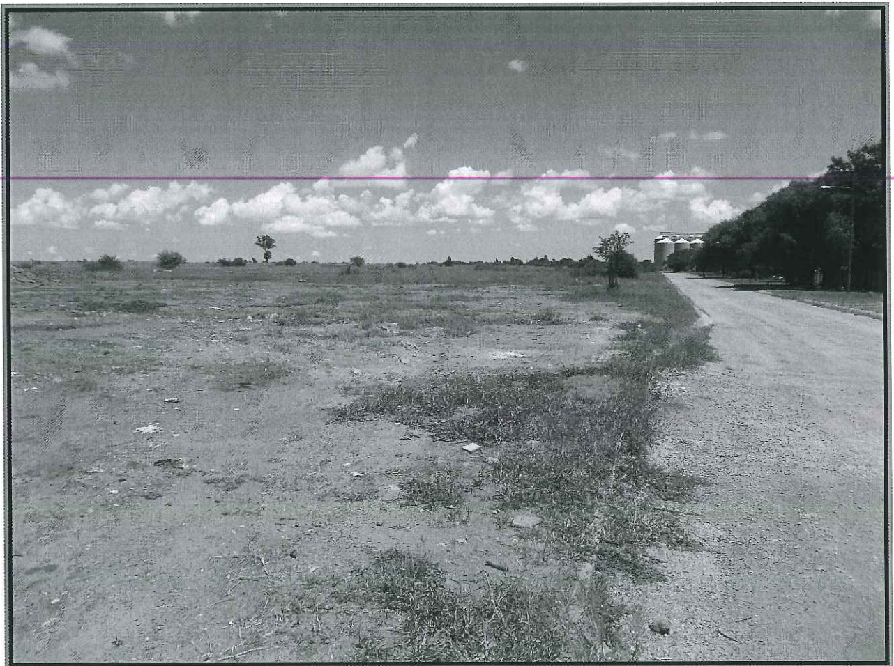
Plate 2: View of development area from Kock Street/Van Riebeeck Street intersection – Direction west

The proposed development area is currently vacant with the exception of some infrastructure that was recently erected to provide water to the adjacent Wolmaransstad Old Age Home.