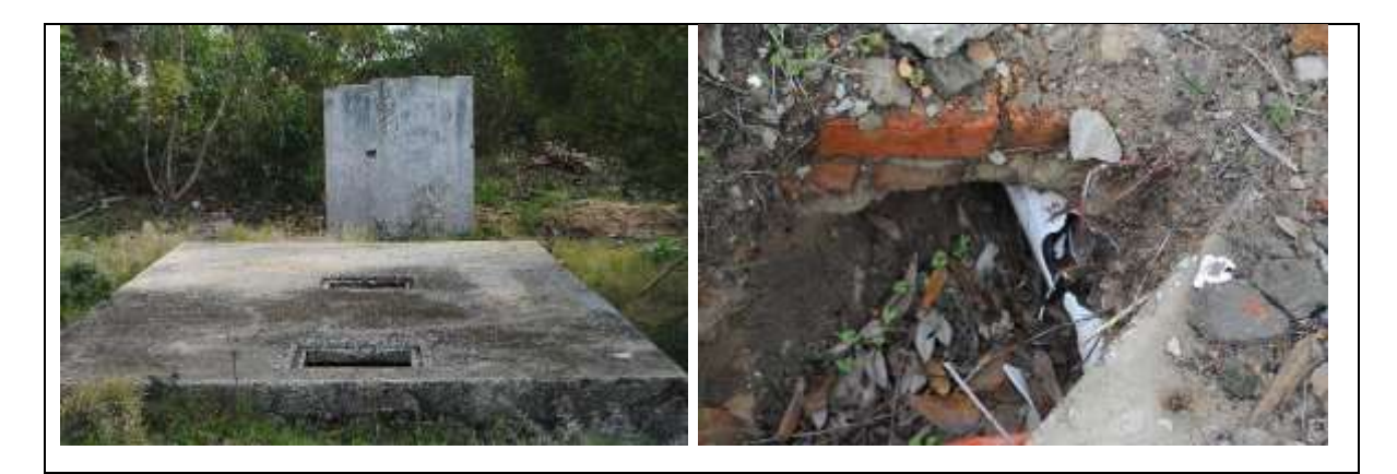
QBE3 – The existing building service infrastructure is in poor condition.