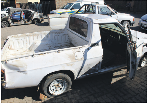
A stolen Nissan bakkie that claimed the life of Clearance on Wednesday.