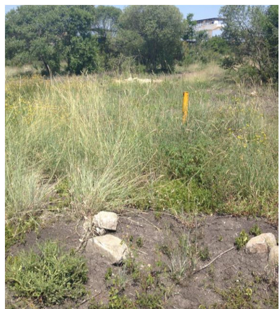
Figure 1: Example of rehabilitated drill site within the planned prospecting right closure area

Please let us know if there are any additional parties that should be involved.