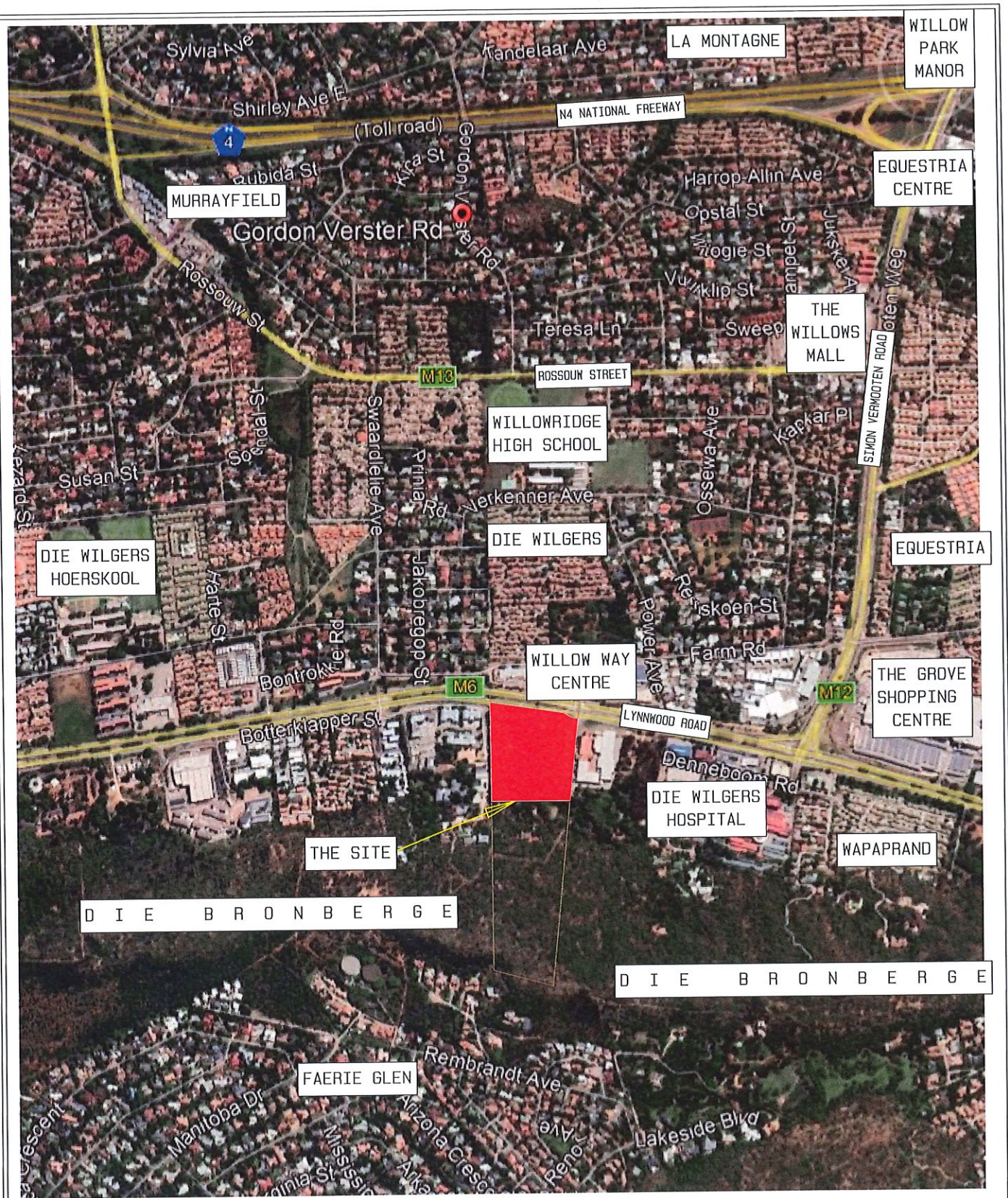
FIGURE 1: LOCALITY MAP

PROPOSED TOWNSHIP ESTABLISHMENT: A CERTAIN PART OF PORTION 141 OF THE FARM THE WILLOWS 340-JR