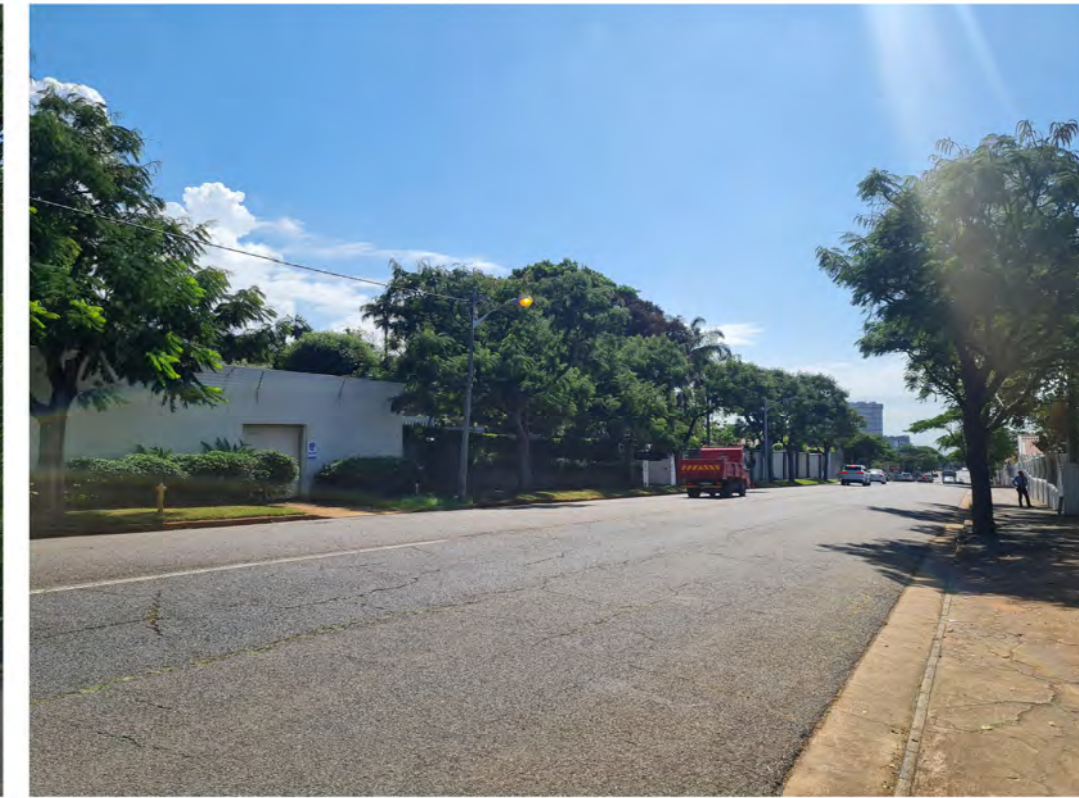
INNES ROAD LOOKING NORTH EAST