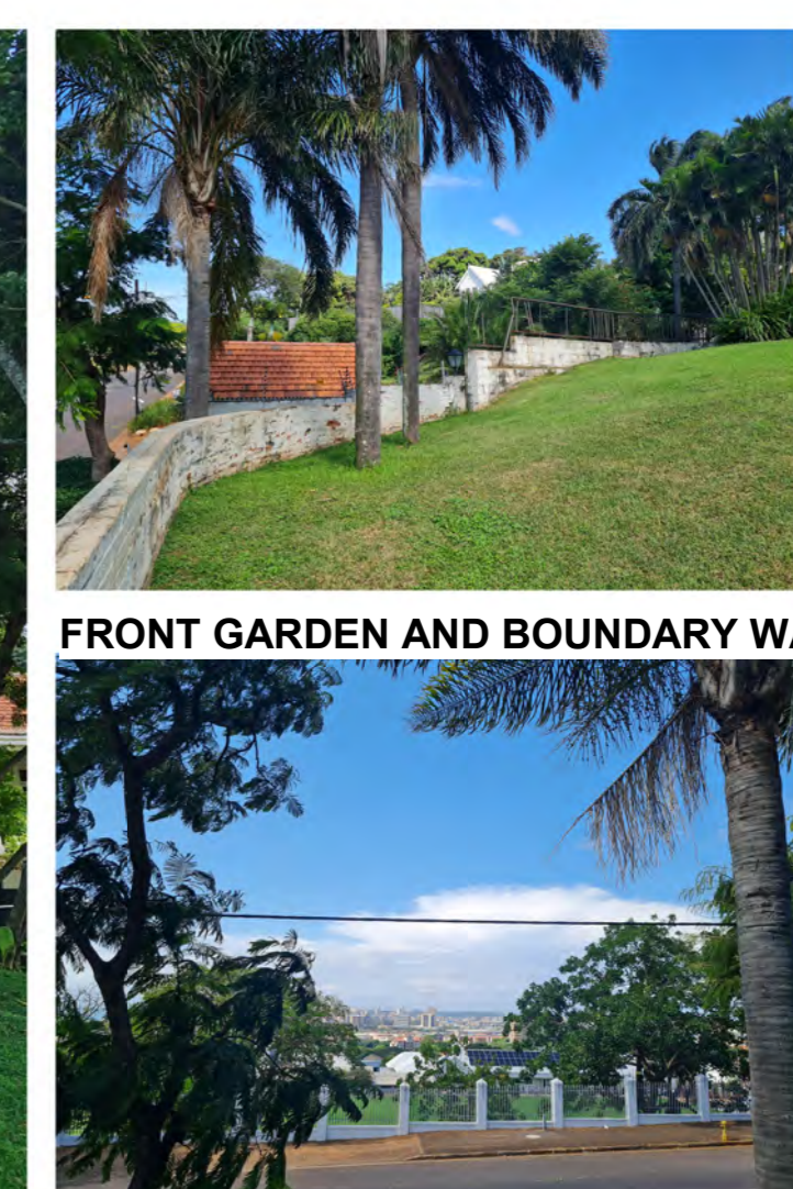
FRONT GARDEN AND BOUNDARY WALL