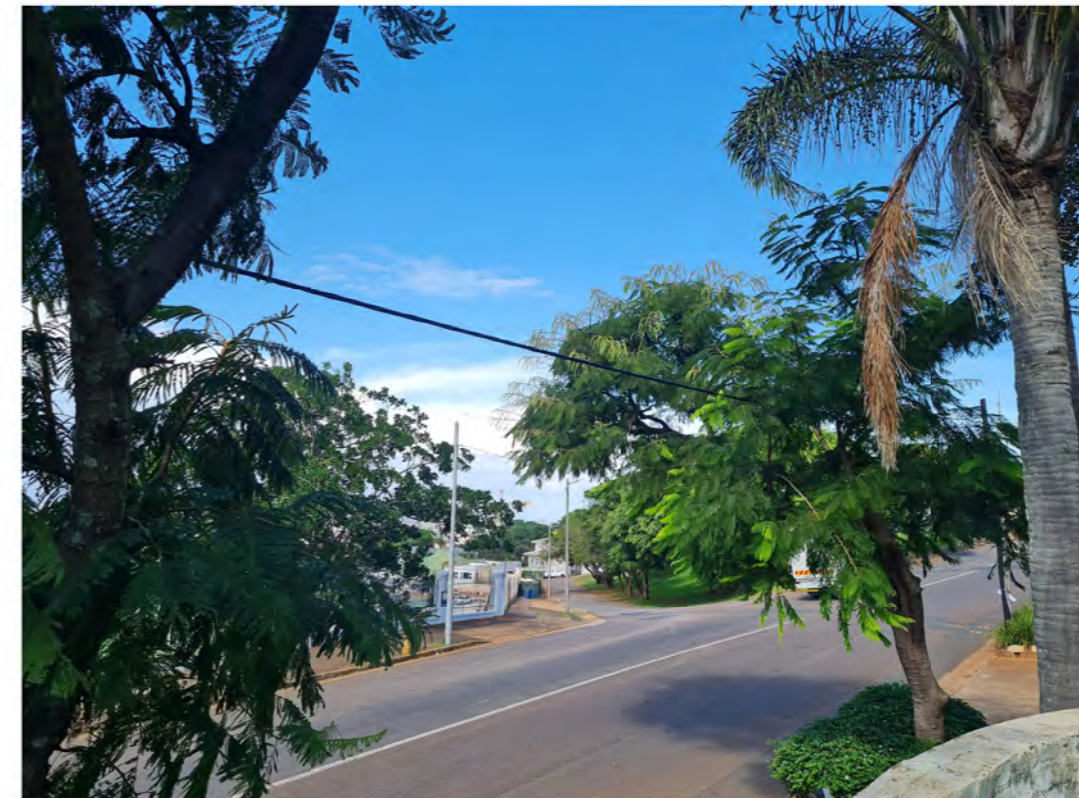
INNES ROAD LOOKING SOUTH WEST