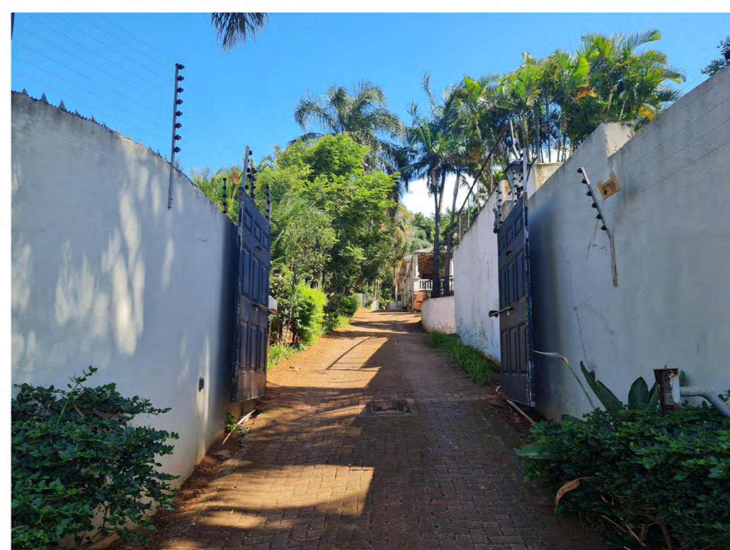
MAIN DRIVEWAY ENTRANCE TO 260 INNES ROAD