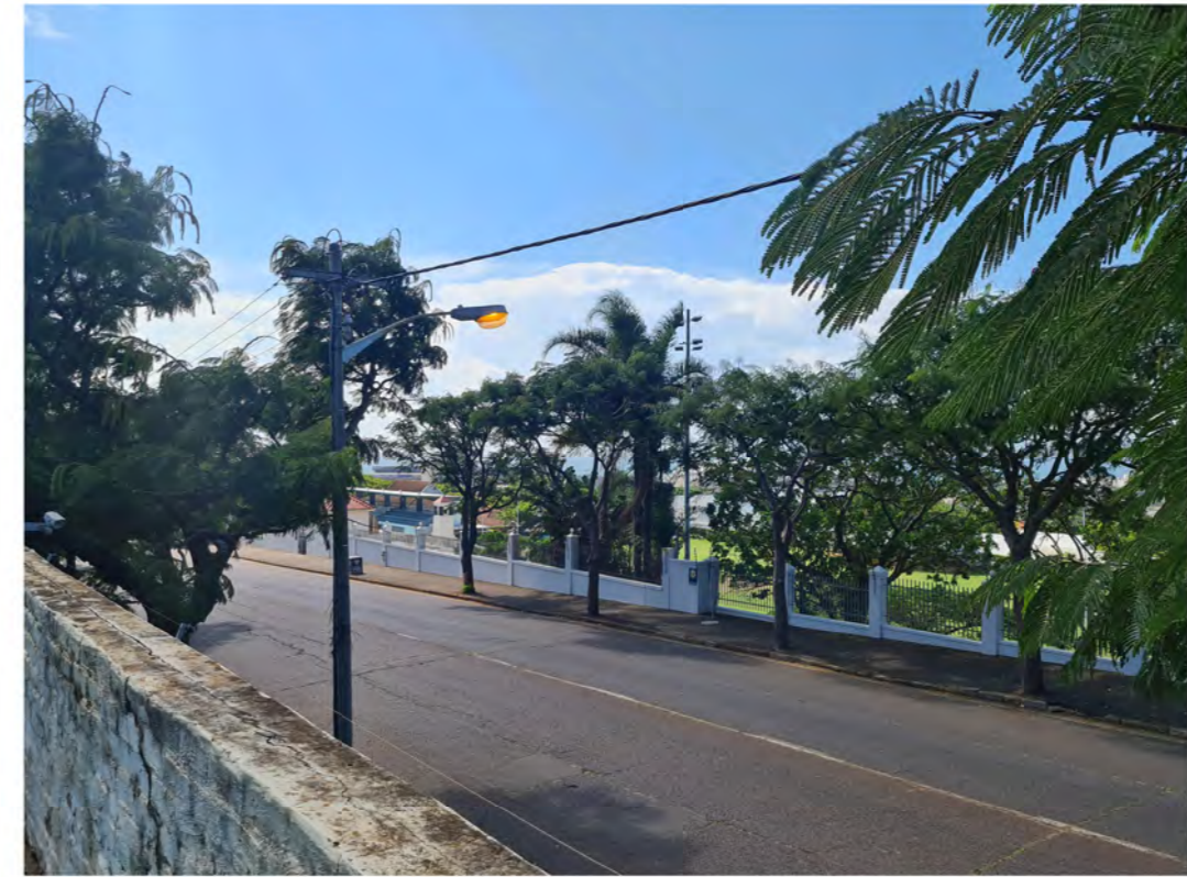
INNES ROAD LOOKING NORTH EAST