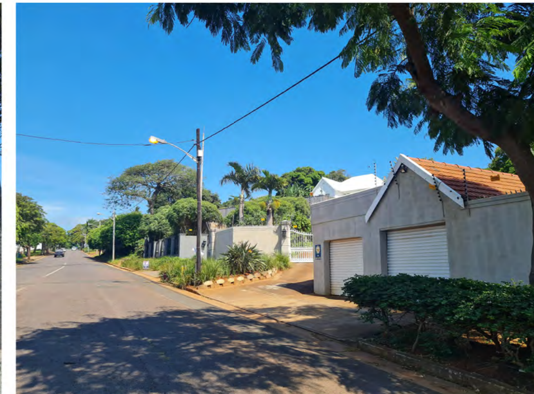
INNES ROAD LOOKING SOUTH WEST