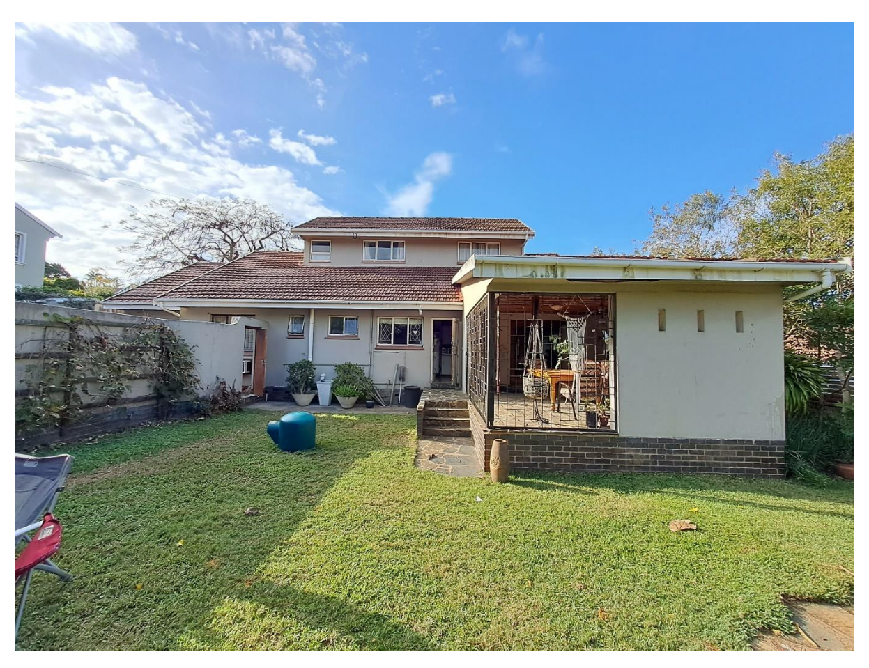
The existing verandah that will be extended.