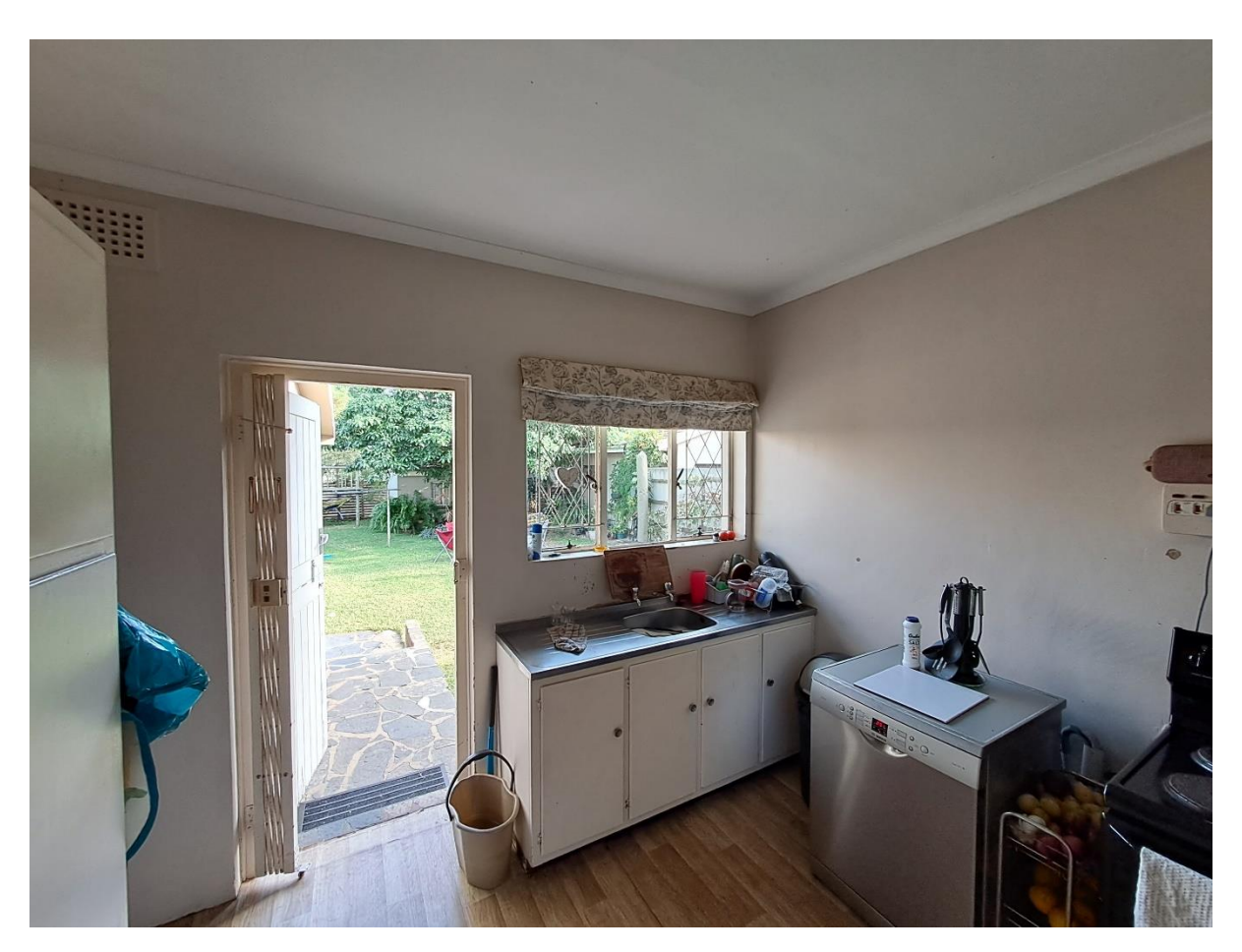
The existing kitchen that will be altered.