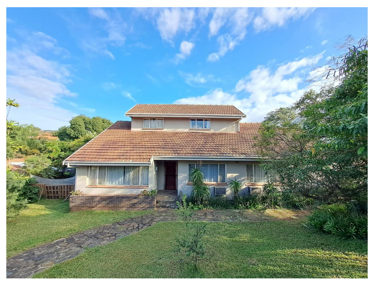
The existing entrance area of the property.