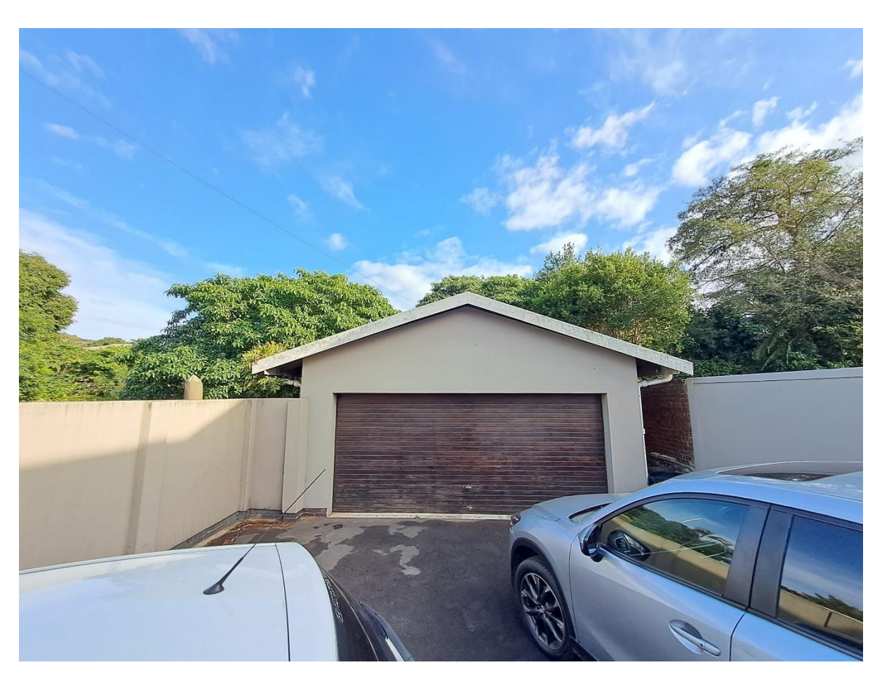
The existing garage door.