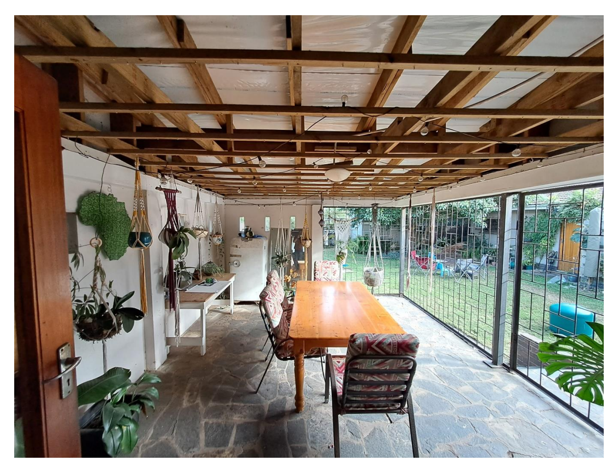
The existing verandah that will be extended.