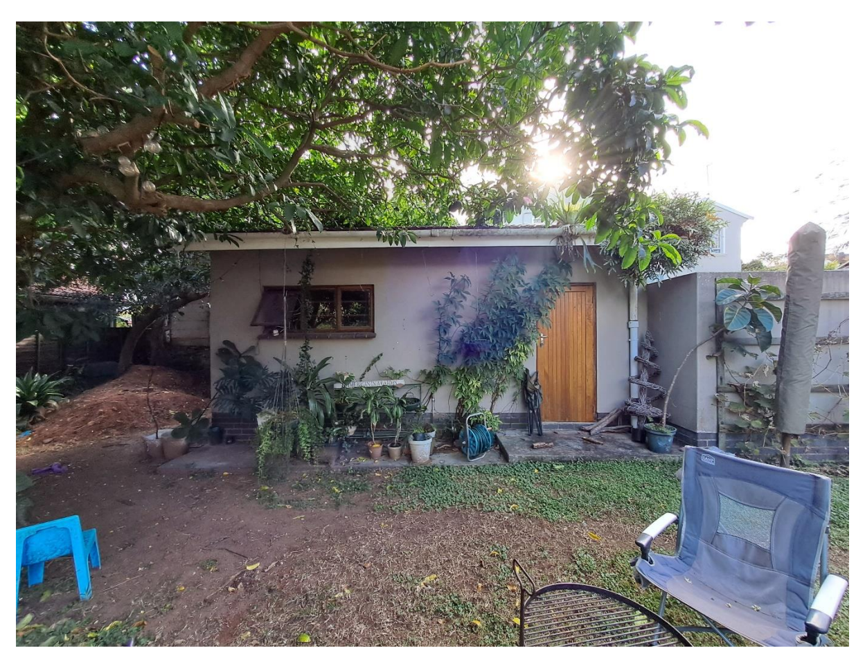
The existing garage.