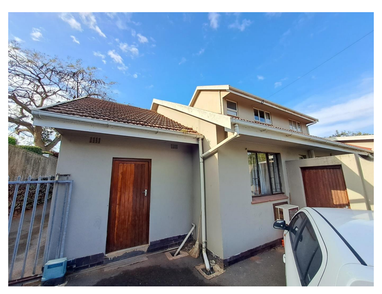
The existing laundry room.