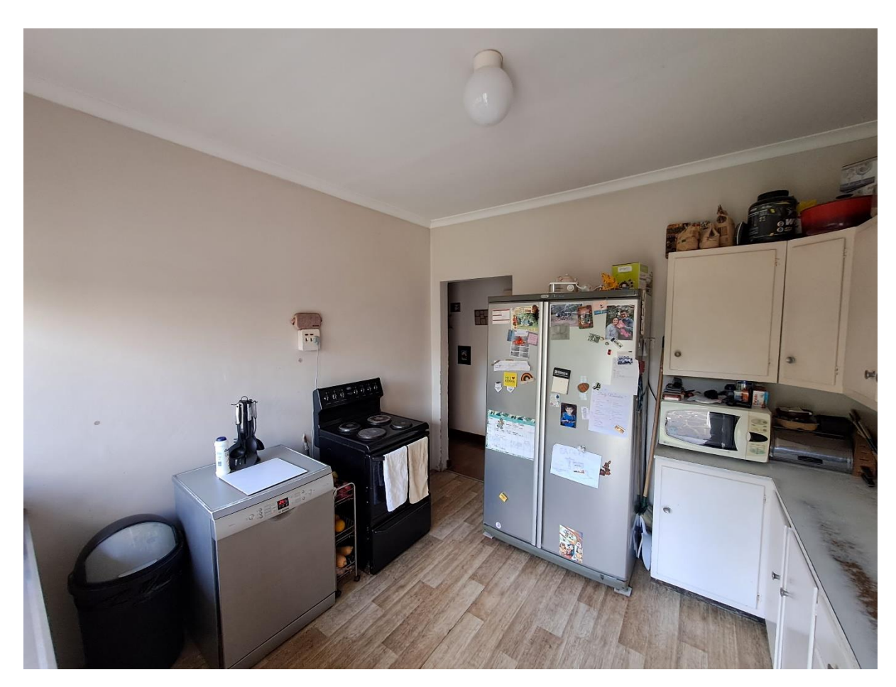
The existing kitchen that will be altered.