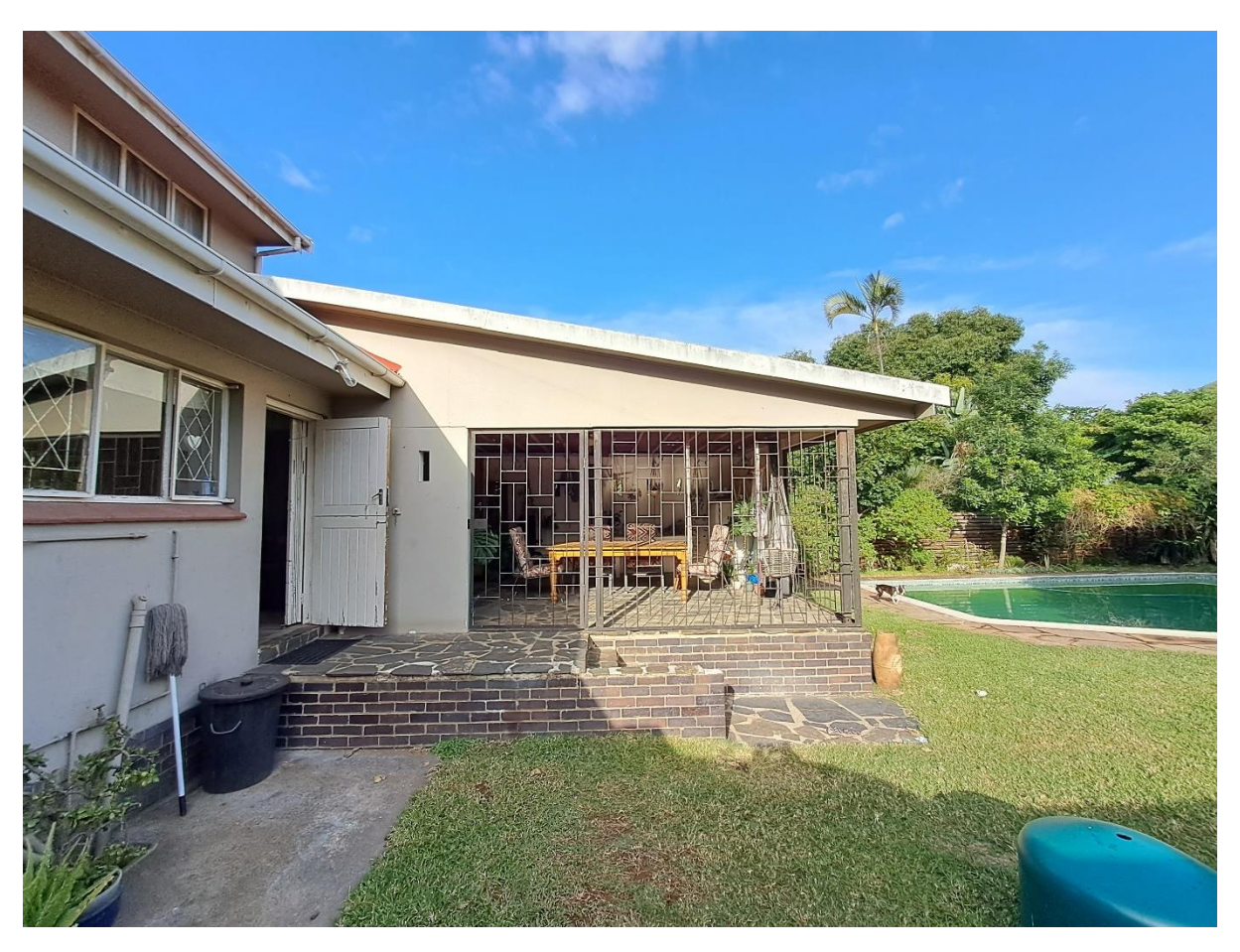
The existing verandah that will be extended.