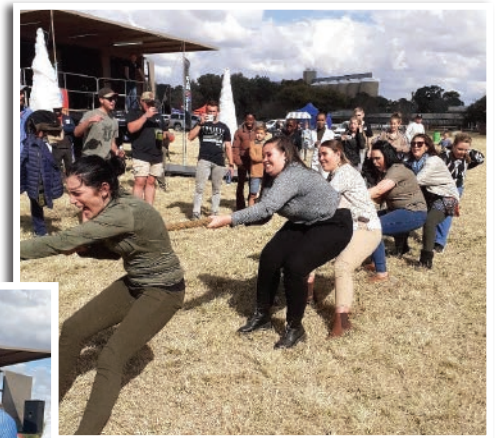
Die mans- en vroue tourek items op die program was 'n hoogtepunt en het vir groot opwinding gesorg.