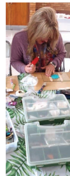
Dames hard aan die werk en pragtige oorbelle in wording.