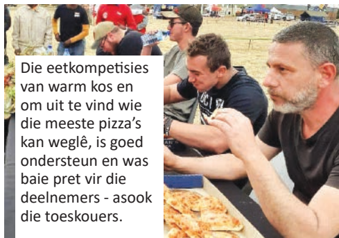
Die eetkompetisies van warm kos en om uit te vind wie die meeste pizza's kan weglê, is goed ondersteun en was baie pret vir die deelnemers - asook die toeskouers.