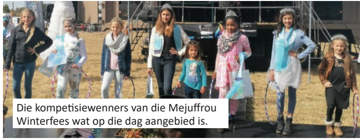
Die kompetisiewenners van die Mejuffrou Winterfees wat op die dag aangebied is.