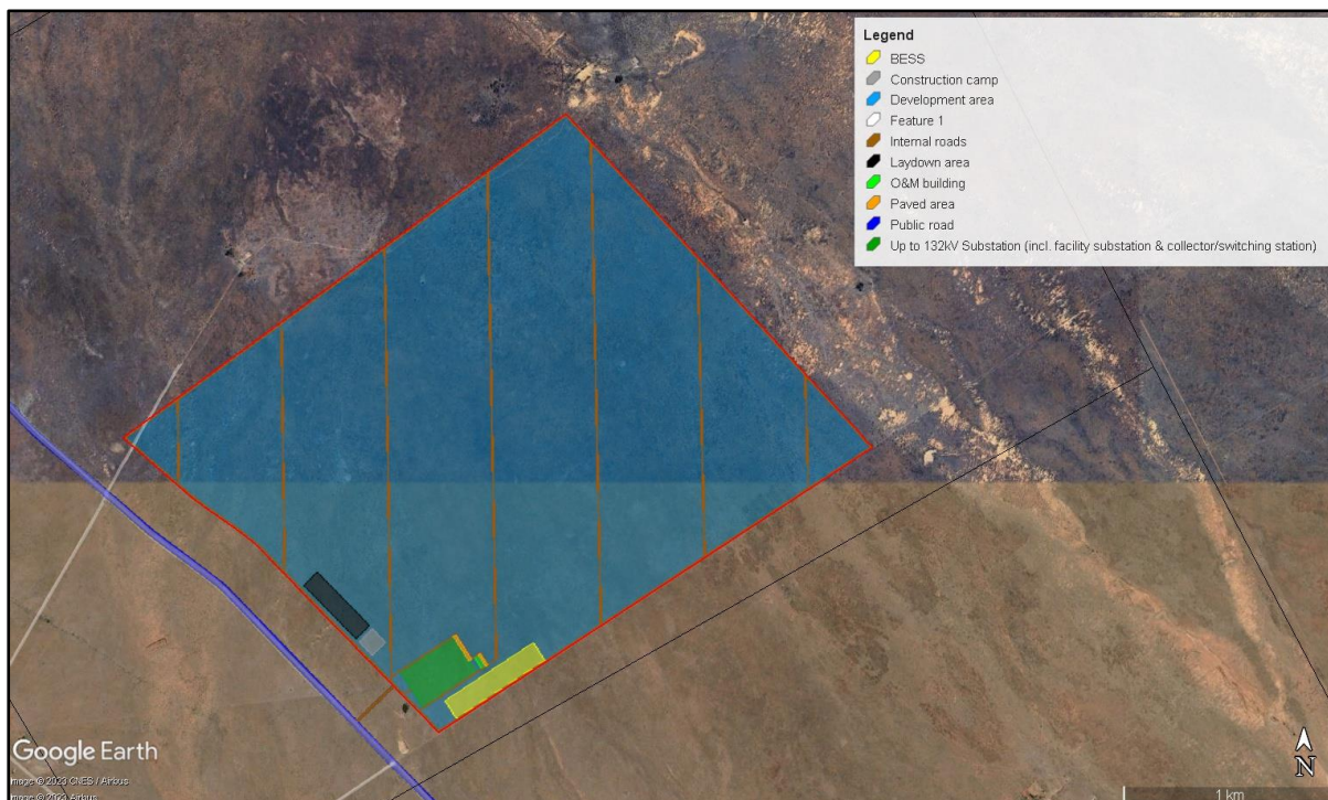
Figure 1: Preferred Conceptual Site Layout Plan

The construction phase will include the following activities: