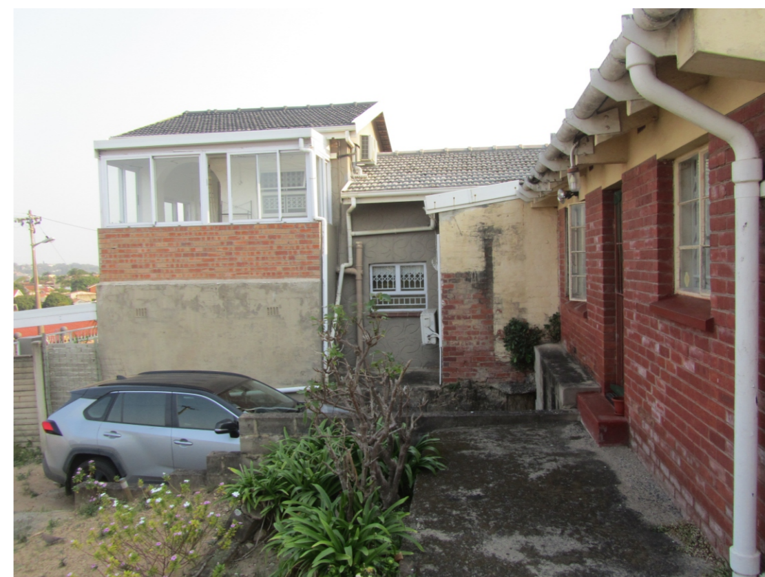
ADJACENT DWELLING WITH ILLEGAL ADDITIONS

theGILD <architects> PROJECT NO. tG_22.16