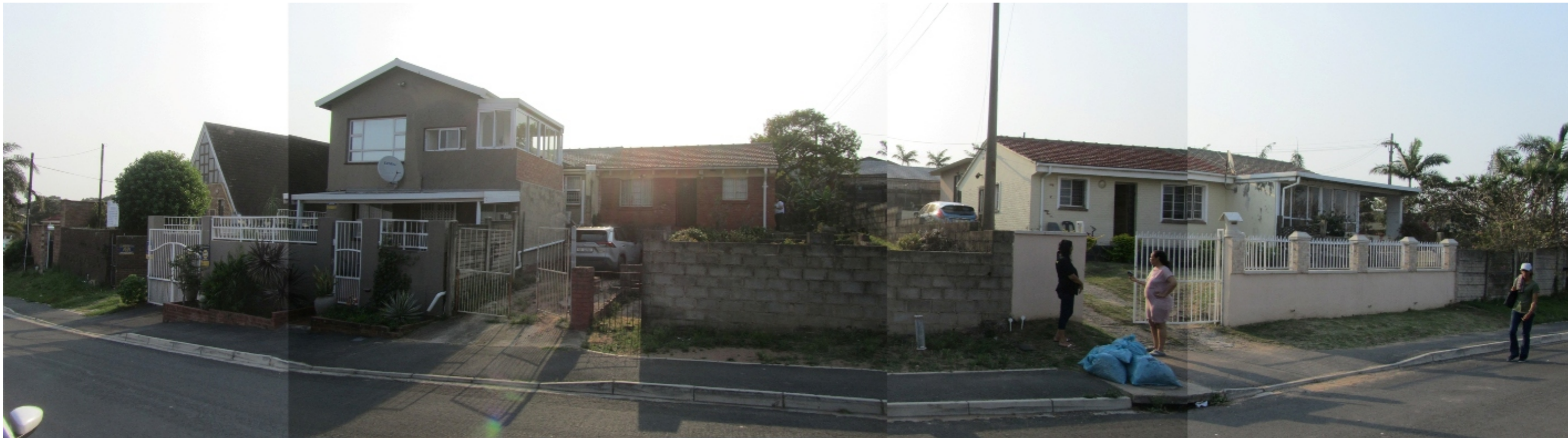
PANORAMIC STREET-SCAPE VIEW - 9 CORNELIUS & ADJACENT PROPERTIES