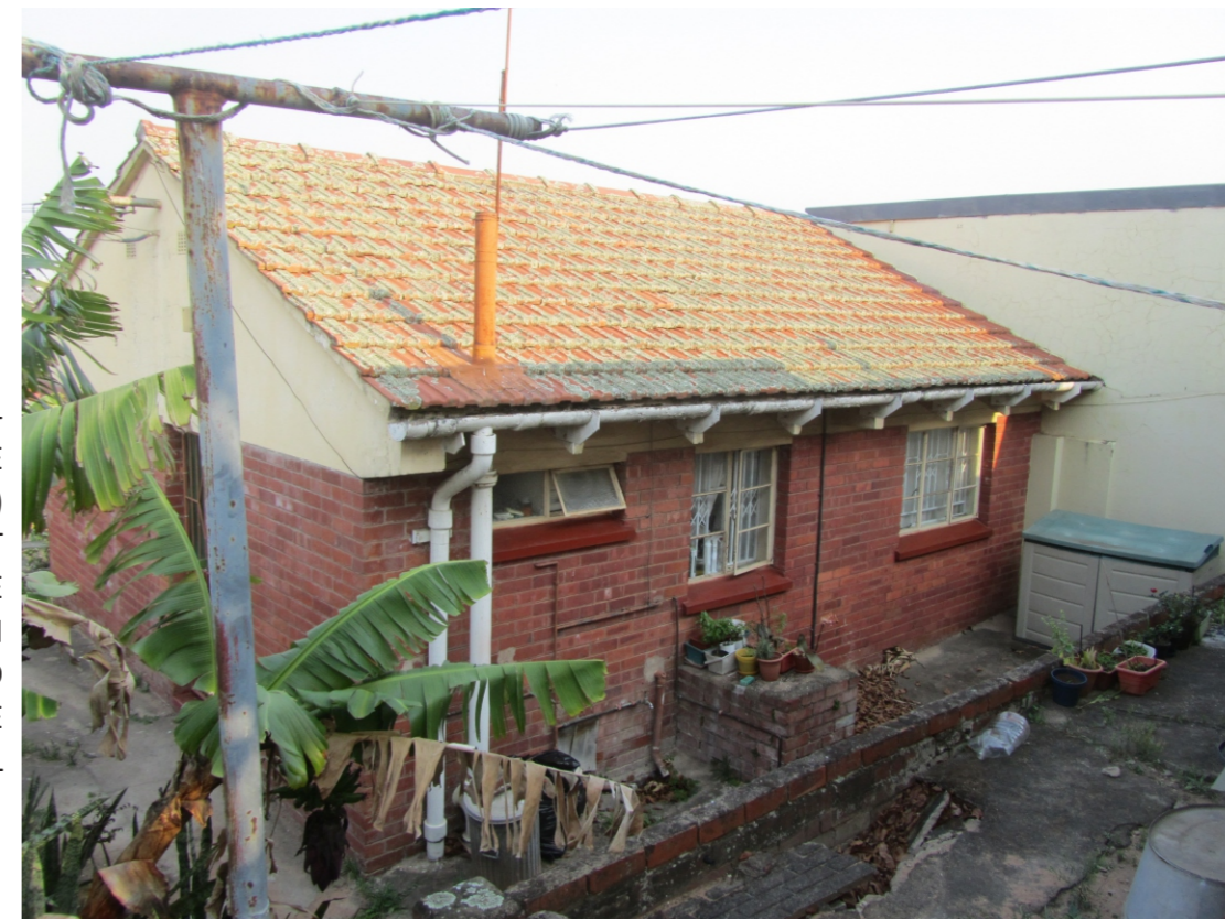
WEST ELEVATION - ORIGINAL HOUSE (C. 1955) - NOTE RECENT FLOOD DAMAGE TO SLAB IN FOREGROUND & SHARED FIRE WALL/PARTY WALL