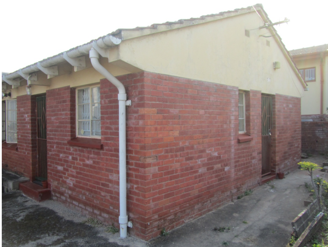
NORTH ELEVATION - ORIGINAL HOUSE (C. 1955)