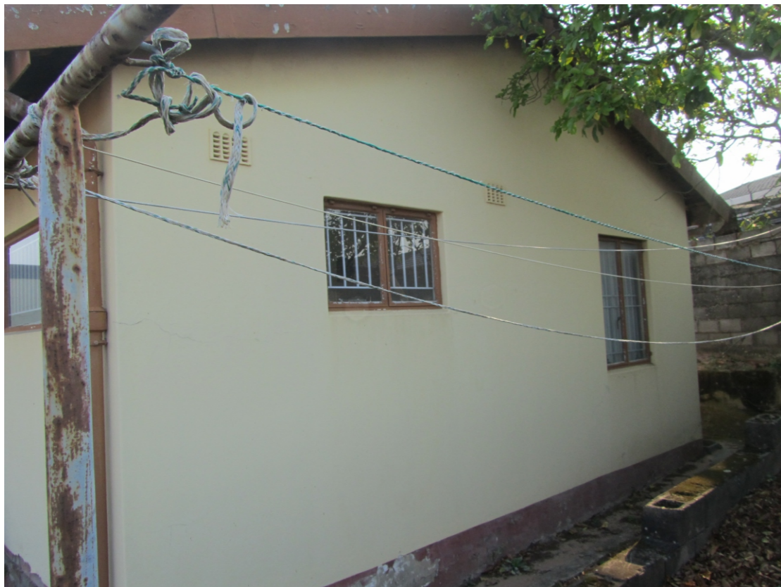
NORTH ELEVATION - OUTBUILDING (C. 1976)