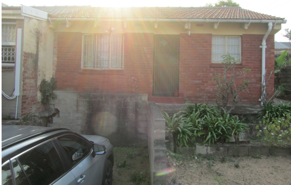
EAST ELEVATION - ORIGINAL HOUSE (C. 1955)