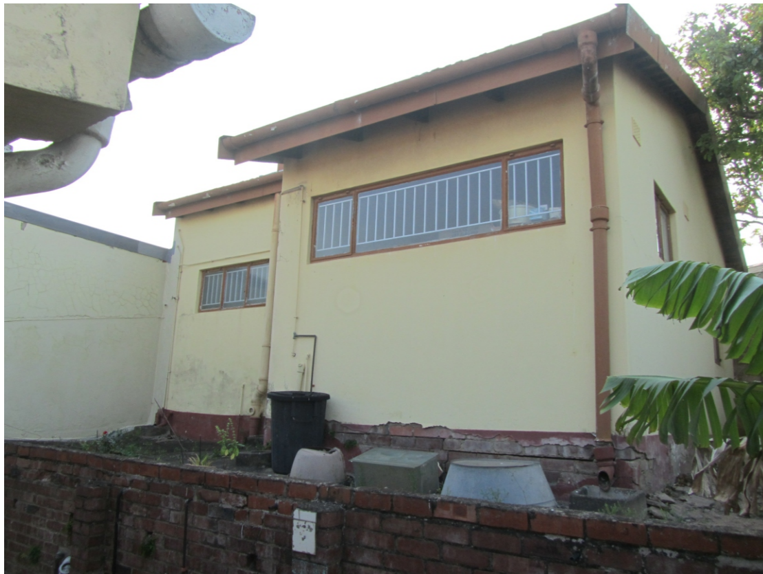
EAST ELEVATION - OUTBUILDING (C. 1976)