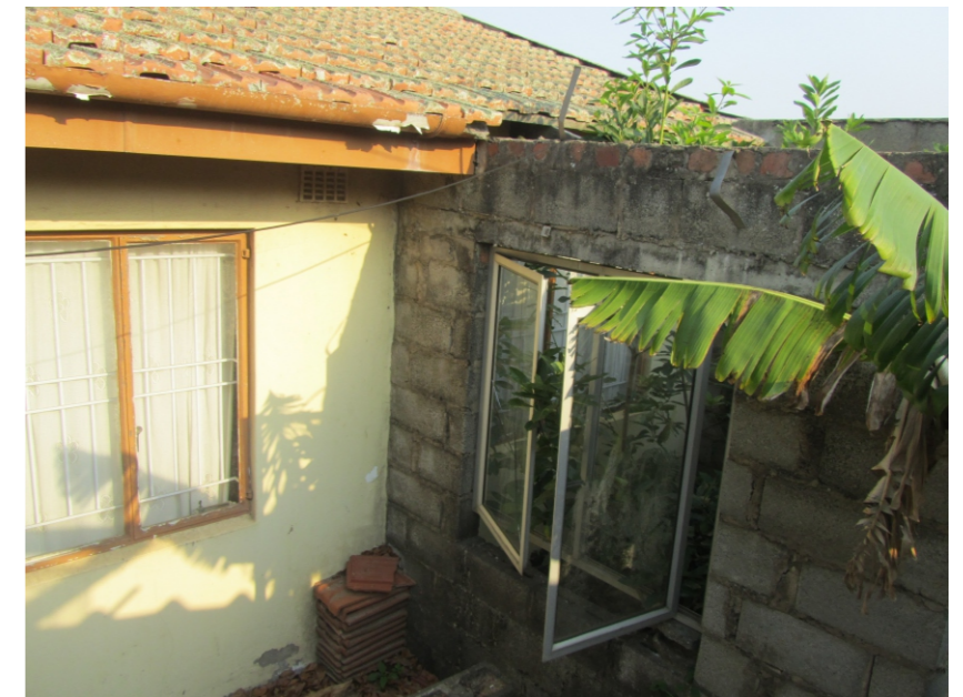
WEST ELEVATION VIEWS- OUTBUILDING (C. 1976) - NOTE INCOMPLETE PREVIOUS ADDITION, TO BE DEMOLISHED