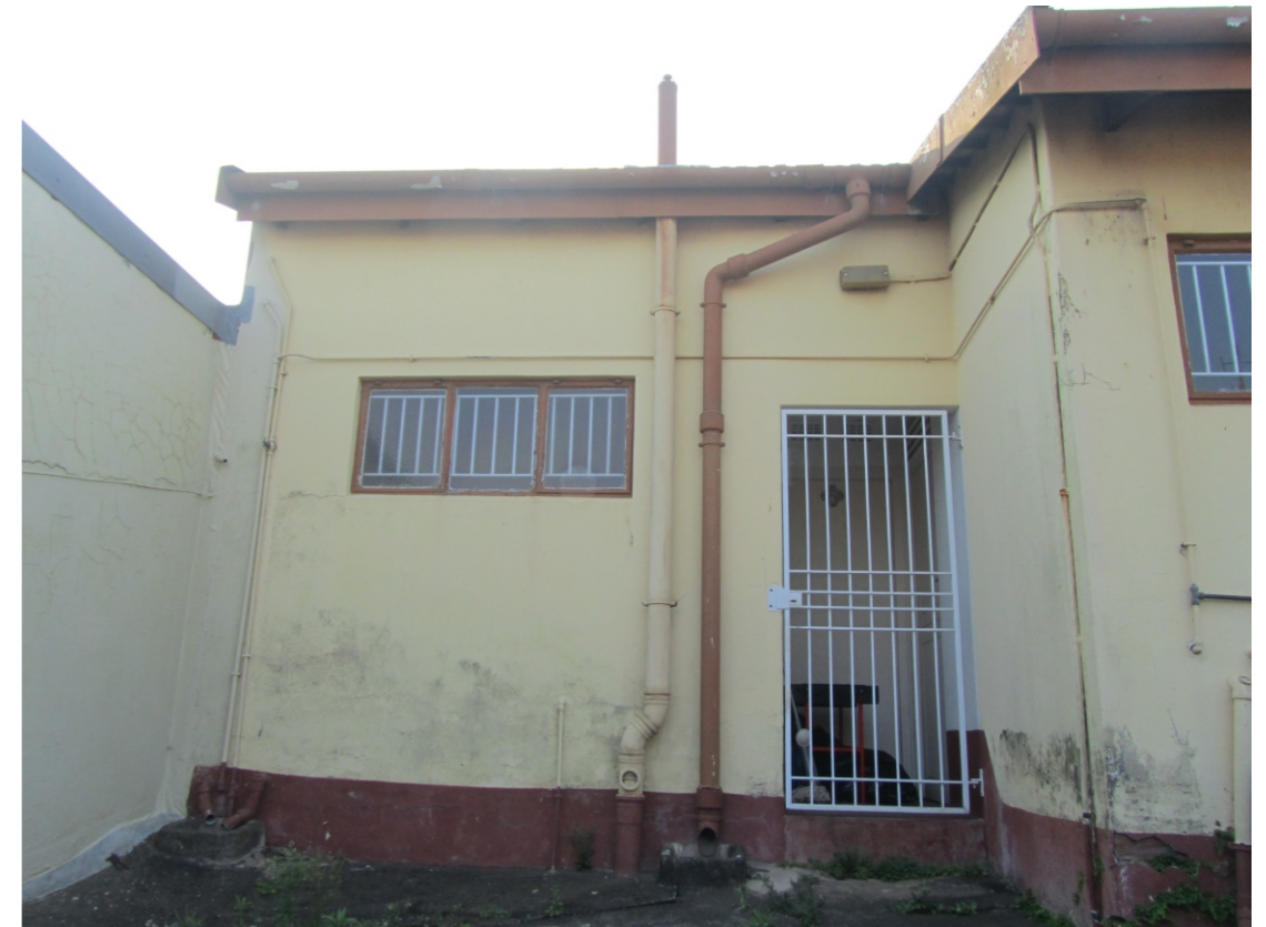
EAST ELEVATION - OUTBUILDING (C. 1976)