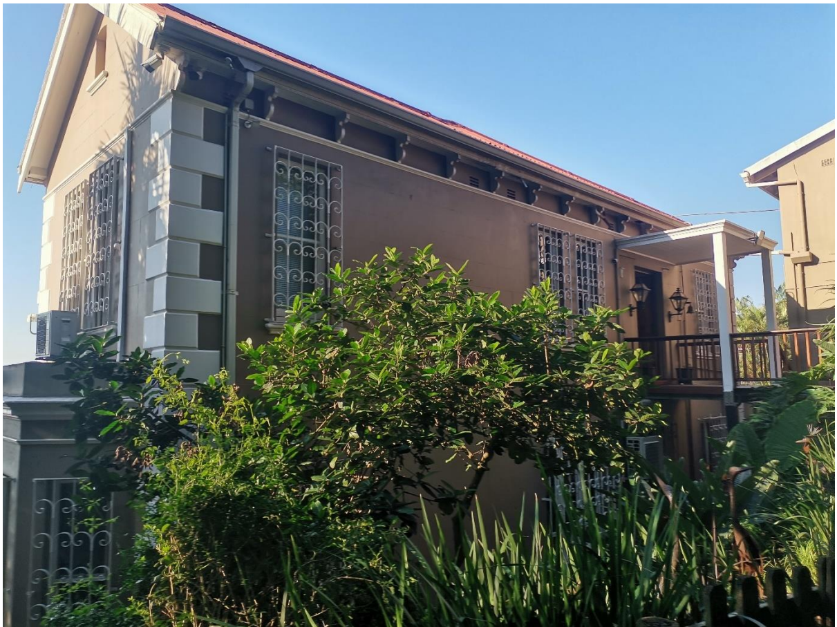
8. WEST/REAR ELEVATION OF EXISTING HOUSE