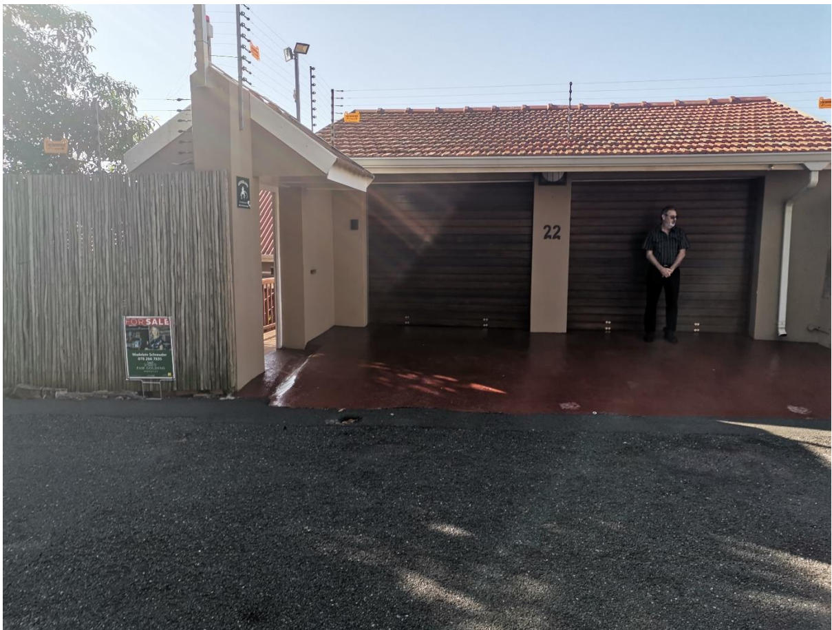
16. EXISTING GARAGE FROM ROAD