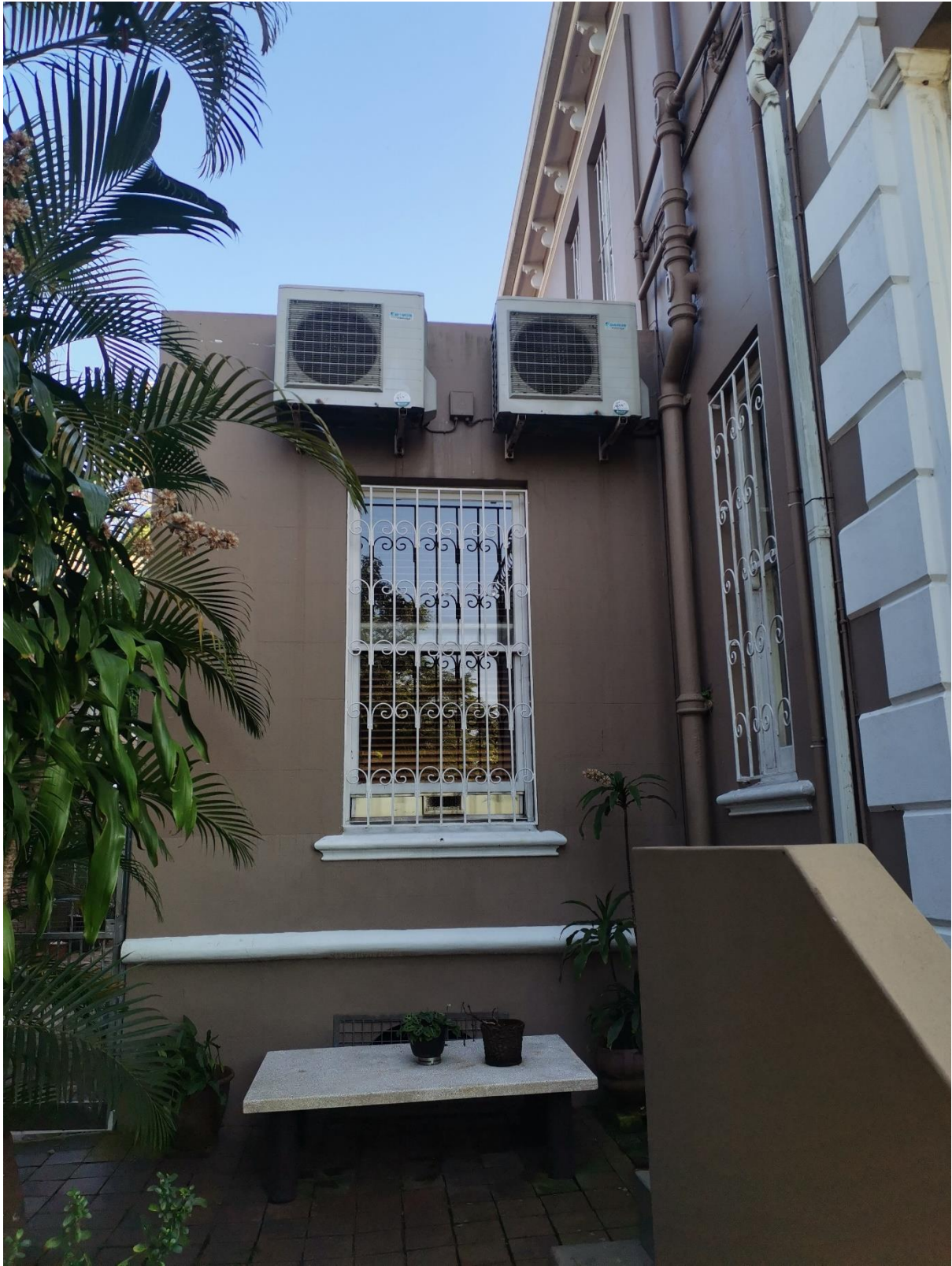
13. EAST ELEVATION SHOWING EXISTING WINDOW