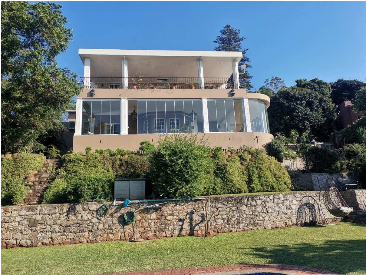
9. EAST ELEVATION SHOWING NEW GLASS WINDOWS FOR NEW SUN LOUNGE AND NEW COVERED VERANDAH ABOVE