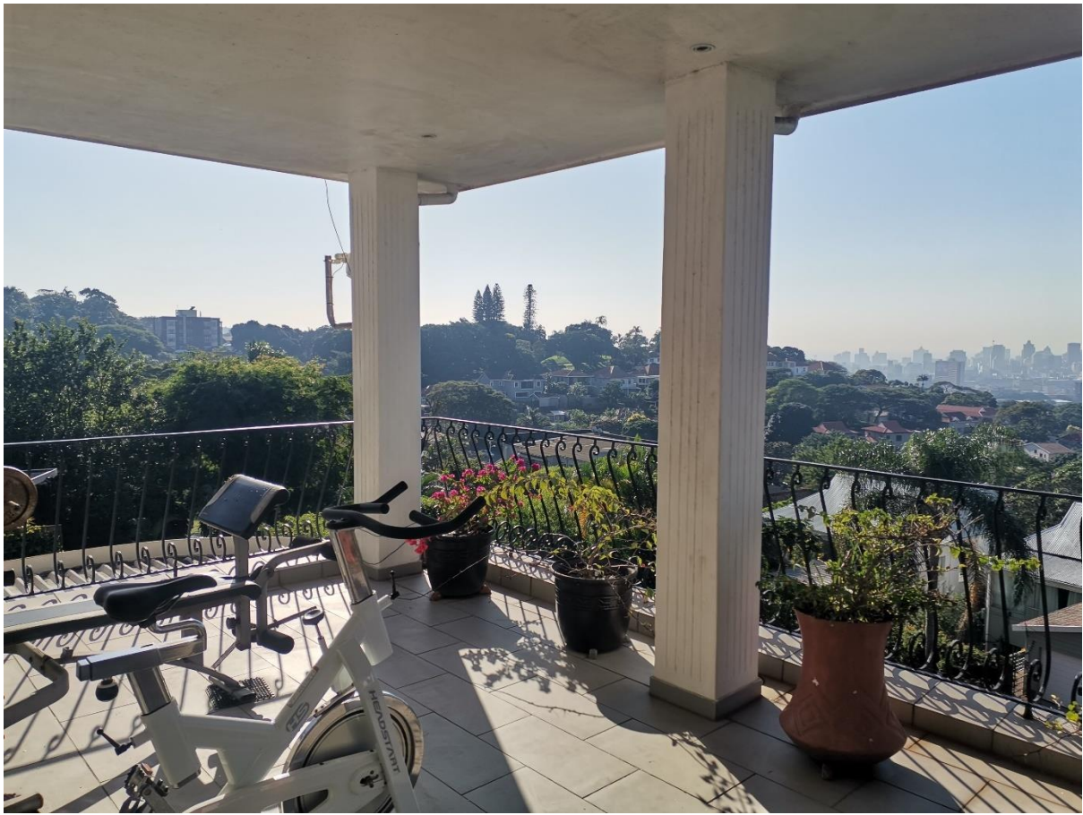
3. FIRST STOREY- NEW COVERED VERANDAH SHOWING NEW COLUMNS TO LEFT SIDE