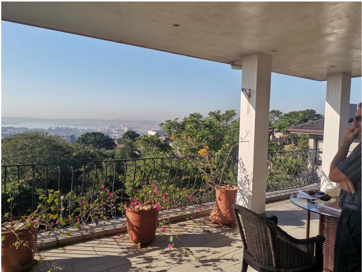
4. FIRST STOREY- NEW COVERED VERANDAH SHOWING NEW COLUMNS TO THE RIGHT SIDE