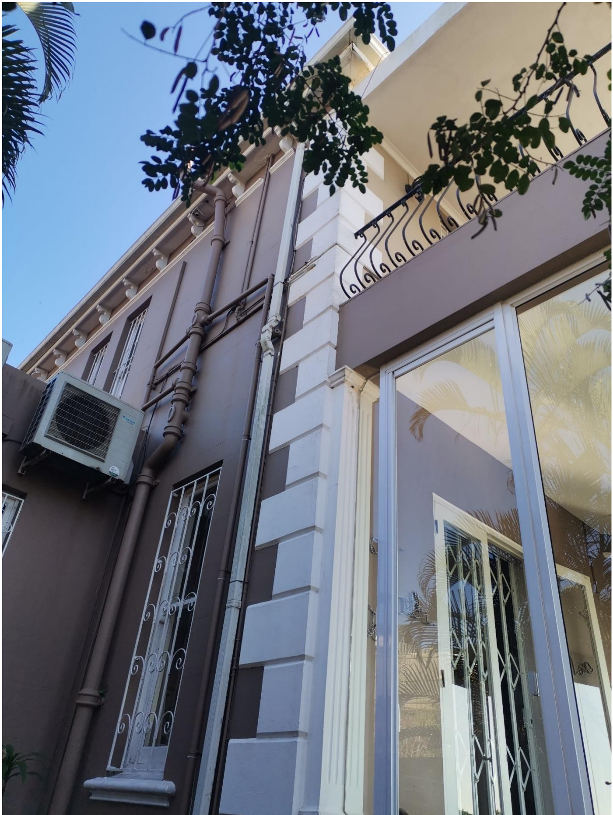
11. SOUTH ELEVATION SHOWING NEW GLASS DOOR- NEW SUN LOUNGE