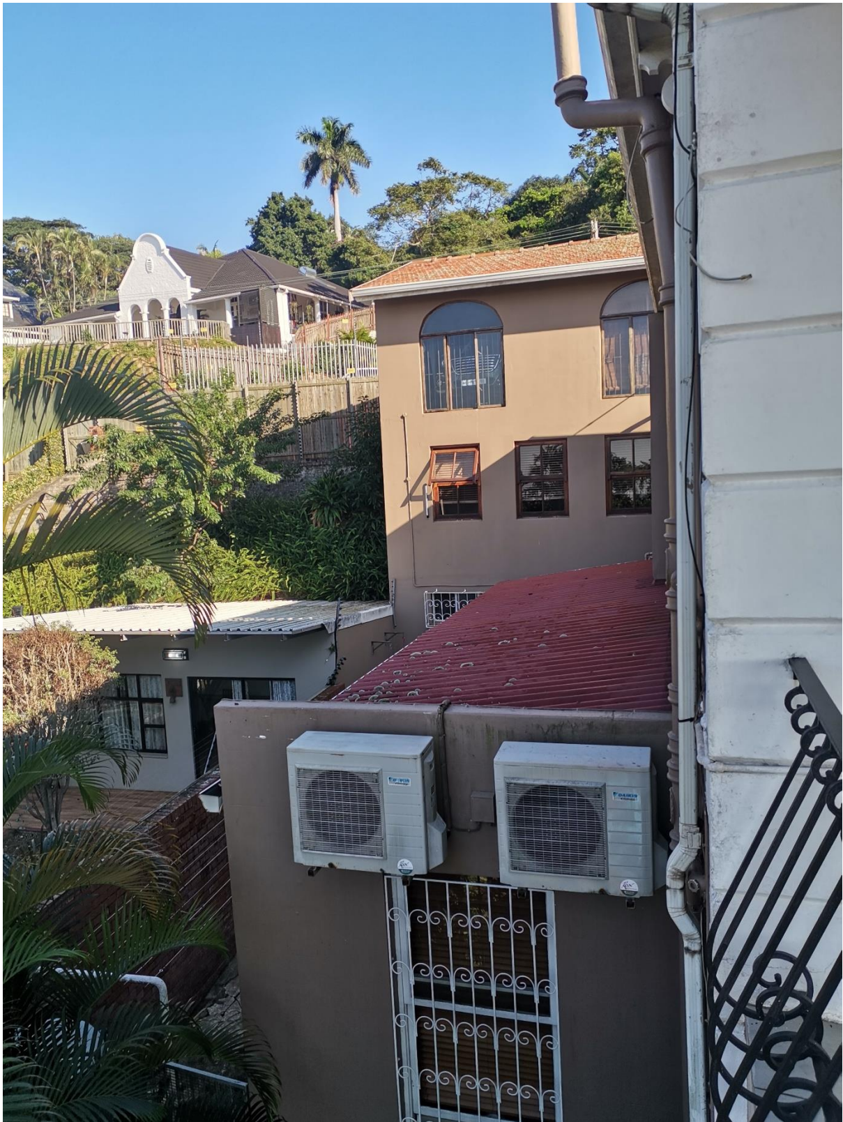
14. PART EAST ELEVATION SHOWING EXISTING WINDOW AND ROOF AND EXISTING GARAGE