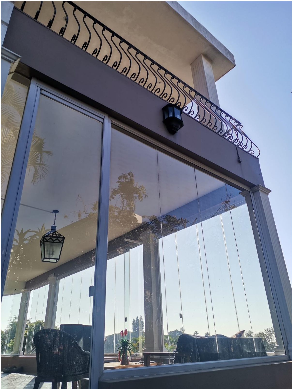
12. SOUTH ELEVATION SHOWING NEW GLASS DOOR AND WINDOWS FOR NEW SUN LOUNGE