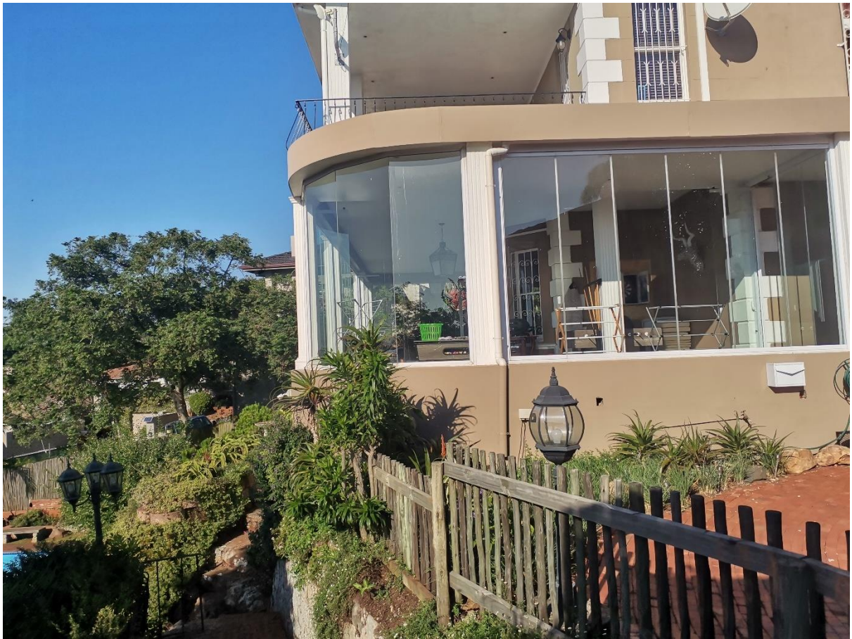
7. NORTH ELEVATION SHOWING FROM OF NEW SUN LOUNGE WITH CURVED WINDOW