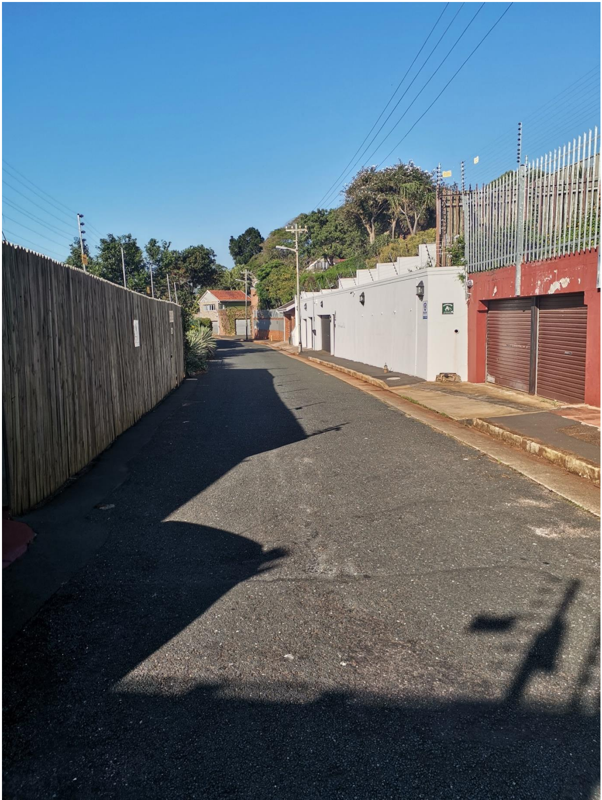
18. STREETScape OF HARALDENE ROAD LOOKING SOUTH SHOWING EX. TIMBER FENCING