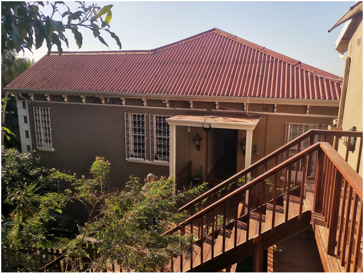
15. WEST ELEVATION OF EXISITNG HOUSE