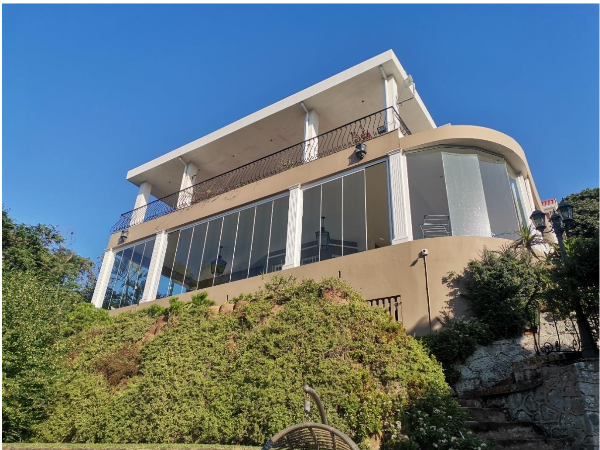
10. CLOSE UP EAST ELEVATION VIEW SHOWING NEW WINDOWS AND NEW COLUMNS AND ROOF ABOVE