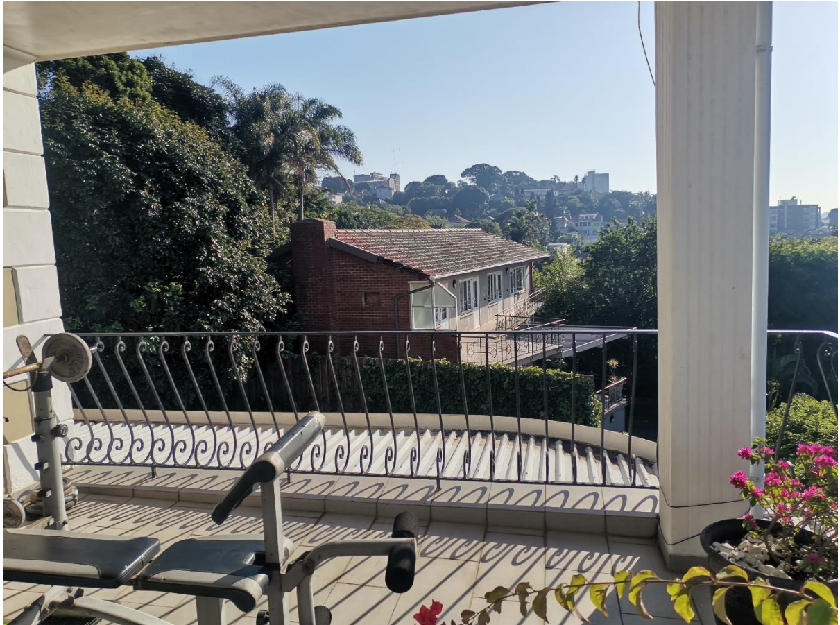
2. NEIGHBOURS PROPERTY TO THE LEFT