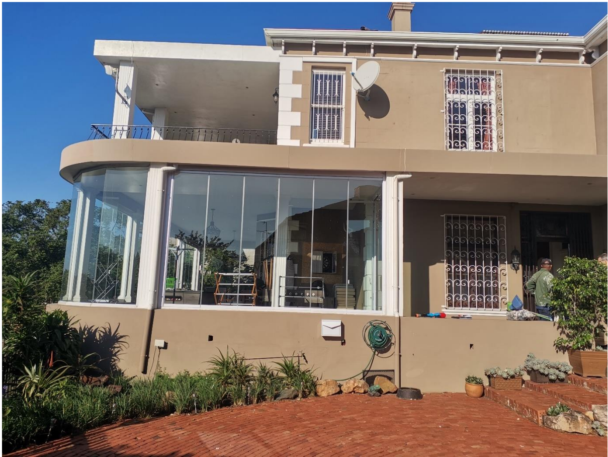
5. PART NORTH ELEVATION SHOWING NEW SUN LOUNGE