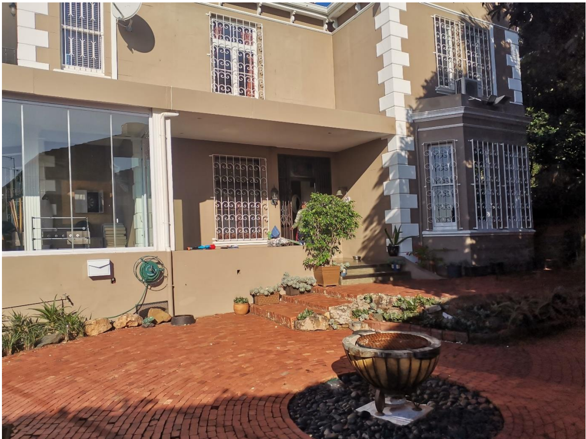
6. PART NORTH ELEVATION