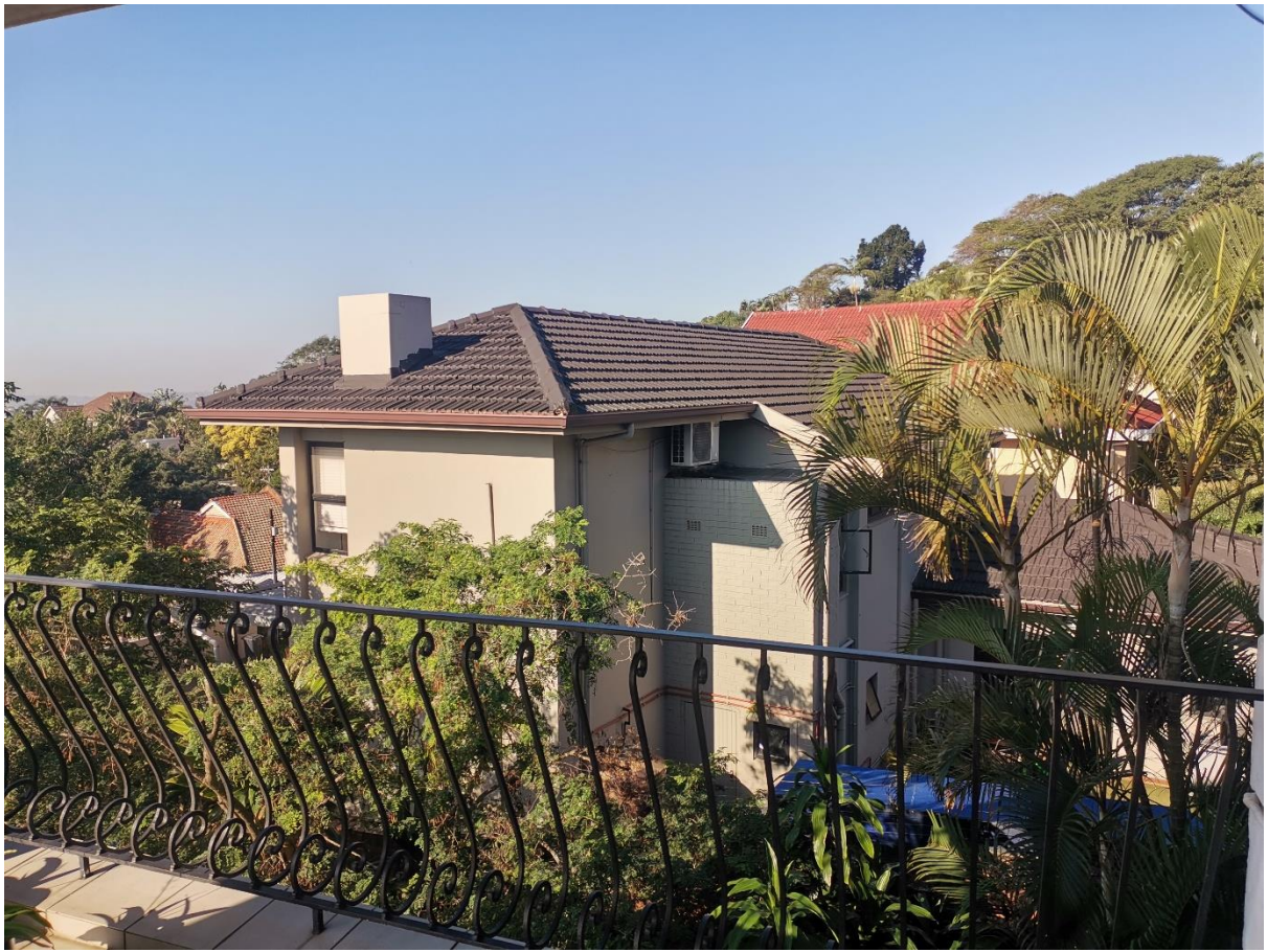
1. NEIGHBOURS PROPERTY TO THE RIGHT