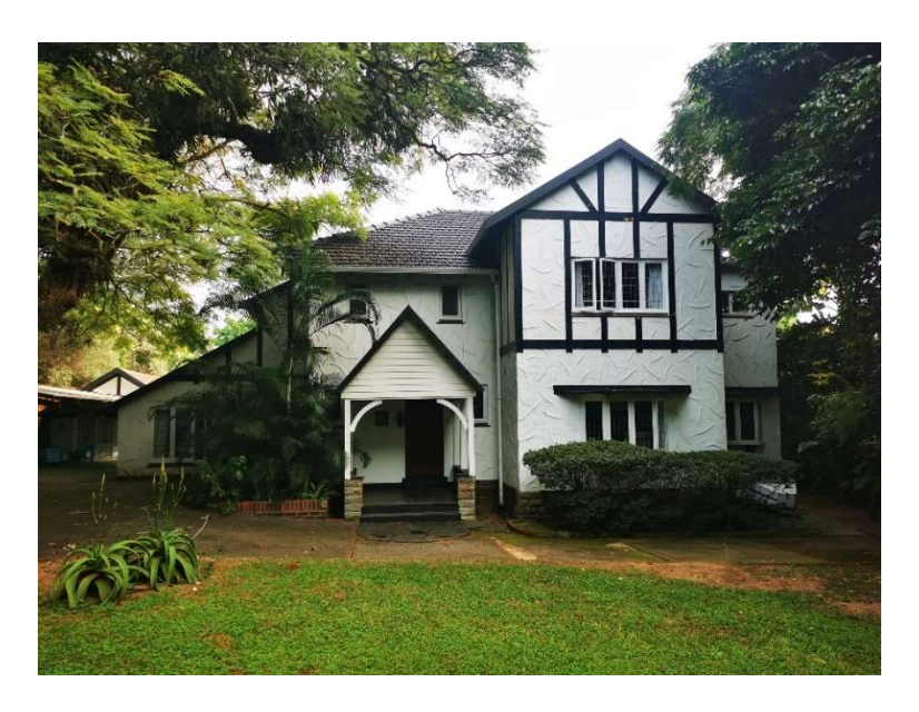
The existing timber-stained glass windows on the Front Elevation will be retained and refurbished.