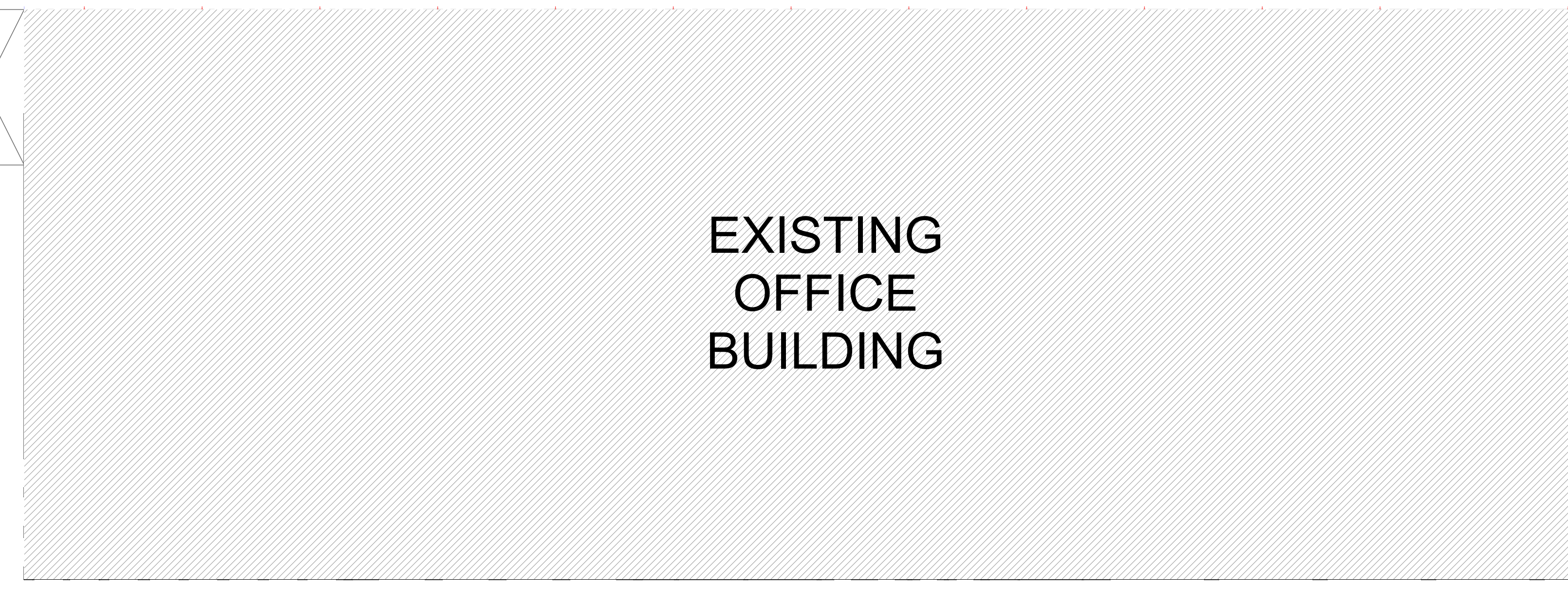
EXISTING OFFICE BUILDING