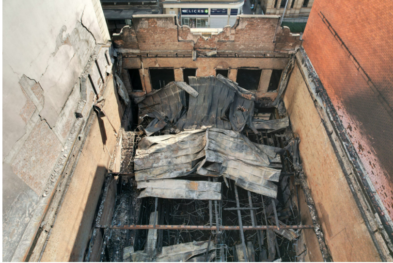
Plate19 - Drone photograph indicates the extensive damage to the complex.JPG