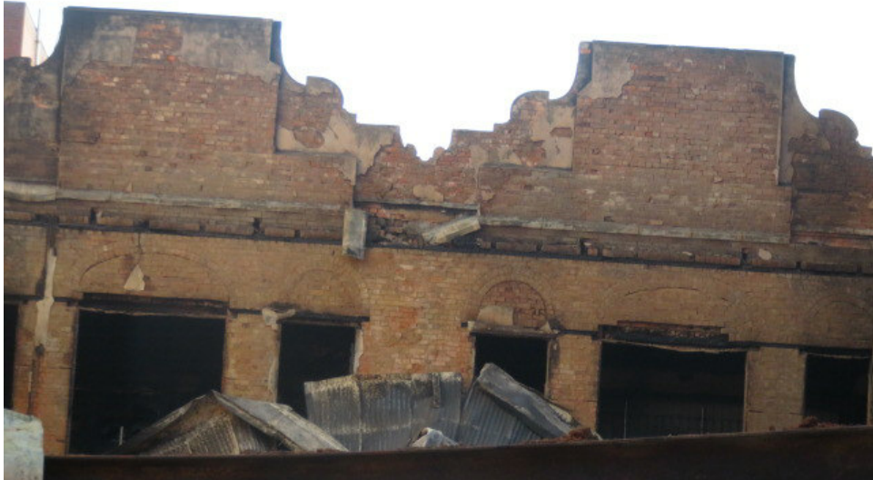
Plate 16 - Rear gable compromised.JPG