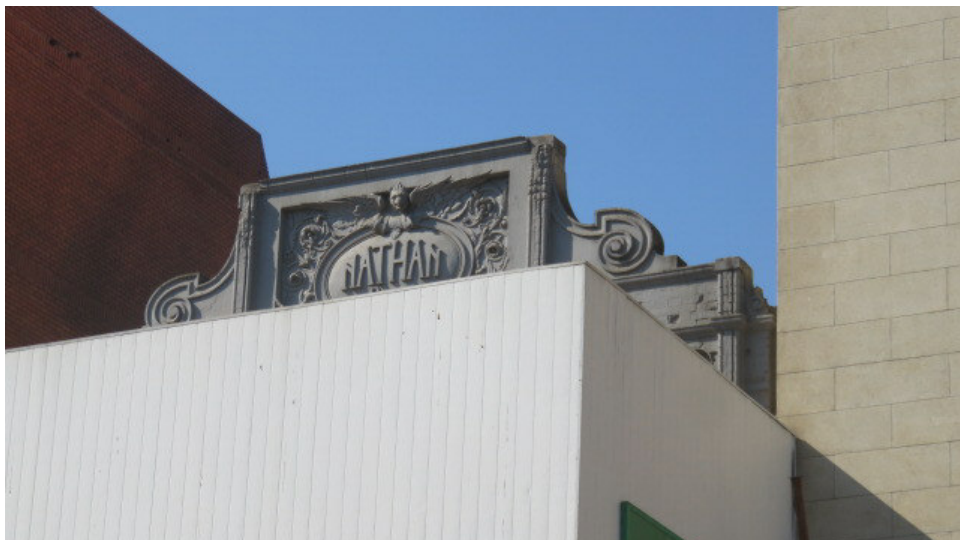
Plate 3 - Remains of previous plaster mouldings to front facade.JPG