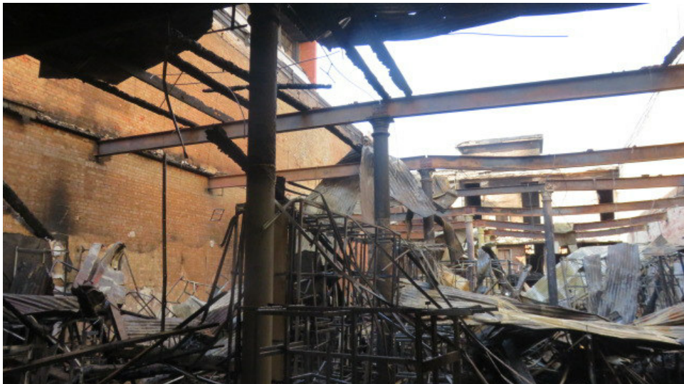
Plate 6 - Compromised beams that supported the mezzanine timber floor.JPG