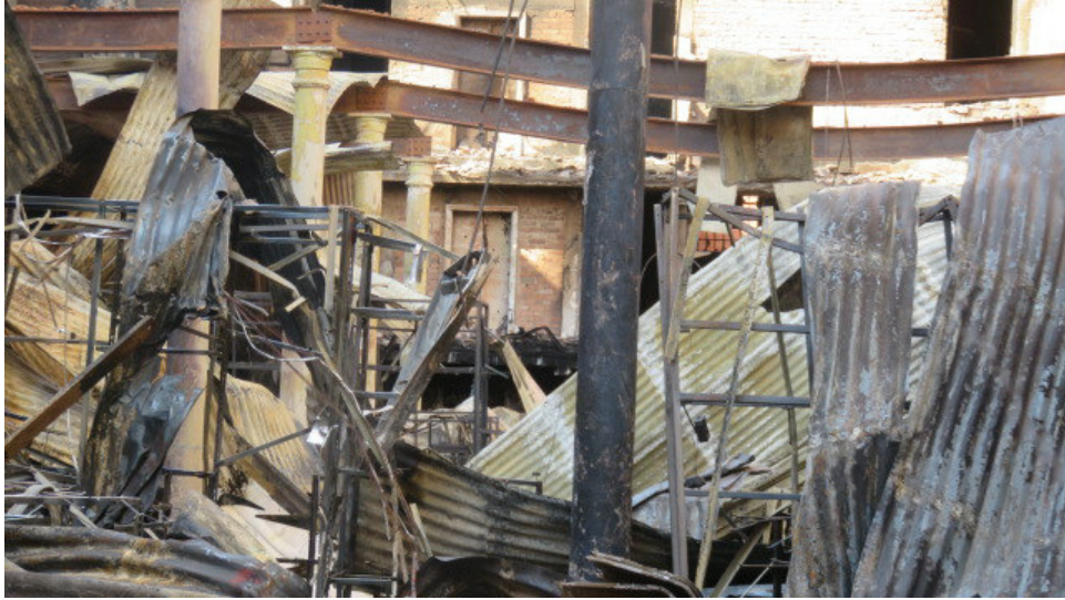
Plate 10 - Typical internal damage.JPG