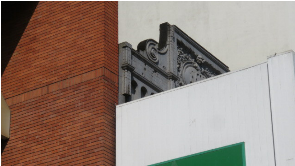
Plate 18 - Remains of plaster moulding behind new modern front facade.JPG