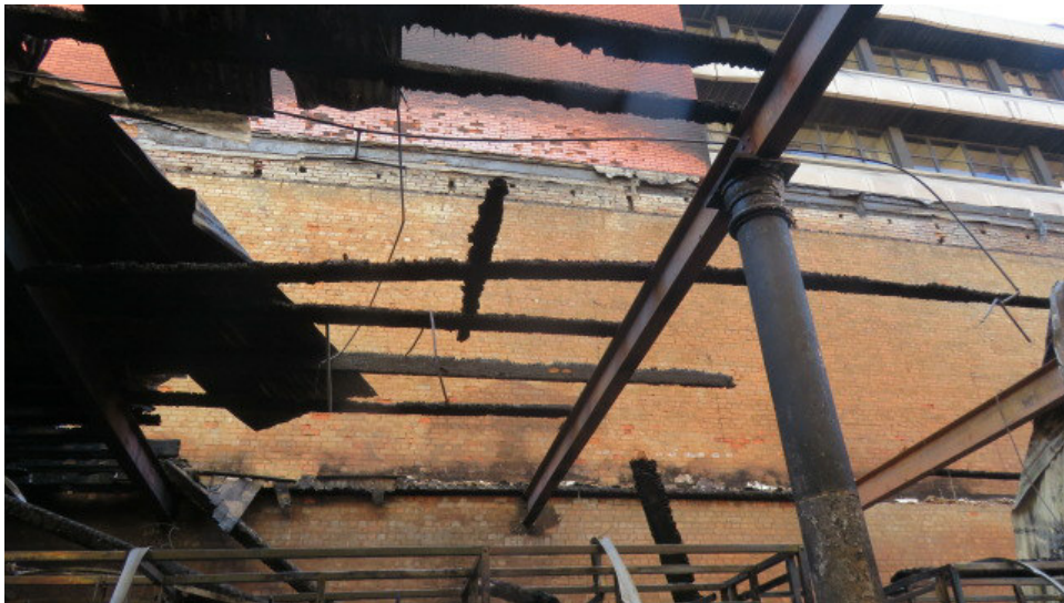
Plate 8 - Side walls adjacent to neighbouring structures.JPG