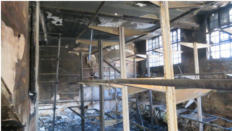
Plate 15 - Rear storage area beneath concrete beams and slabs with spalled plaster.JPG