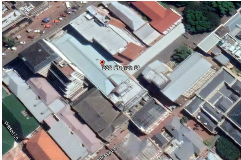
Plate 1 - Google Earth view of shop before fire damage.JPG