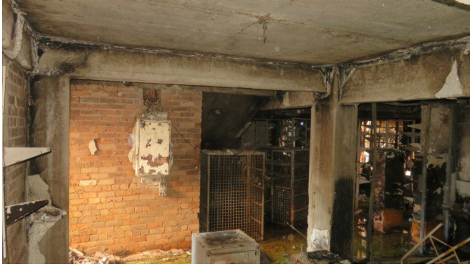
Plate 13 - Rear storage area with reinforced concrete columns beams and slab.JPG