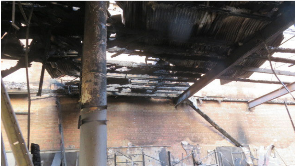
Plate 5 - Damaged mezzanine.JPG