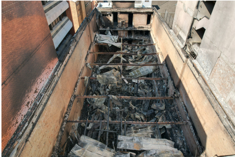
Plate 20 - Drone photograph indicates details of side walls.JPG