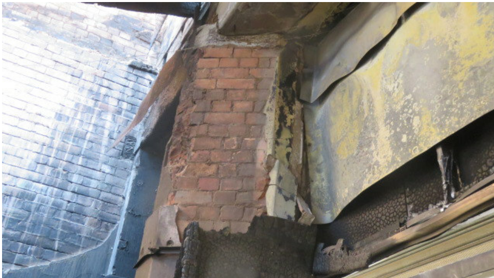
Plate 12 - Spalled brick piers that form part of the front facade.JPG