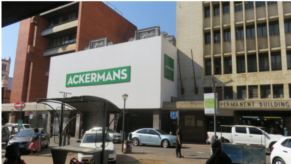
Plate 2 - Modern facade to structure.JPG