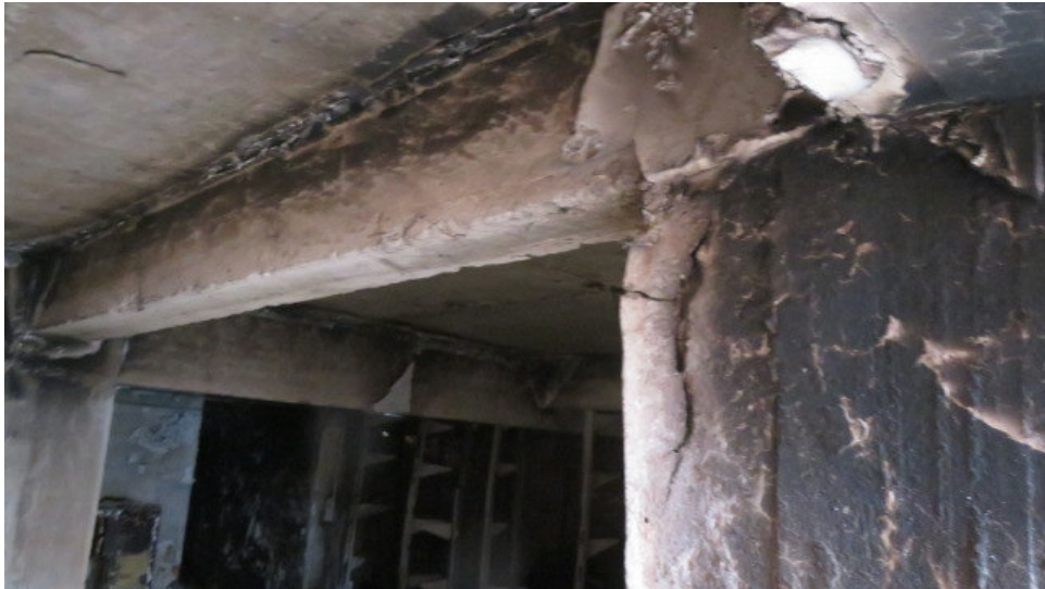
Plate 17 - Compromised walls at rear storage area.JPG