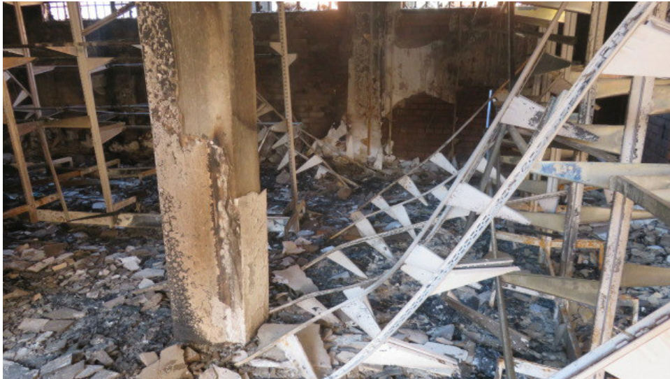
Plate 14 - Spalled plaster around concrete columns.JPG