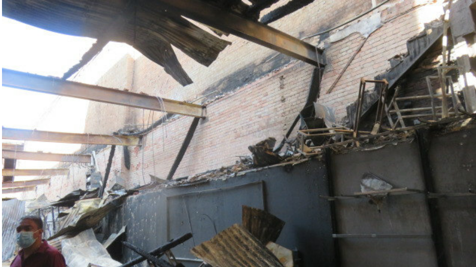
Plate 7 - Steel beams built into side walls.JPG