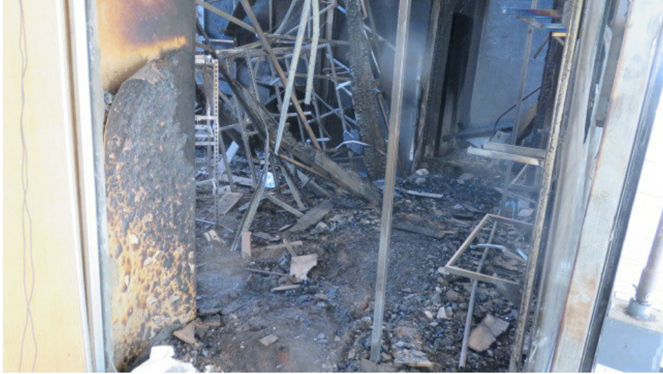
Plate 4 - Damaged interior.JPG