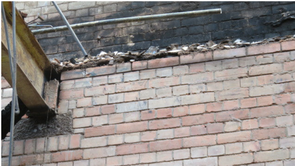
Plate 9 - Steel beam supported on concrete pads.JPG