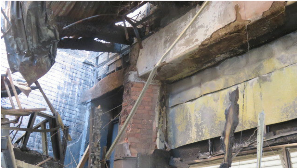
Plate 11 - Steel beams incorporated in front facade.JPG