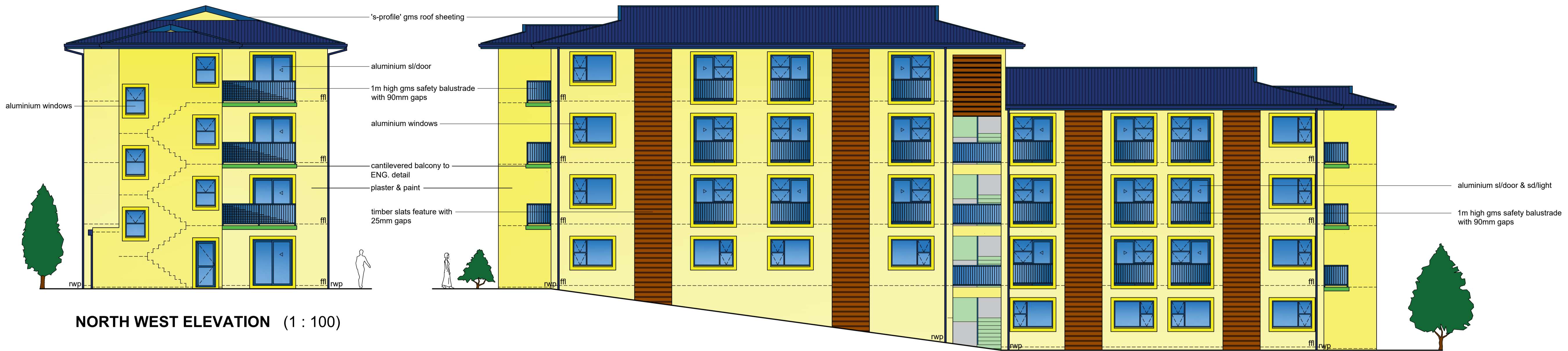
NORTH WEST ELEVATION (1 : 100)