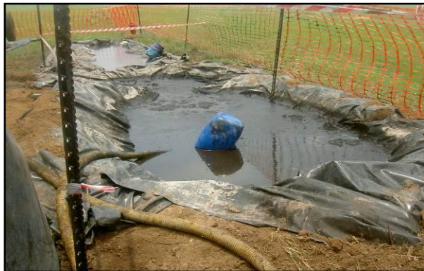
Sump area during drilling

The topsoil removed for the sumps will be kept separate from the overburden and stored separately for later reuse. The topsoil will be protected from being blown away or being eroded. The retained topsoil will be used to refill the sumps. Any spoils and drilling material will be transported off site and disposed of in an approved area. Should the retained topsoil be stored for an extended period of time it will be ameliorated with the correct fertilizer and reseeded.