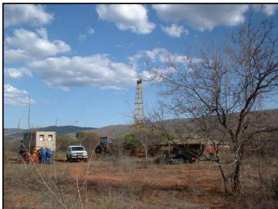
A drill site with the mobile laboratory.

Depending on the results obtained detailed geophysical surveys might be undertaken on the borehole.