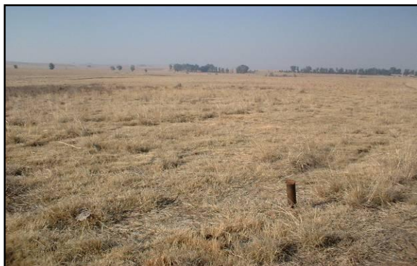
Borehole and sump area two years after drilling

After the drilling and sampling operations have been completed, each borehole collar will be surveyed and