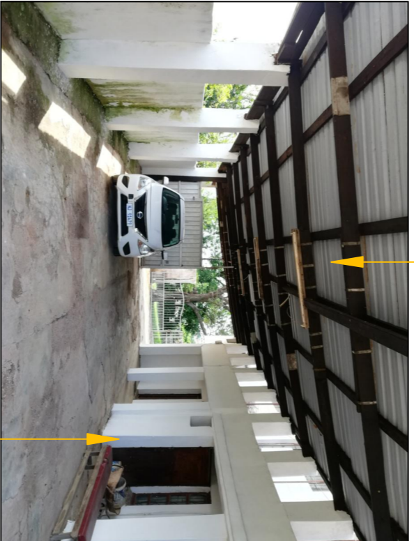
PORTION OF EXIST DWELLING V5