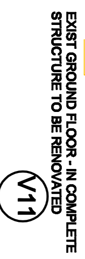
EXIST GROUND FLOOR - IN COMPLETE STRUCTURE TO BE RENOVATED V11

SITE PICTURES KINDLY REFER TO FLOOR PLAN FOR REFERENCE TO KEY VIEW POINTS