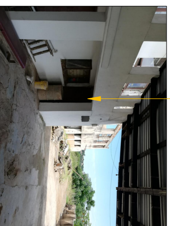
PORTION OF DWELLING & OUTBUILDING AT THE REAR OF THE SITE V10