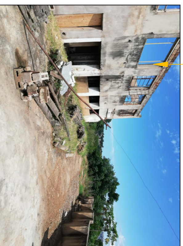
PORTION OF EXIST DWELLING V6