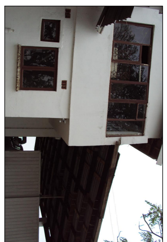
FIRST FLOOR OF EXIST DWELLING PART OF EXIST INCOMPLETE STRUCTURE TO BE REMOVED V2