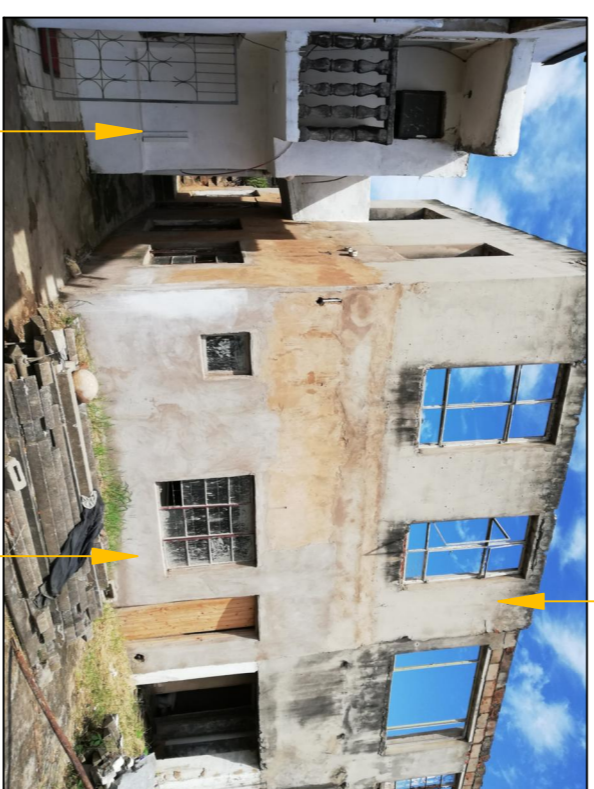
PORTION OF EX BLDG V7