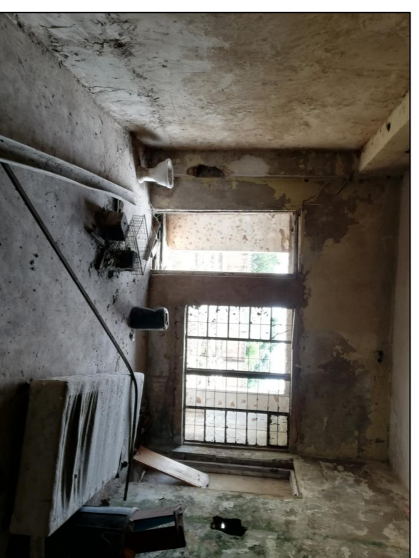
VIEW FROM INSIDE ANCILLARY UNIT V12