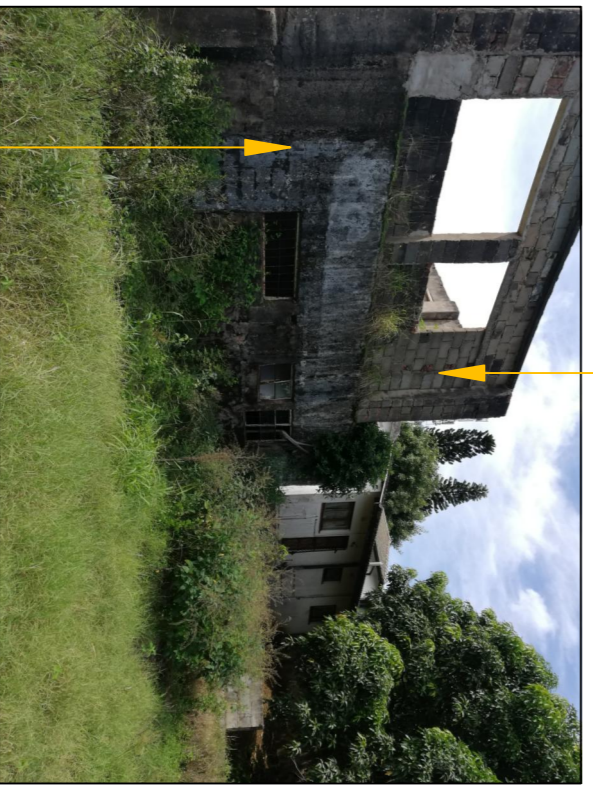
PORTION OF EXIST INCOMPLETE STRUCTURE TO BE REMOVED & MADE GOOD V9