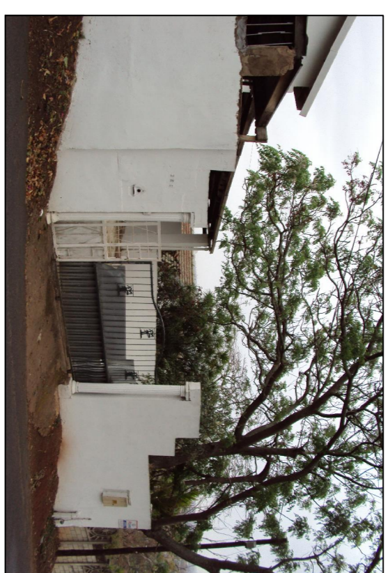
ENTRANCE OF PROPERTY FROM SMITHFIELD ROAD PART OF EXIST INCOMPLETE STRUCTURE TO BE REMOVED V3