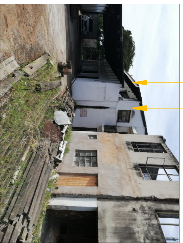
PORTION OF EXIST DWELLING