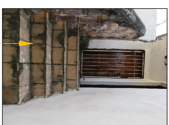
EXIST REAR STEPS PART OF EXIST INCOMPLETE STRUCTURE TO BE REMOVED V4