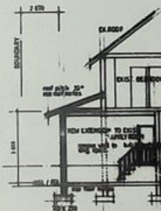
SECTION B-B scale 1:100