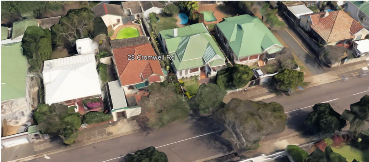
Low scale residential development around the park.