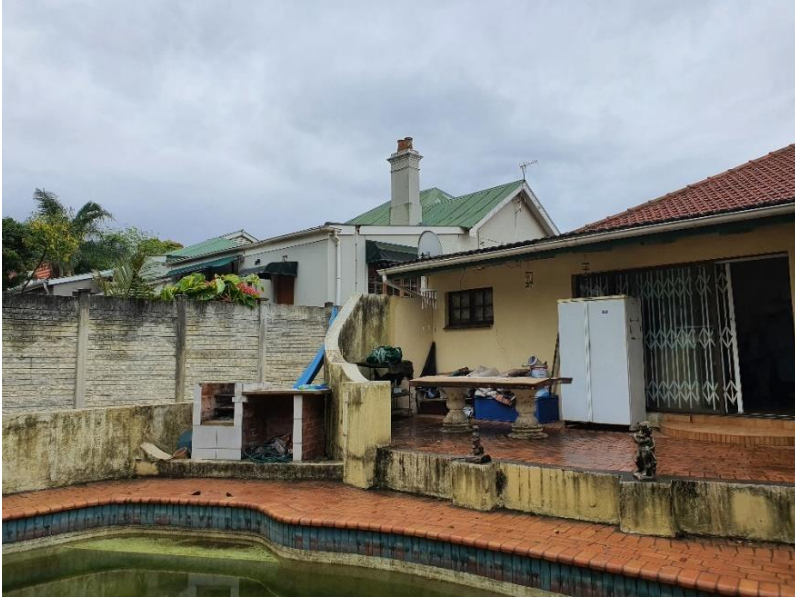
Back veranda alteration