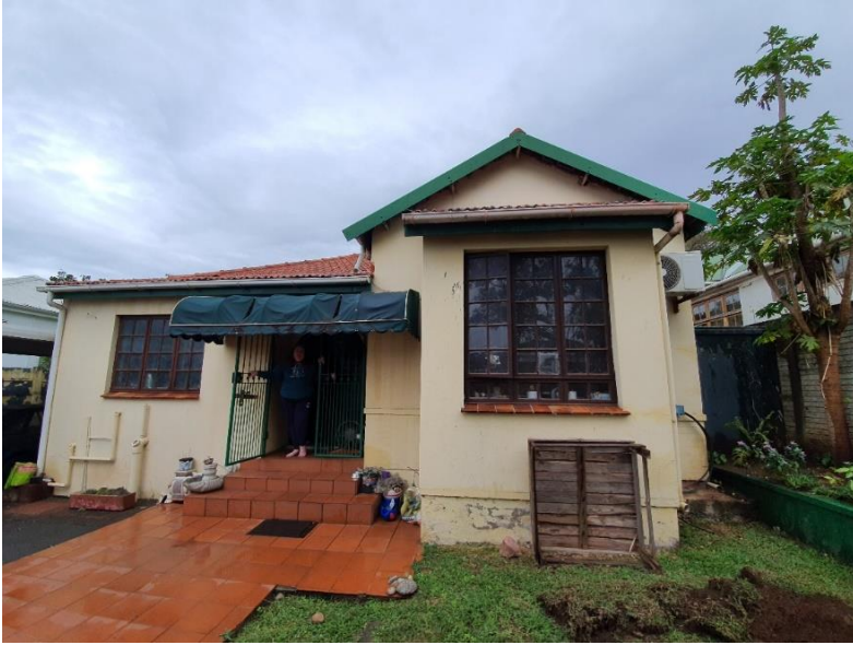
Front elevation, the veranda has been enclosed.