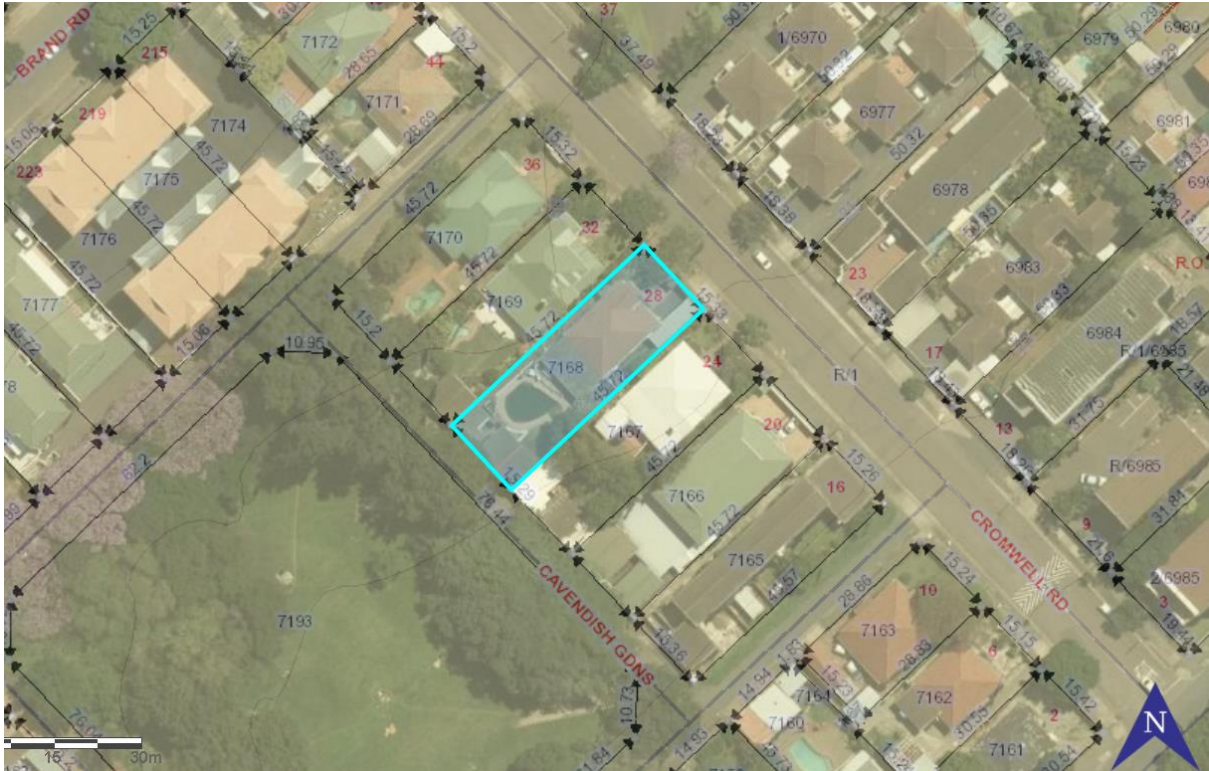
Location of 28 Cromwell Road the Cavendish Park off the lane.