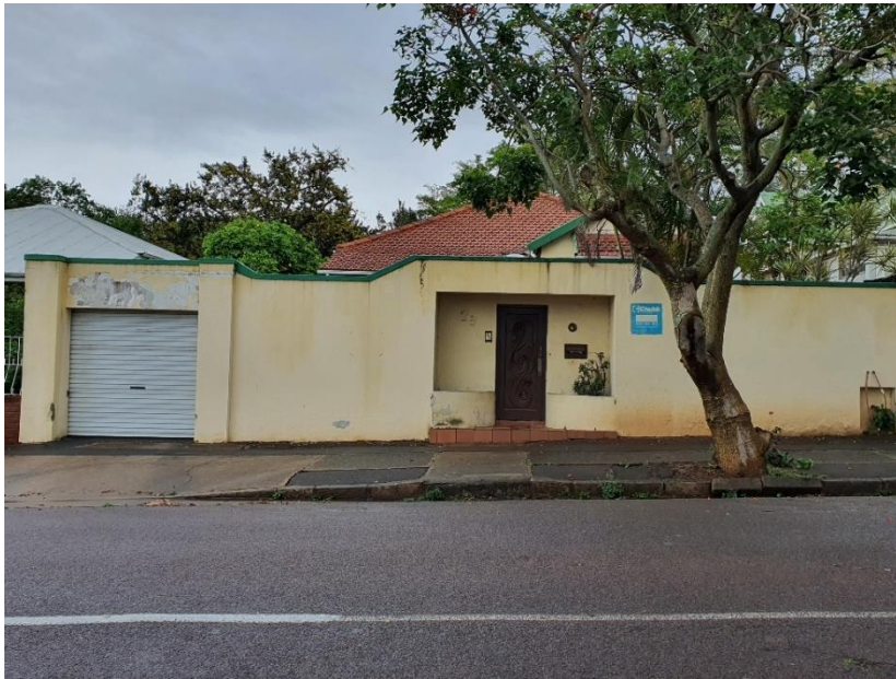
Streetscape, the building cannot be seen.