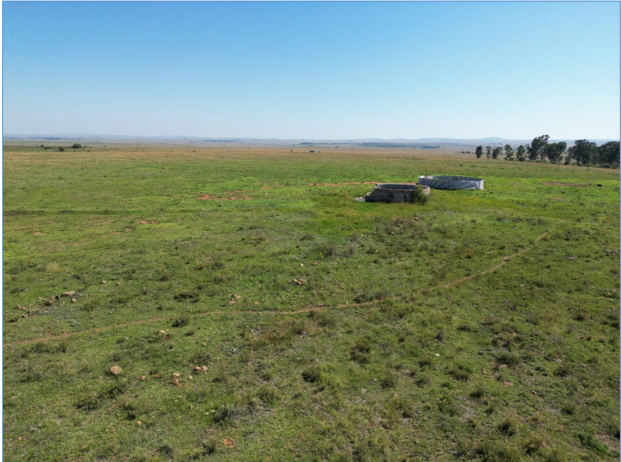
Plate 1: The site (taken towards the north)