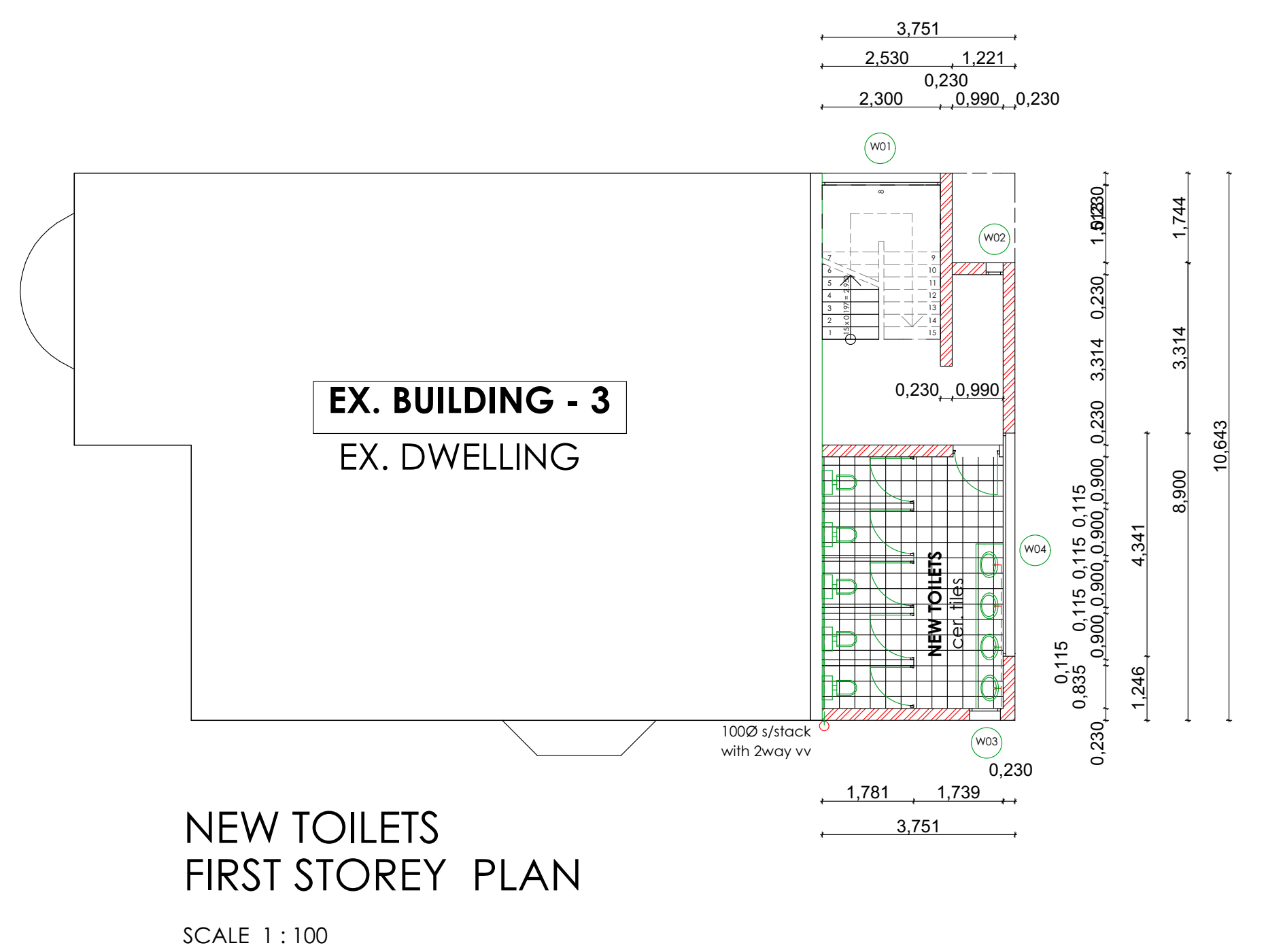
NEW TOILETS FIRST STOREY PLAN SCALE 1 : 100