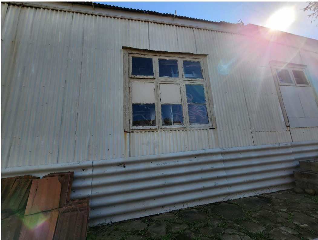
Image 4: Side elevation which faces the neighbouring property. Cottage pane windows are in poor condition.