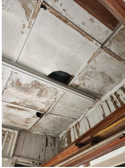
Image 5 and 6: As illustrated in the image above the roof and ceilings are severely damaged and are currently being supported by props. The roof has been damaged by both borer and water, and the ceilings have also been damaged by water. The degree of damage poses a hazard and has made the building unsafe for occupation. There are many holes in the ceiling boards.