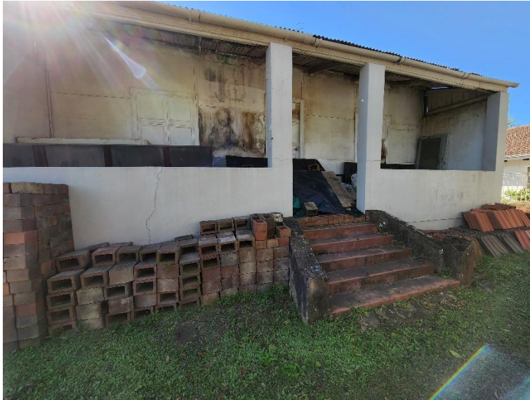
Image 1: Existing front elevation of the house which faces Effingham Rd. There is significant water damage to the walls and roof. There is also cracking to the walls.