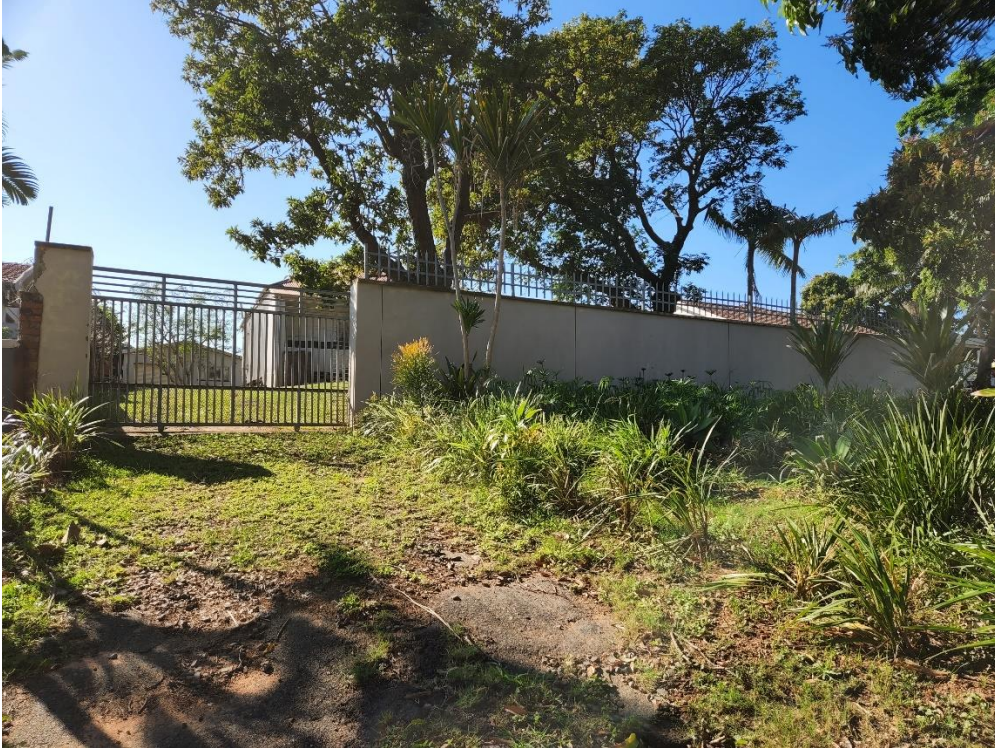
Image 12: View from the outside of the property – 296 Effingham Rd