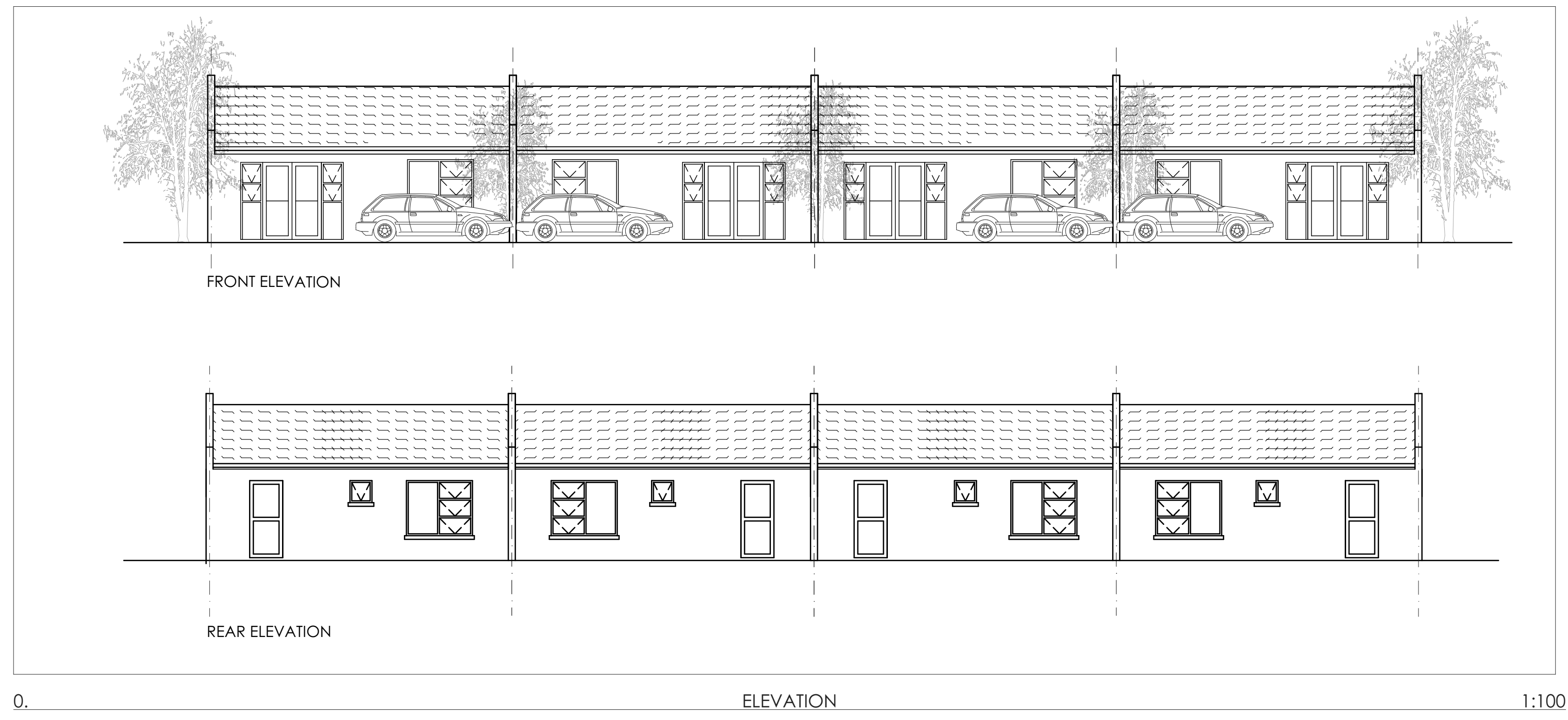
0. ELEVATION 1:100