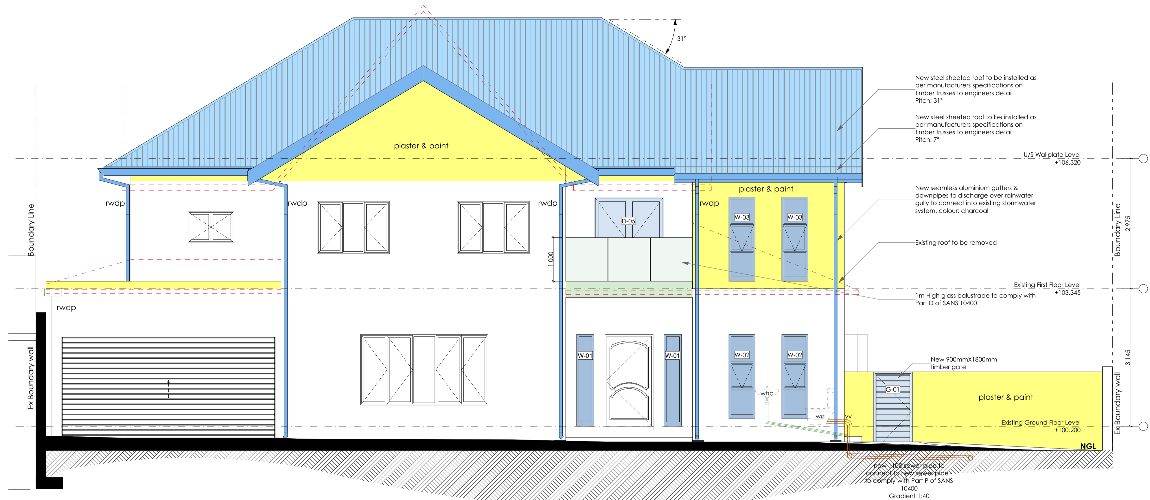
North West Elevation Scale 1:50

NOTES DO NOT SCALE OFF DRAWINGS No part of this design to be altered or reproduced without written permission. This drawing is the intellectual property of Sculpt Spaces and D&A Architects and may not be distributed without consent. ALL DIMENSIONS ARE TO BE TAKEN ON SITE PRIOR TO MANUFACTURING.