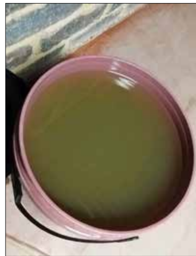
Communities in EPMLM villages are subjected to drink dirty water from the nearest rivers and wells after SDM failed to provide clean drinkable water.