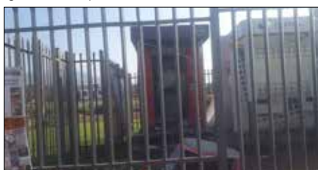
The police in Sekhukhune are searching for a group of unknown suspects who bombed an ABSA ATM at a Shell Garage in Ga-Rancho Village.