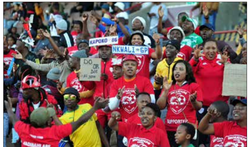
Babina Noko supporters singing and chanting, celebrating their team's victory after Sekhukhune United defeated Stellenbosch in the Nedbank Cup semi-finals clash at Cape Town on the weekend.

Both teams started the game like the house on fire in the first opening minutes pushing for an early goal, it was however, the host who exerted more pressure.