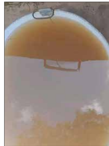
Residents from various villages in EPMLM during one of the water shortage marches organized earlier this year.