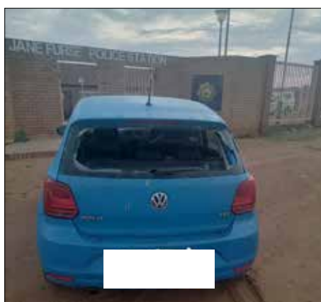
The VW Polo that was abandoned by the suspects before they fled after exchanging gunfire with police.