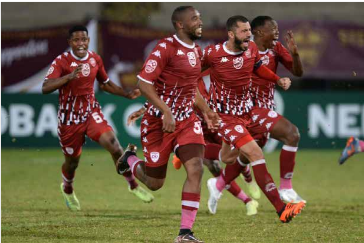
Sekhukhune United players celebrating after defeating Stellenbosch in Cape Town to advance to the finals of the Nedbank Cup.

SEKHUKHUNE - Sekhukhune United FC has historically advanced to the Nedbank Cup finals after defeating Stellenbosch FC 4-3 on penalty shootout in the tournament's semi-final match, played at the Danie Craven Stadium in Stellenbosch, Cape Town, on Sunday 7 May.