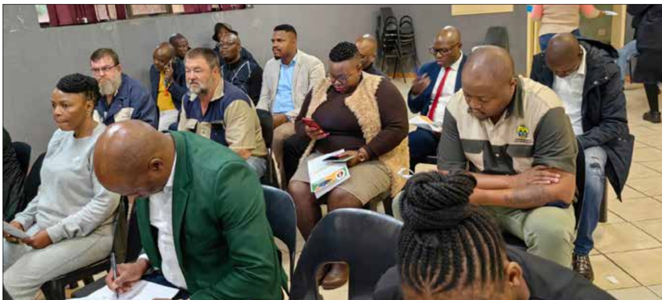
Some of the people at the Marble Hall Town Hall on Monday 08 May 2023 when the Ephraim Mogale Local Municipality completed its IDP/Budget consultation programme.

MARBLE HALL - To wrap up community engagements on draft Integrated Development Plan (IDP) budget, the Ephraim Mogale Local Municipality met with traditional leaders and people living with disabilities at the municipal town hall on Monday 08 May 2023.