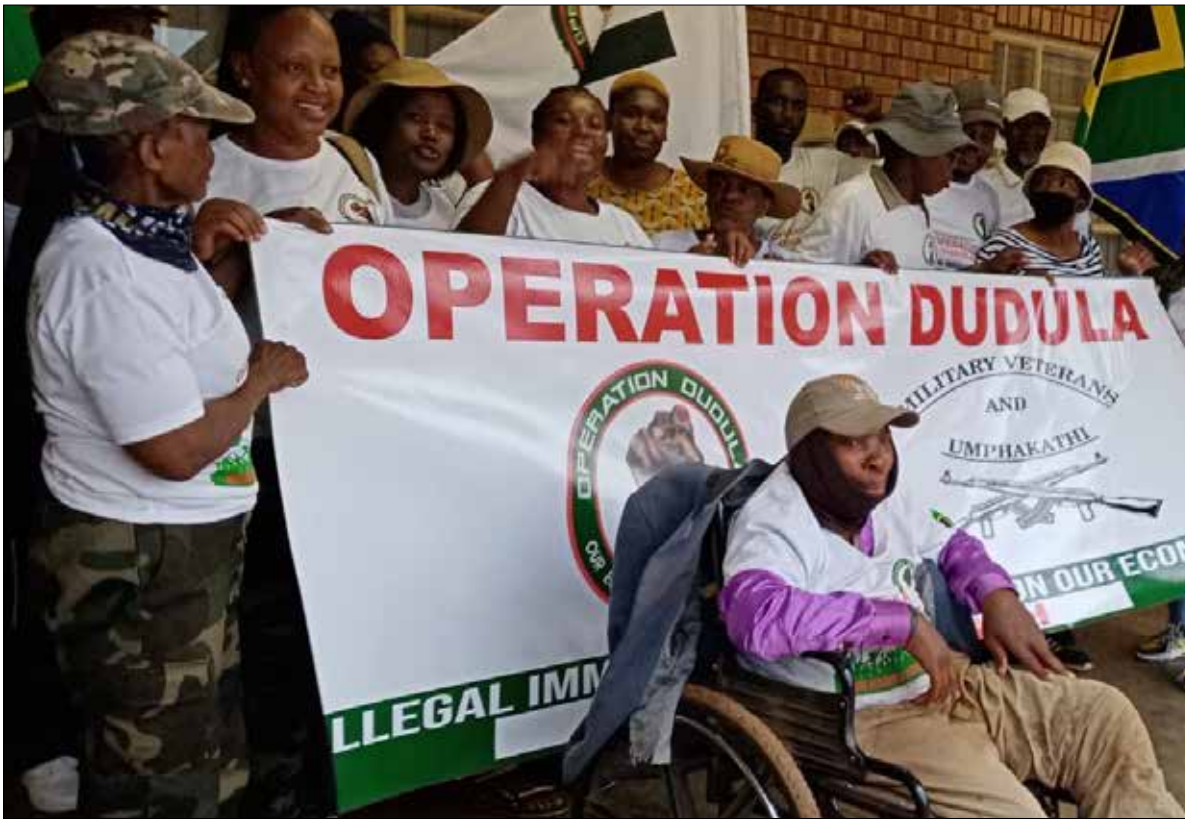
Operation Dudula Movement resolved to register as a new political party and contest the 2024 General Election.