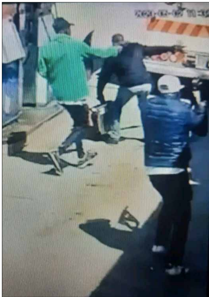
CASH: One of the alleged robbers was captured by cameras. Rob: The robbers went away with an undisclosed amount of money